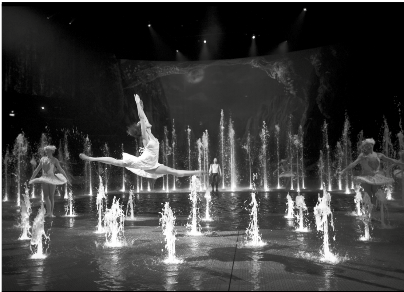
Back in 2020, amid the pandemic, the gaming operator announced the House of Dancing Water show at the City of Dreams Cotai property

"And towards the middle of November, we'll get back out of that and get started back on the remount for the House of Dancing Water," he added.