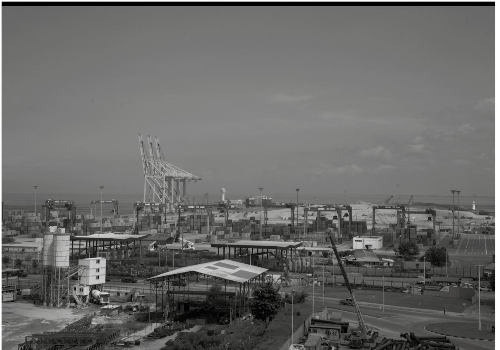
A view of the proposed site for a $553-million project to build a new, deep-water shipping container terminal in the Port of Colombo, yesterday

tens of billions of dollars each year to build roads, railways, ports and airports, typically in developing nations, to foster trade and goodwill toward China.