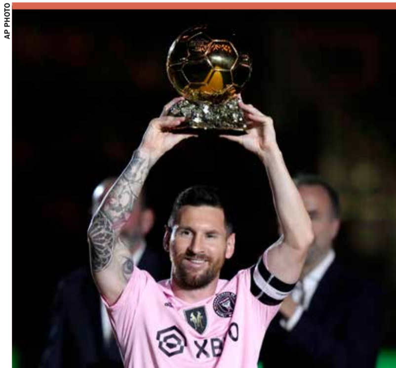
Inter Miami forward Lionel Messi holds his Ballon d'Or trophy before the team's club friendly soccer match against New York City FC

Messi — carrying the trophy in his left hand — walked to midfield on a gold carpet laid out across the pitch, where MLS Commissioner Don Garber was among those awaiting his arrival for a brief pregame ceremony. He embraced Garber, Inter Miami owners Jorge