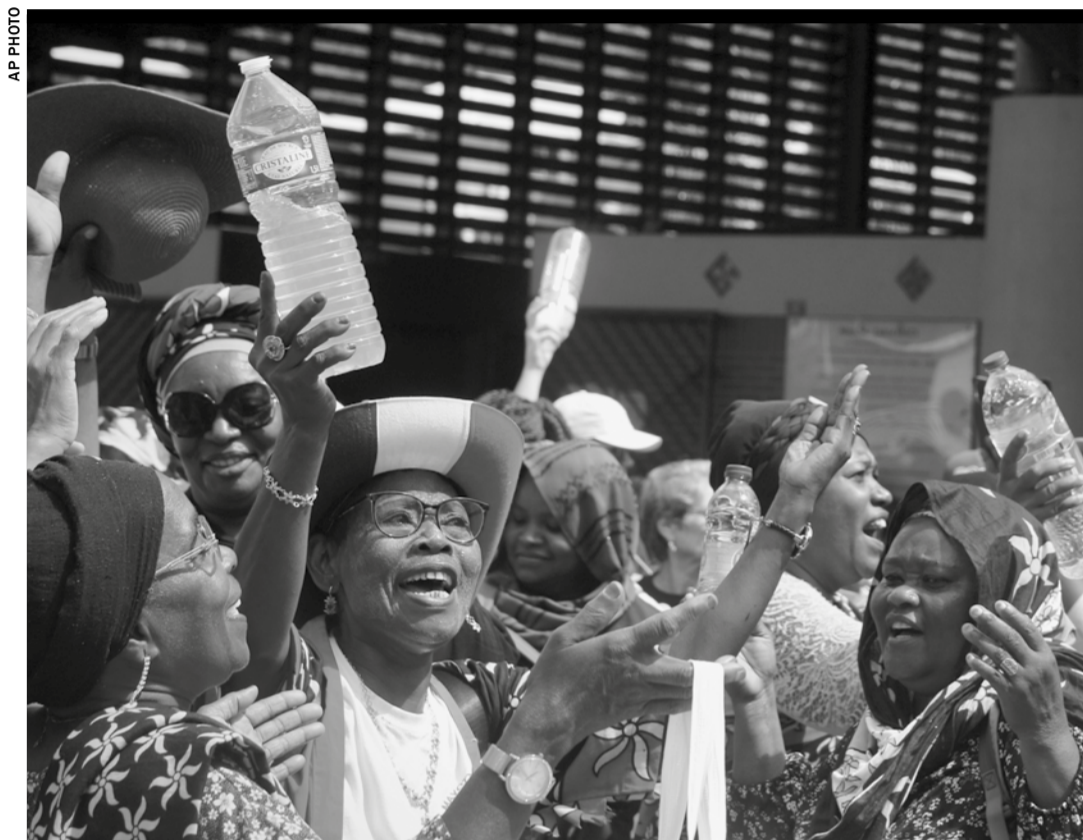
Demonstrators gather to protest the water crisis in Mamoudzou, on the French Indian Ocean territory of Mayotte

The water taps determine the rhythm of life in Mayotte, an island territory of about