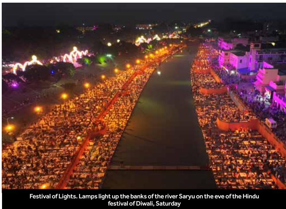
Festival of Lights. Lamps light up the banks of the river Saryu on the eve of the Hindu festival of Diwali, Saturday