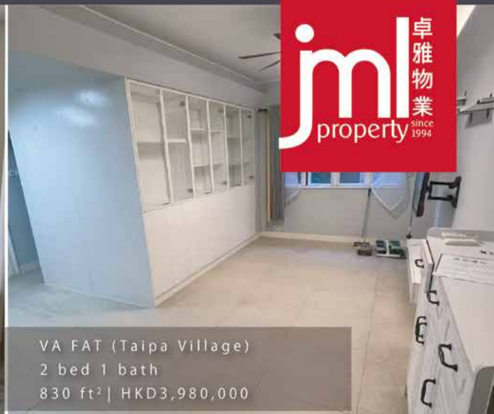
VA FAT (Taipa Village) 2 bed 1 bath 830 ft 2 | HKD3,980,000