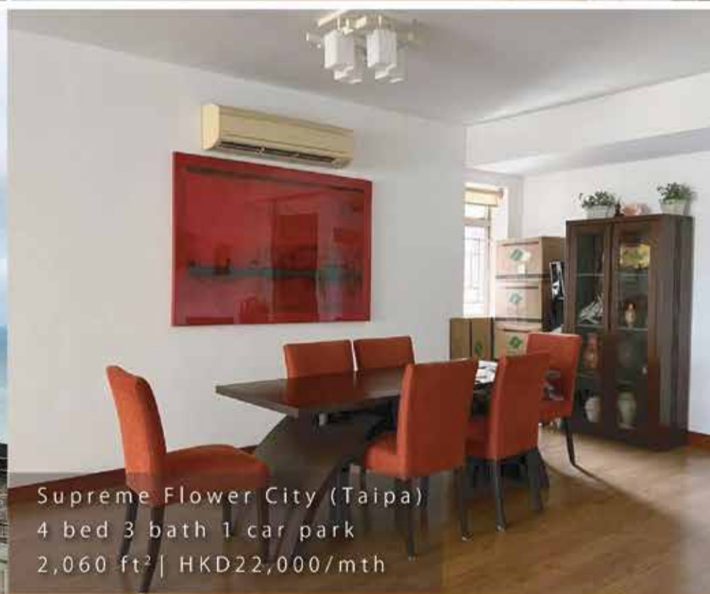
Supreme Flower City (Taipa) 4 bed 3 bath 1 car park 2,060 ft 2 | HKD22,000/mth