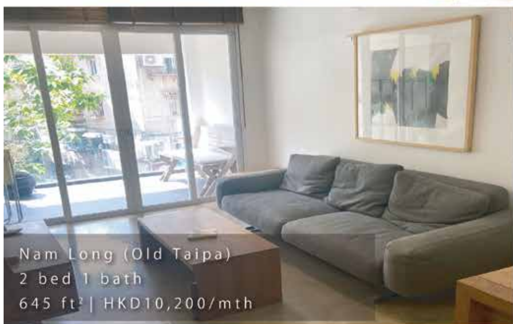
Nam Long (Old Taipa) 2 bed 1 bath 645 ft 2 | HKD10,200/mth