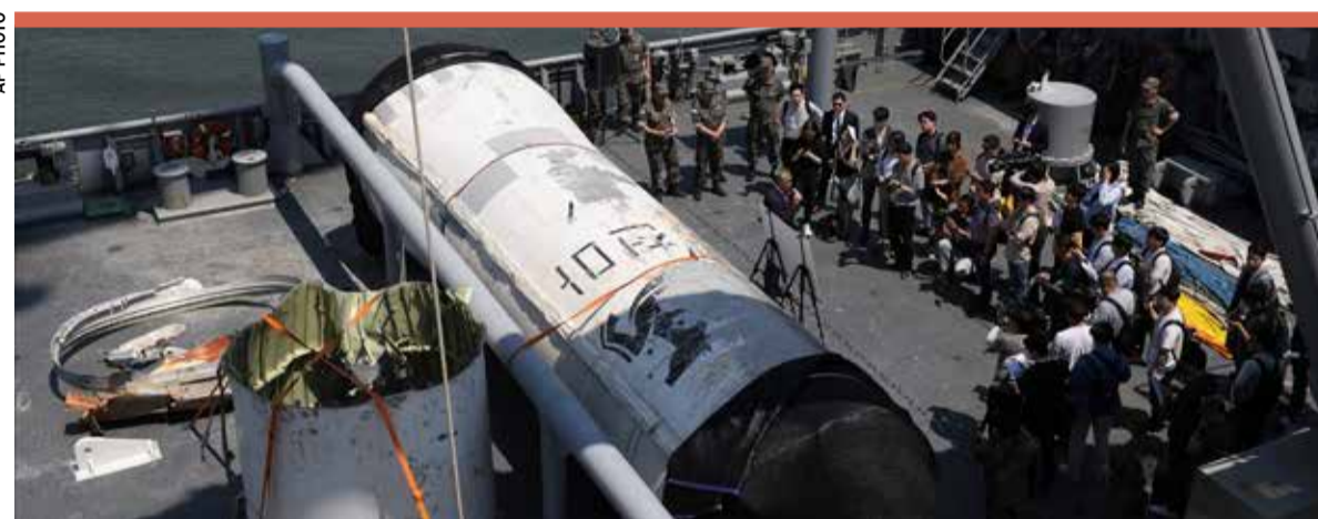
Objects salvaged by South Korea's military that are presumed to be parts of the North Korean space-launch vehicle that crashed into sea, last June

The North's notification came a day after rival South Korea warned it to cancel its launch or face con-