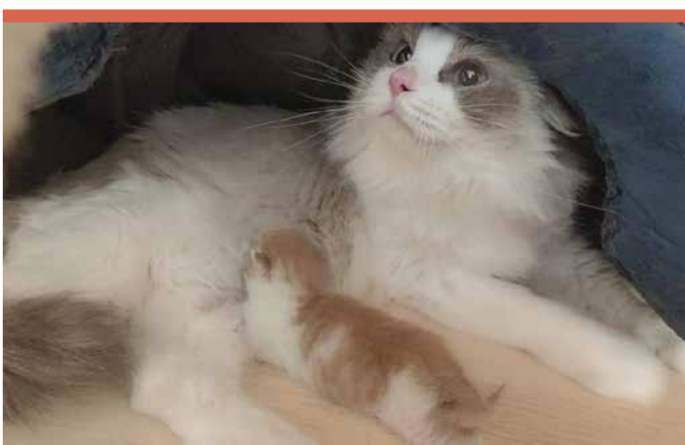
A newborn cloned kitten drinks milk from its surrogate mother

vious animal cloning processes had relied heavily