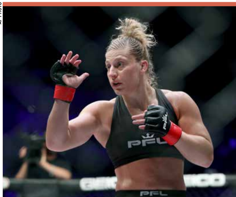
Two-time Olympic gold medalist Kayla Harrison

The deal was aided in part by Saudi Arabia's recent purchase into PFL. The purchase was relatively modest — $100 million according to the Financial Times — but even in a minority role, Saudi-backed SRJ Sports Investments ensured mixed-martial arts events will take place in that country.