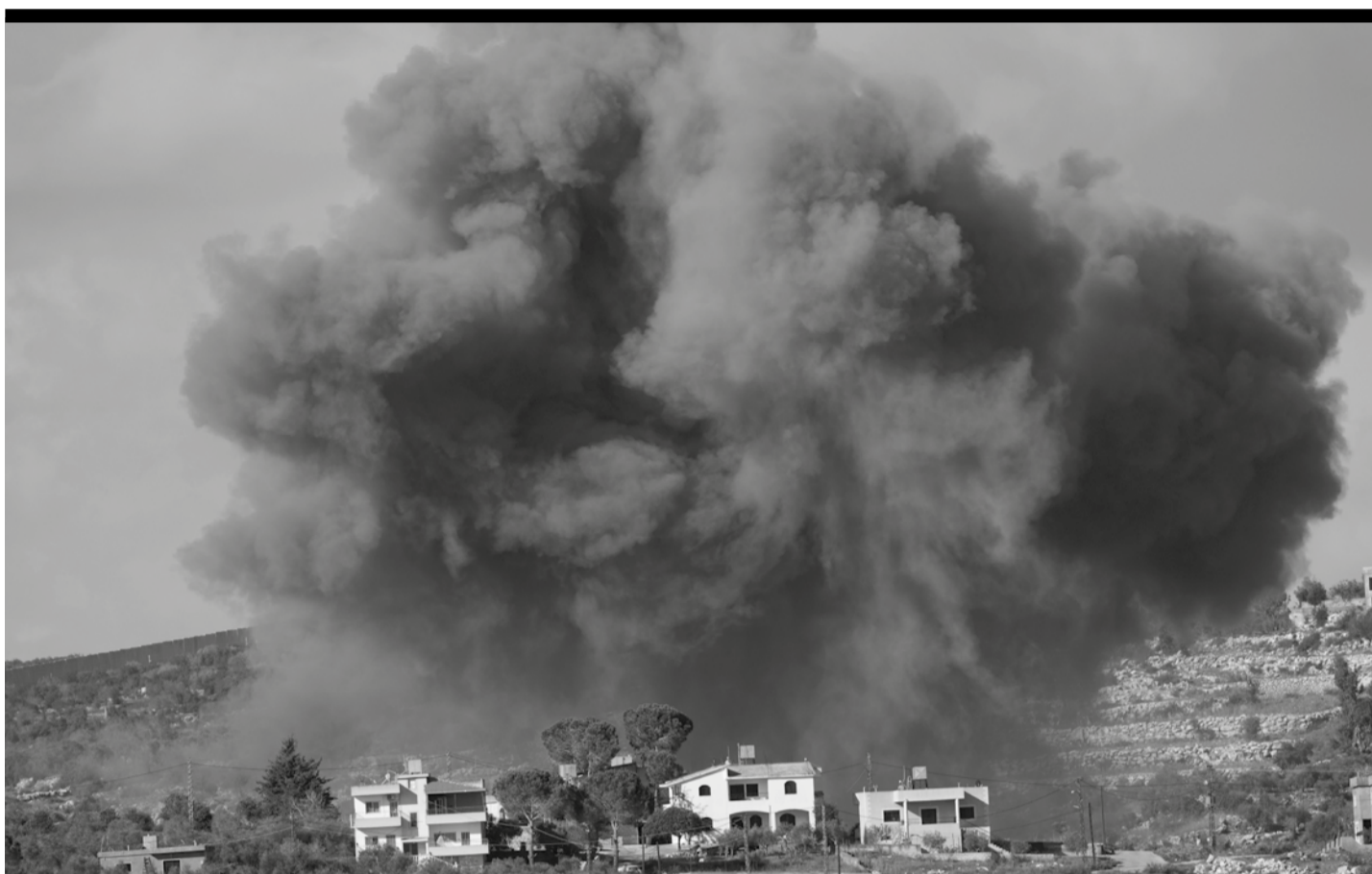
Black smoke rises from an Israeli airstrike on the outskirts of Aita al-Shaab, a Lebanese border village with Israel