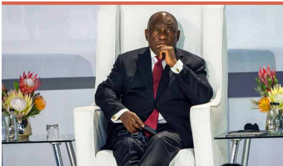
South African President Cyril Ramaphosa

traordinary meeting” and made the opening remarks because of South Africa’s position as current chair of BRICS.