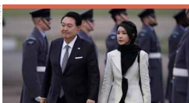
South Korea's President Yoon Suk Yeol and first lady Kim Keon Hee, arrive at Stansted Airport

He's also scheduled to hold talks with Prime Minister Rishi Sunak focused on trade, technology and defense. The two countries will officially launch talks on an "upgraded" free trade agreement to replace their current deal, which lar-