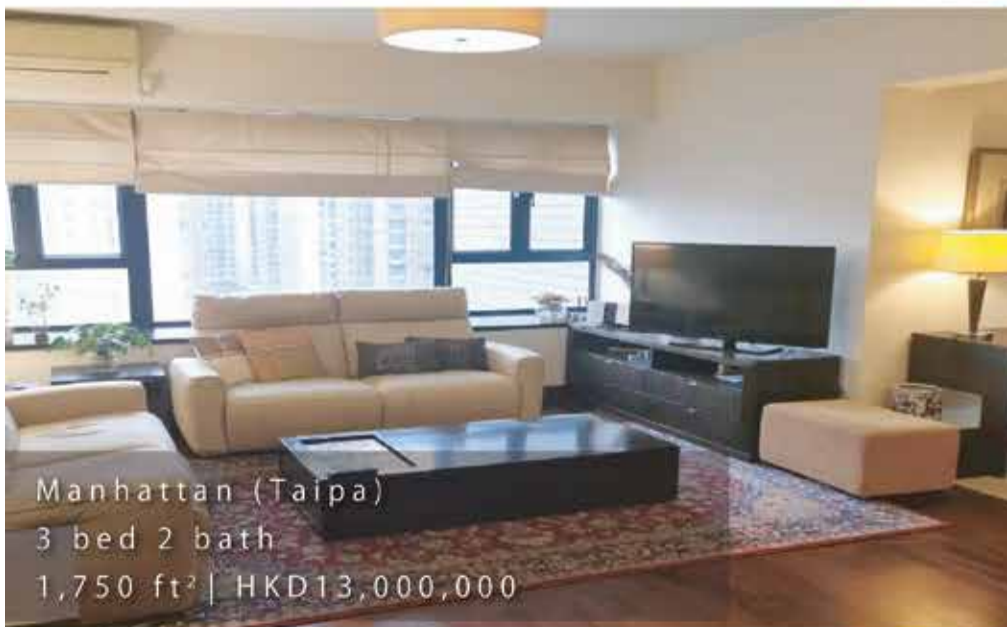
Manhattan (Taipa) 3 bed 2 bath 1,750 ft 2 | HKD13,000,000