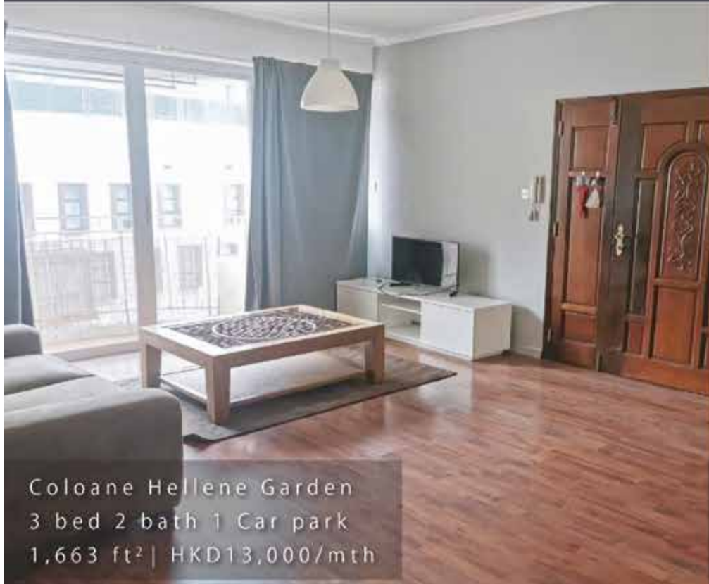
Coloane Hellene Garden 3 bed 2 bath 1 Car park 1,663 ft 2 | HKD13,000/mth