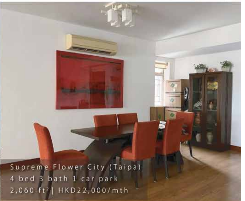
Supreme Flower City (Taipa) 4 bed 3 bath 1 car park 2,060 ft 2 | HKD22,000/mth