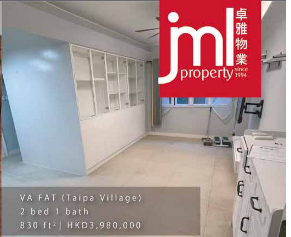
VA FAT (Taipa Village) 2 bed 1 bath 830 ft 2 | HKD3,980,000