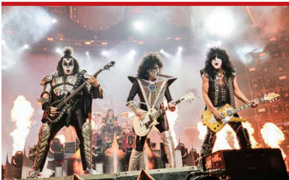
Gene Simmons (left) Tommy Thayer and Paul Stanley of KISS perform during the final night of the "Kiss Farewell Tour"