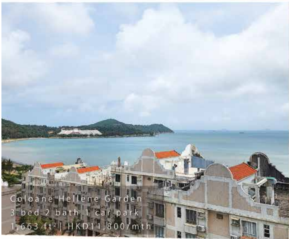
Coloane Hellene Garden 3 bed 2 bath 1 car park 1,663 ft 2 | HKD11,800/mth