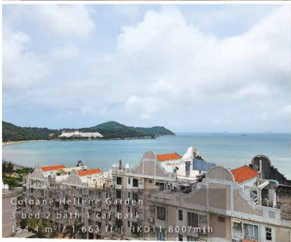
Coloane Hellene Garden 3 bed 2 bath 1 car park 154.4 m 2 / 1,663 ft 2 | HKD11,800/mth