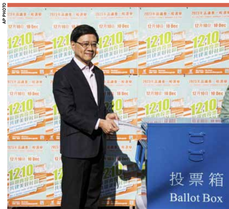
Hong Kong's Chief Executive John Lee casts his ballot at a polling station during the District Council elections in Hong Kong, yesterday

The district councils, which primarily handle municipal matters such as organizing construc-