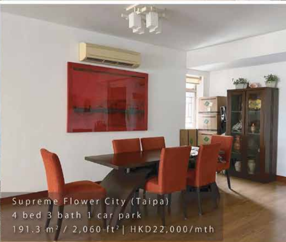
Supreme Flower City (Taipa) 4 bed 3 bath 1 car park 191.3 m 2 / 2,060 ft 2 | HKD22,000/mth