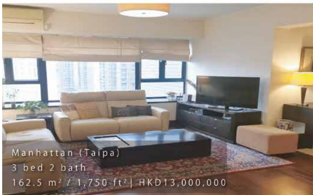
Manhattan (Taipa) 3 bed 2 bath 162.5 m 2 / 1,750 ft 2 | HKD13,000,000