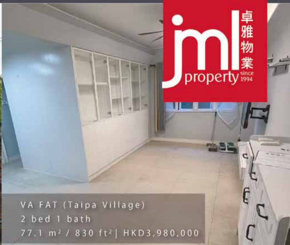
VA FAT (Taipa Village) 2 bed 1 bath 77.1 m 2 / 830 ft 2 | HKD3,980,000