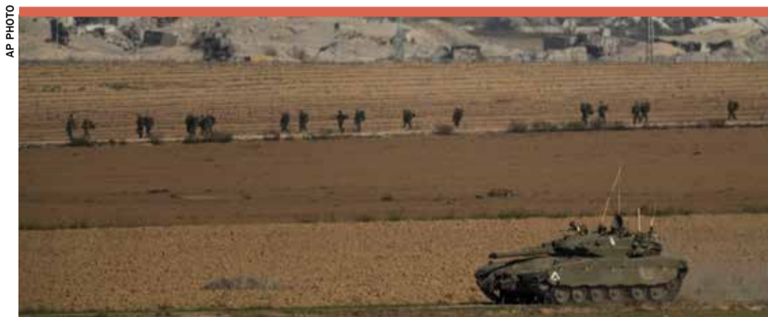
Israeli troops are seen near the Gaza Strip border, in southern Israel yesterday

U.N. Secretary-General Antonio Guterres, who invoked a rarely-used power last week to call for a cease-fire, said "we are facing a severe risk of collapse of the humanitarian system."