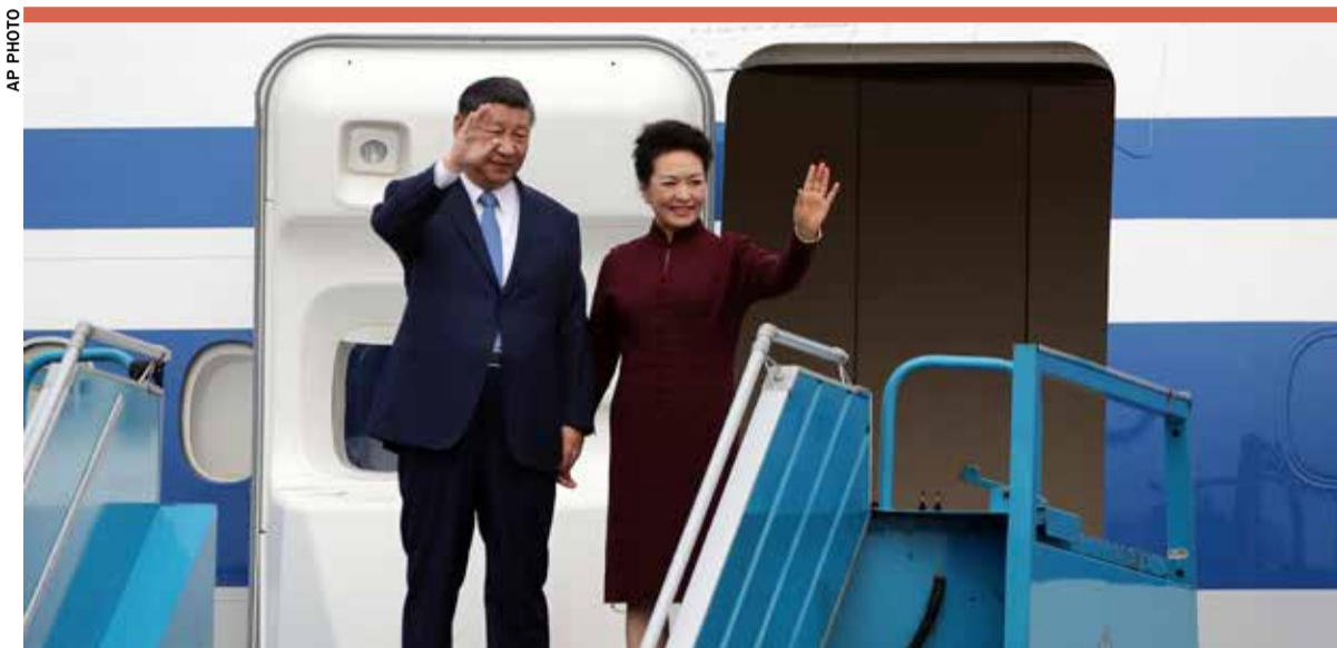
Chinese President Xi Jinping and his wife Peng Liyuan wave as they arrive at Noi Bai International airport in Hanoi

Xi's visit marks 15 years of China being a "comprehensive strategic partner" of Vietnam, the highest official designation for a