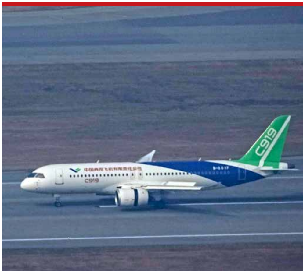
The Chinese-made C919 arrives at the Hong Kong International Airport in Hong Kong, yesterday