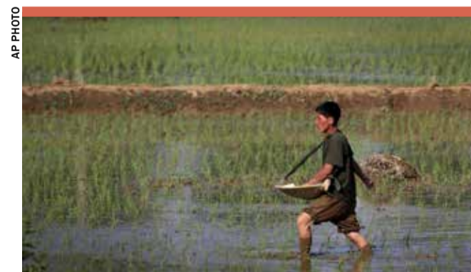
A farmer fertilizes rice seedlings in fields located along a highway in Pyongyang

Worldwide, the number of people having precarious access to food rose to nearly 2.4 billion in 2022 from just over 1.6 billion in 2015, the report said.