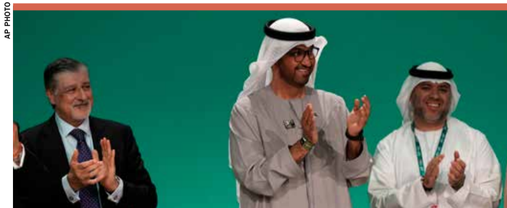
COP28 President Sultan al-Jaber, center, claps after passing the global stocktake at the U.N. Climate Summit yesterday, in Dubai

The new deal had been floated early yesterday and was stronger than a draft proposed days earlier, but had loopholes that upset critics. Analysts and delegates wondered if there was going to be a floor fight over