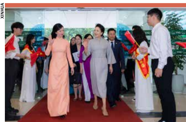
Peng Liyuan, spouse of President Xi, accompanied by Phan Thi Thanh Tam, spouse of Vietnamese President Vo Van Thuong, visits Vietnam National University, Hanoi

Xi's visit to Vietnam shows the great importance China attaches to Vietnam-China relations and will inject strong impetus into the further development of bilateral relations, said the scholar.