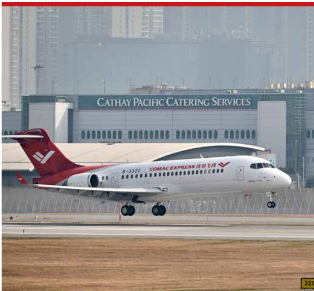
The Chinese-made ARJ21 touch down at the Hong Kong International Airport