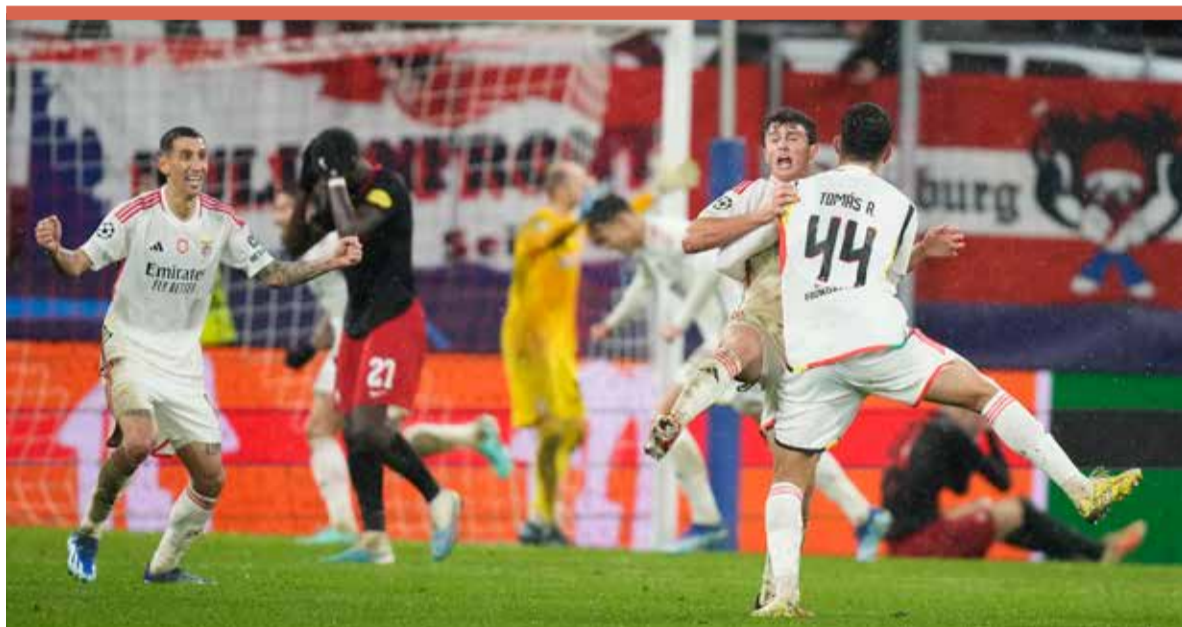
Benfica's Joao Neves (second from right) Tomas Araujo and Di Maria celebrate after Cabral scored

League, surpassing Lionel Messi, who found the net for Paris Saint-Germain in 2022. Javier Zanetti was 37 when he scored in Inter Milan's 4-3 win over Tottenham in 2010.