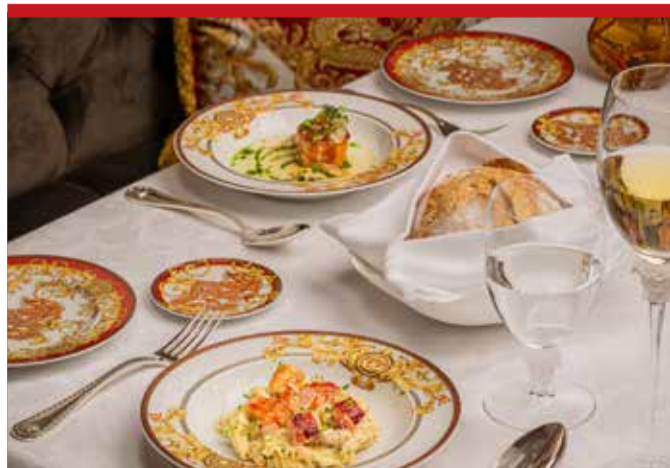
Celebrate Christmas and bid 2023 a grand farewell with a sumptuous feast at Don Alfonso 1890 in Palazzo Versace Macau

In addition to the beautiful, shimmering lights of Jardim Secreto, guests can immerse themselves in a series of "Grand Lisboa Palace Live Performances" throughout the resort, set to captivate hearts until the year's end. Adding a creative twist to the festivities, the "GLP Art Workshops" invite guests to express their holiday spirit by decorating Christmas photo frames, wreaths, and trees – crafting memories to cherish.