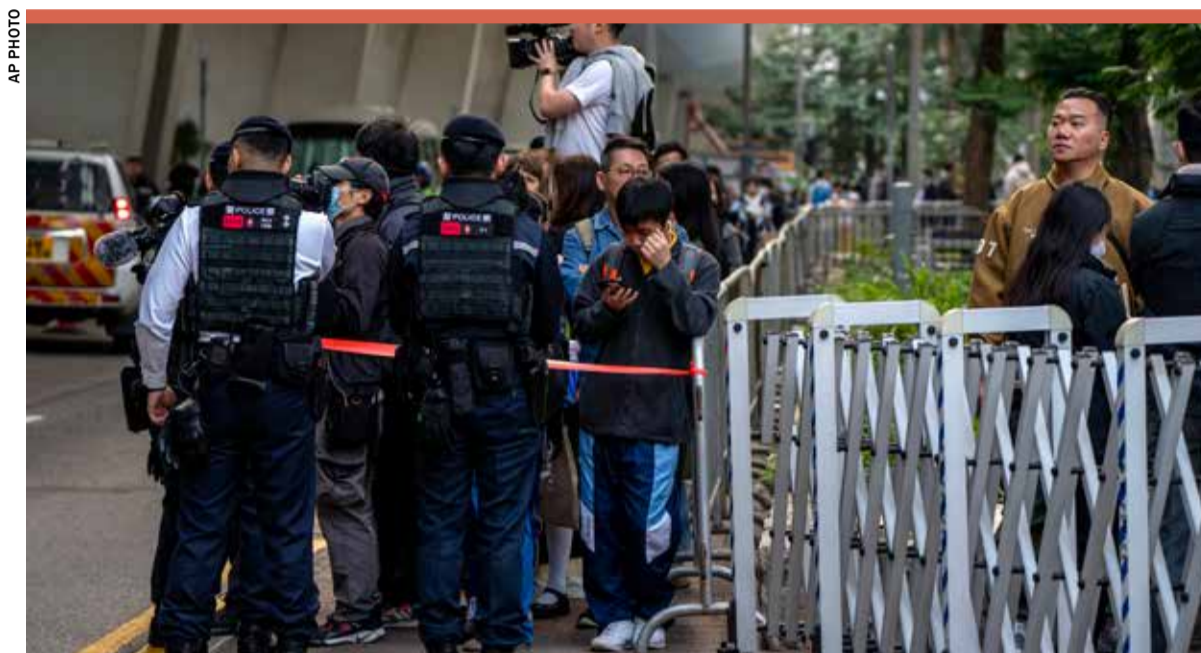
Policemen stand guard as they keep a watchful eye on people gathered in a cordoned off area as a vehicle believed to be carrying Jimmy Lai arrives at West Kowloon Magistrates' Courts, yesterday