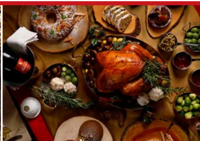
Enjoy a range of festive delicacies and treat your taste buds at Grand Lisboa with loved ones