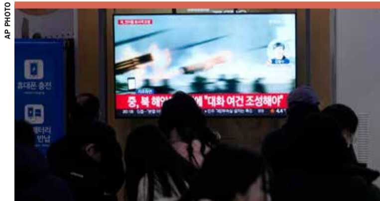
A TV screen shows a file image of North Korea's military exercise during a news program at the Seoul Railway Station in Seoul, South Korea, Jan. 6

Calling South Korea's military "gangsters" and "clowns in military uniforms," Kim Yo Jong suggested its possible future miscalculation of North Korean moves could cause an accidental clash between the rivals, jeopardizing the safety of Seoul, a city of 10 million people which is only an hour's drive from the land border. MDT/AP