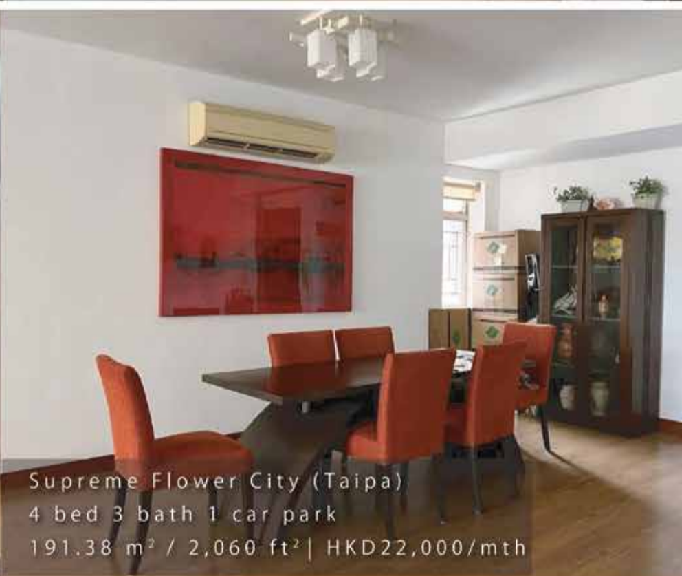
Supreme Flower City (Taipa) 4 bed 3 bath 1 car park 191.38 m 2 / 2,060 ft 2 | HKD22,000/mth