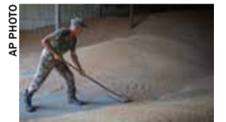
Polish farmers who had blockaded a border crossing to Ukraine ended their protest after reaching an agreement with the government that met their demands, Poland's state news agency PAP reported Saturday. The frustration of the farmers was one of the challenges facing the new Polish government of Prime Minister Donald Tusk, which seeks to support Ukraine while also addressing the demands of Polish farmers and truckers whose livelihoods have been hurt by the war.

Israel cut off food, clean water, medicine, electricity and fuel deliveries to Gaza immediately after the Hamas attack. In response to U.S. pressure it allowed a trickle of aid in through Egypt in late October, and the number of trucks has increased from about 100 to up to 200 every day. MDT/AP