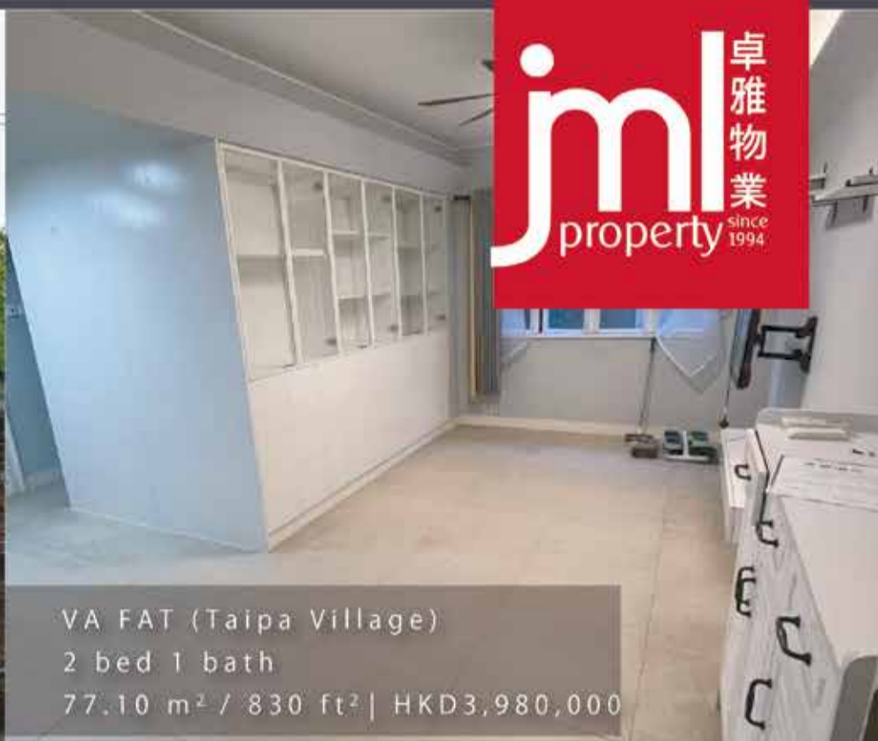
VA FAT (Taipa Village) 2 bed 1 bath 77.10 m 2 / 830 ft 2 | HKD3,980,000