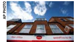
UK police have opened a fraud investigation into Britain's Post Office over a miscarriage of justice that saw hundreds of postmasters wrongfully accused of stealing money when a faulty computer system was to blame. The Metropolitan Police force said late Friday that it is investigating "potential fraud offences arising out of these prosecutions," relating to money the Post Office received "as a result of prosecutions or civil actions" against accused postal workers.