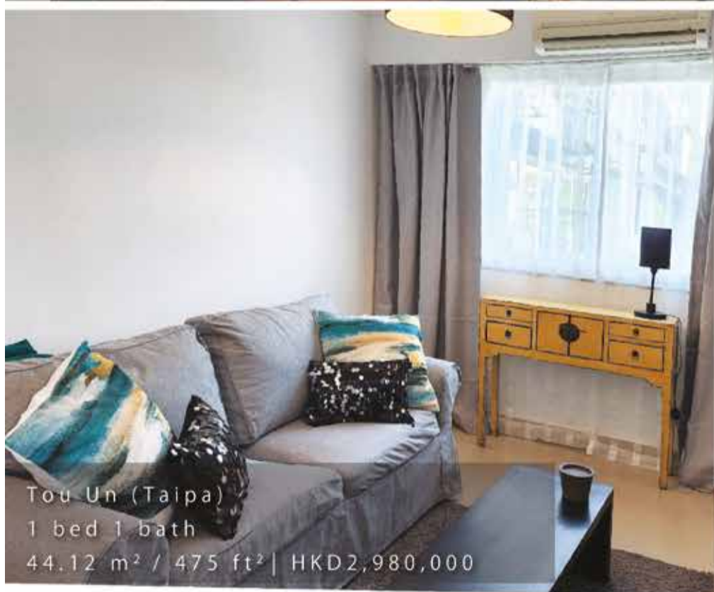
Tou Un (Taipa) 1 bed 1 bath 44.12 m 2 / 475 ft 2 | HKD2,980,000