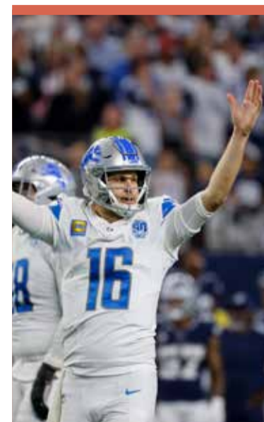
Detroit Lions quarterback Jared Goff reacts after throwing a touchdown pass against the Dallas Cowboys

But Matt Schaub suffered a Lisfranc injury to his right foot executing a quarterback sneak at Tampa Bay and missed the rest of the season.