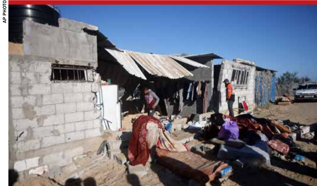
Palestinians salvage what they can from their belongings following Israeli airstrikes on Khan Younis, Gaza Strip

Chinese chess, called xiangqi in Chinese, is a traditional board game that remains popular, particularly among older people.