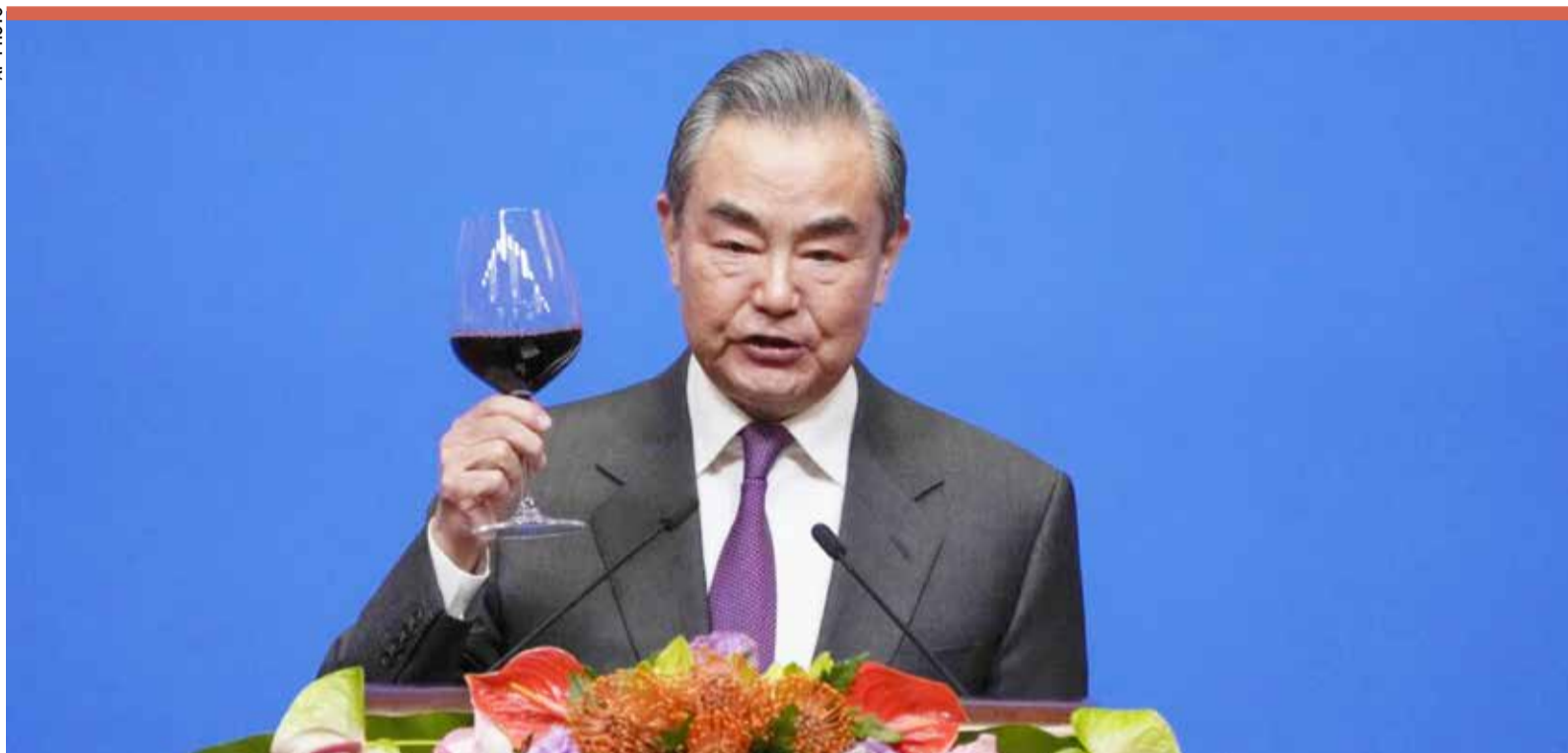
Chinese Foreign Minister Wang Yi gives a toast to invited guests after delivering a speech at a reception for Commemoration of the 45th Anniversary of China-U.S. Diplomatic Relations at the Diaoyutai Guest House in Beijing, Jan. 5

“The world is currently undergoing profound changes unseen in a century,” Wang said. “We must think about how to calibrate the direction of the large ship of China-U.S. relations (and) avoid hidden reefs and dangerous shoals.”