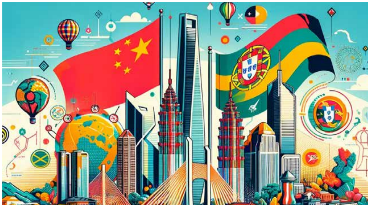
An AI-generated artistic illustration that visually represents the connection between the Portuguese Speaking Countries and the Greater Bay Area in China. The image symbolizes the economic and cultural ties between these regions through a combination of symbolic elements

However, the PSCs offer immense potential, with large, young populations, emerging markets, and rich natural resources. Their economic growth, although slower compared to the GBA, has been steady, with coun-