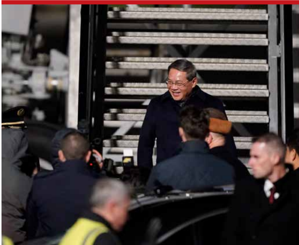
Premier Li Qiang arrives at Dublin Airport in Dublin