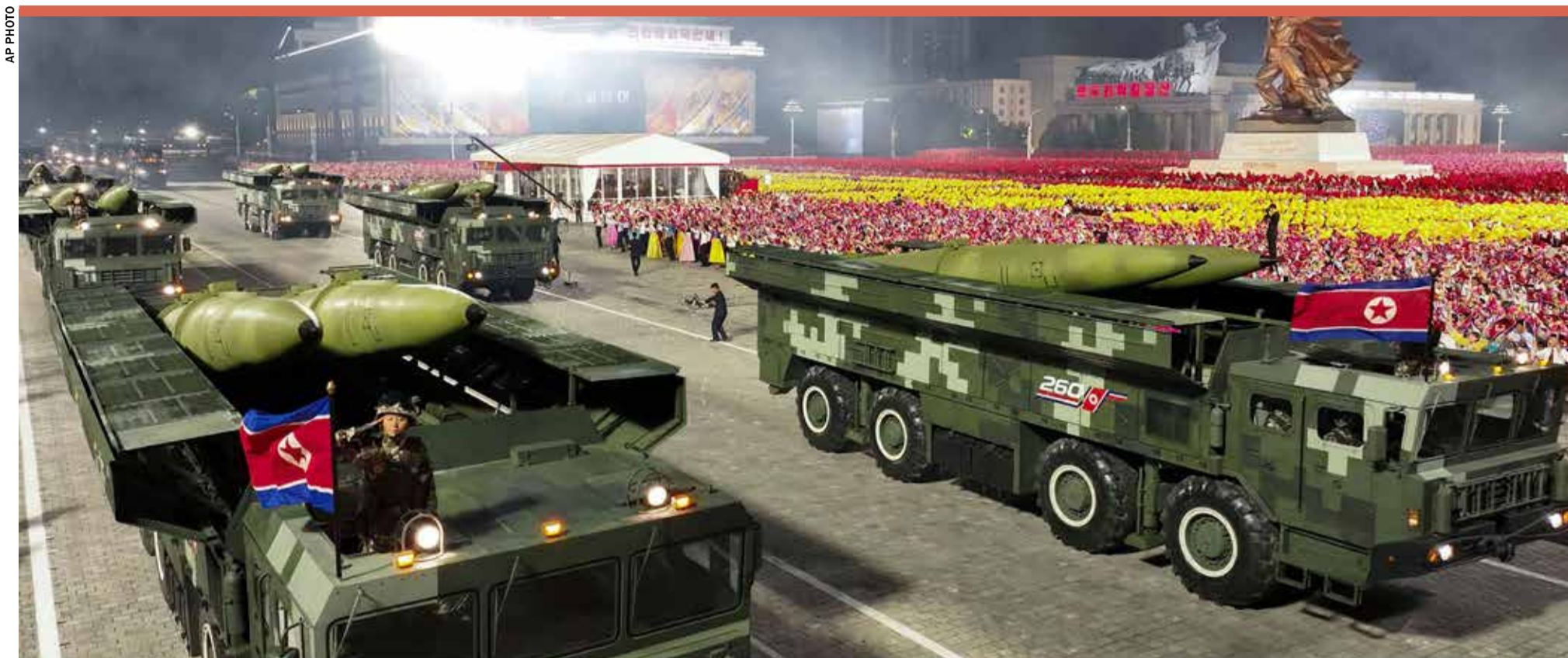
Military parade in Pyongyang to mark the 70th anniversary of the armistice in the 1950-53 Korean War, last year