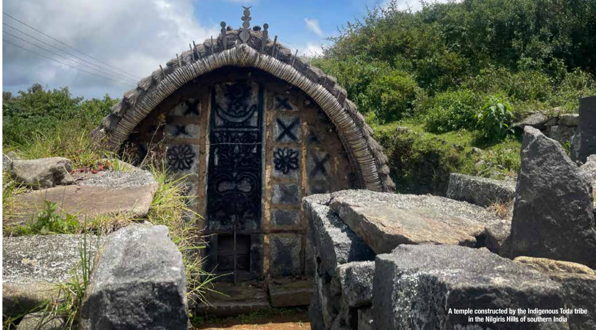
A temple constructed by the Indigenous Toda tribe in the Nilgiris Hills of southern India