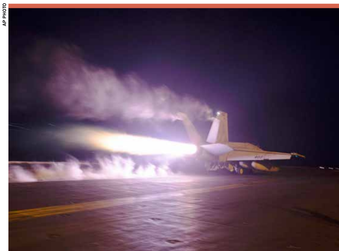
This image shows an aircraft launching from USS Dwight D. Eisenhower during flight operations in the Red Sea Monday night

One senior U.S. military official told reporters the strikes dropped between 25 and 30 munitions and hit multiple targets in each location, adding that the U.S. "observed good impacts and effects" at all sites, including the destruction of more advanced weapons in the underground storage facility. The official said this is