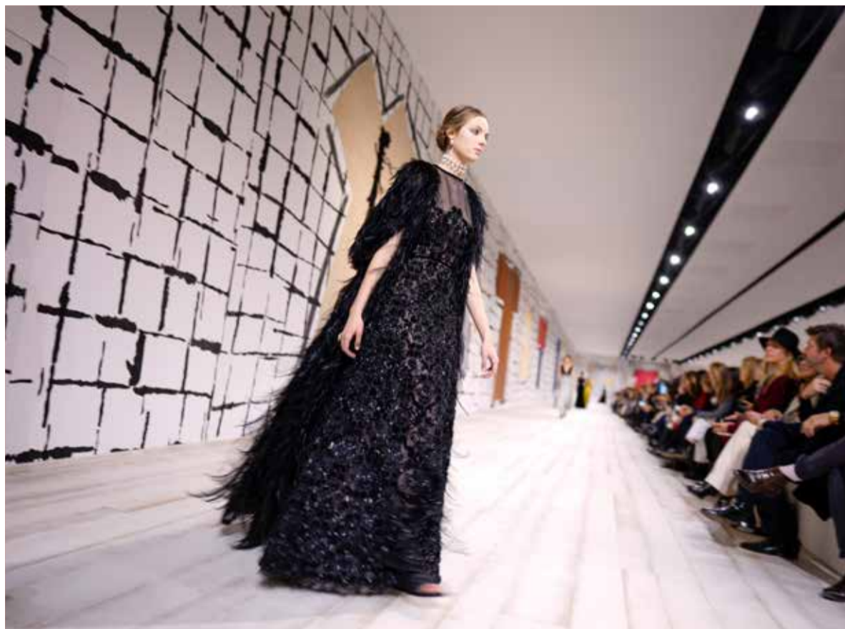
A model wears a creation for Christian Dior