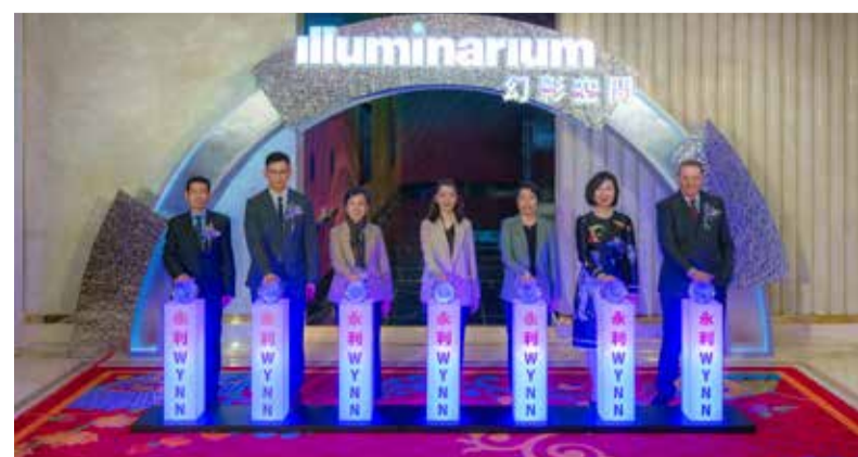
Distinguished guests attend the launch of the new Illuminarium at Wynn

operations. This diversification is part of a broader vision to transform Wynn into a comprehensive resort that caters to a wide array of interests and preferences, aiming to attract not only gamers but also families, educational groups, and cultural enthusiasts.