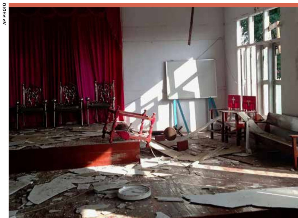
Debris is seen in the St. Peter Baptist Church-Kanan, which was struck by the suspected military's aerial attacks in Kanan village earlier this month

At least 107 religious buildings — including 67 churches and five Buddhist monasteries — have been destroyed by the military