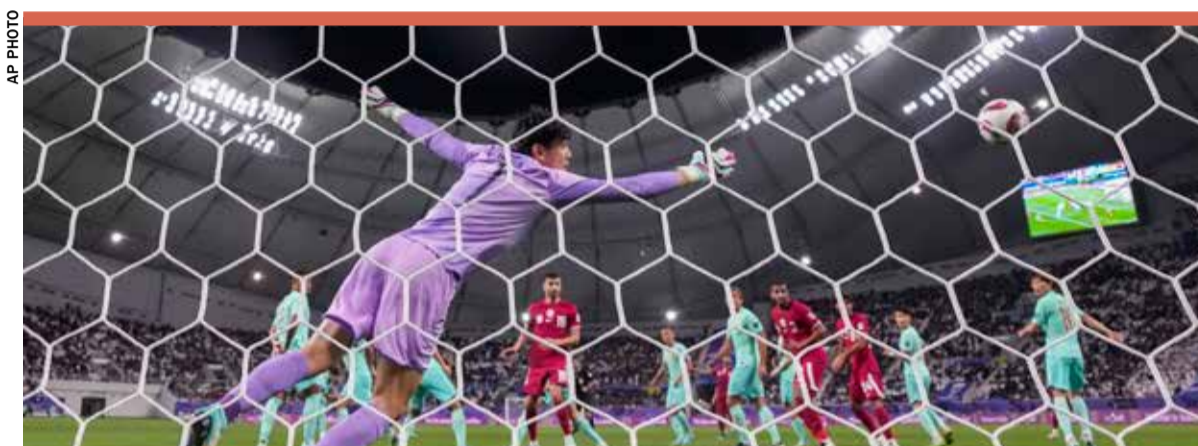
China's goalkeeper Yan Junling fails to block a shot by Qatar's Hasan Al Haydos to score the solitary goal

China finished with just two points and failed to score in any of its three games. It has never won the Asian Cup and must now