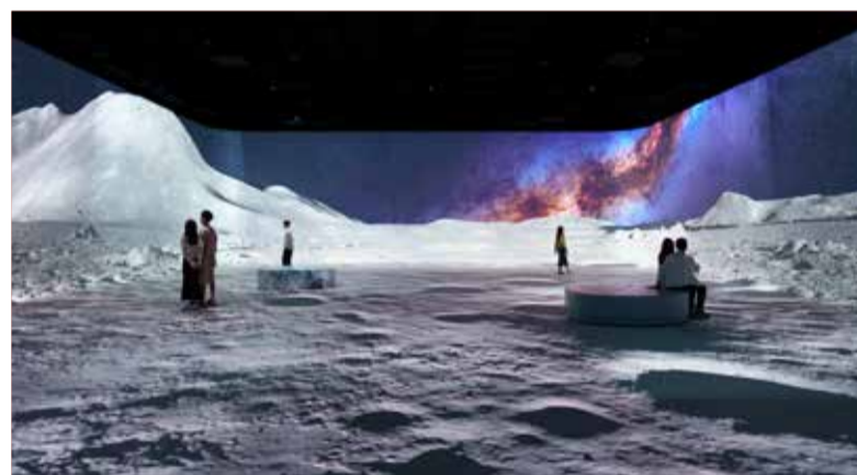
Visitors can explore the universe from 360-degree angles in the Illuminarium