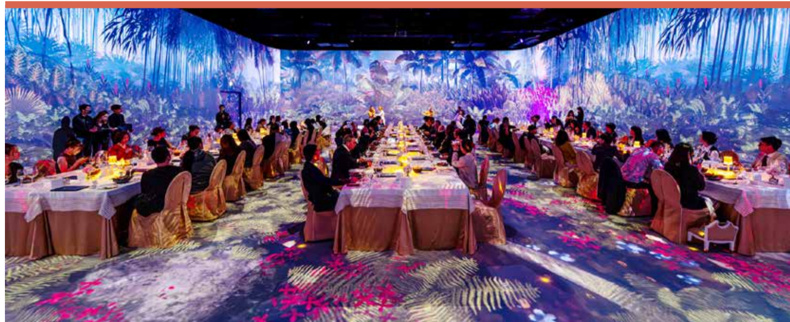
Guests attend the Illuminarium immersive gala dinner at Wynn