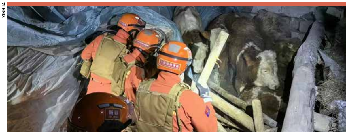
Rescuers search through a quake-affected area in Yamansu Township, Wushi County of Aksu prefecture

Of the six people hurt, only two had serious injuries. Among the more than 120 buildings damaged, 47 houses collapsed, 78 houses were damaged and some greenhouses were reduced to plastic sheets and rubble, the government