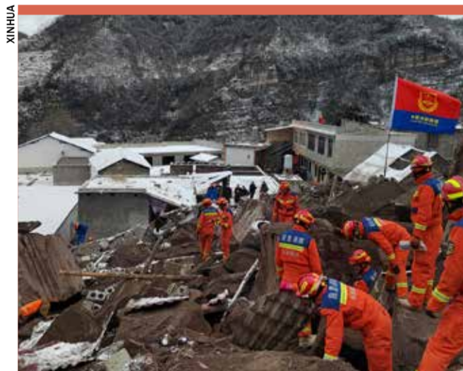
Rescue workers search the site of a landslide in Liangshui village, Tangfang Town in the city of Zhaotong

Landslides, often caused by rain or unsafe construction work, are not uncommon in China. At least 70 people were killed in landslides last year, including more than 50 at an open pit mine