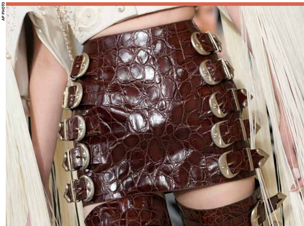
A model wears a creation for Schiaparelli's Haute Couture Spring-Summer 2024 collection

The ambition of the collection was its only weakness, sometimes leading it to skirt the edges of thematic coherence. One example was an elegant, long black crepe wrap dress, which, while stylish, seemed incongruous in the dis-