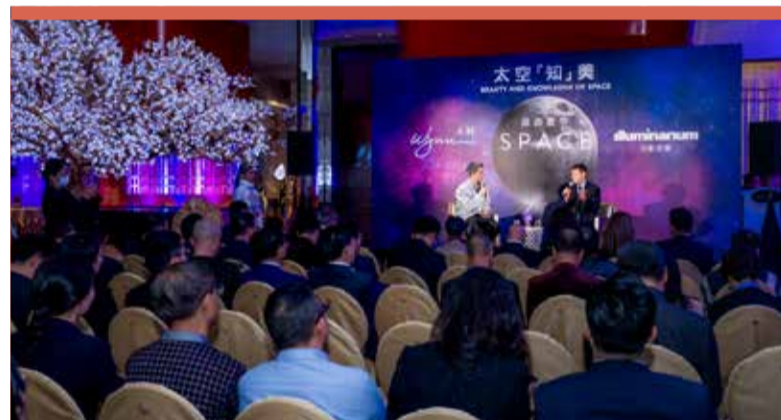
Wynn hosts a "Beauty and Knowledge of Space" sharing session

The addition of Illuminarium is a strategic move by Wynn, emphasizing the resort's investment in cultural and recreational experiences that complement its gaming