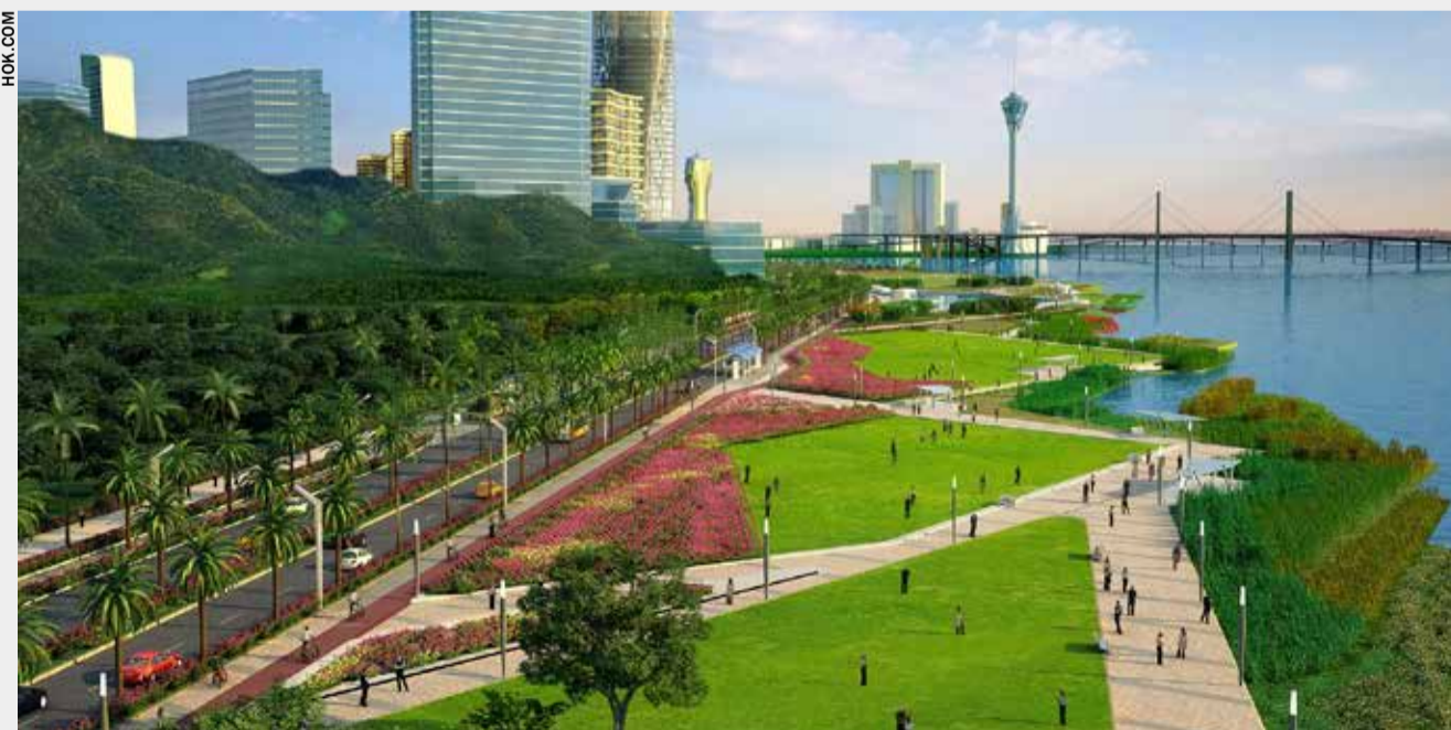
A panoramic view of the Lovers' Road

For nature lovers, Zhuhai does not disappoint. The city's famed Lovers' Road is a picturesque seaside promenade, stretching for miles along the coast and offering stunning views of the South China Sea. It's a perfect spot for leisurely walks or cycling, especially during sunset... Hold that thought: one might wish to defer this pleasure until the chill of winter yields to