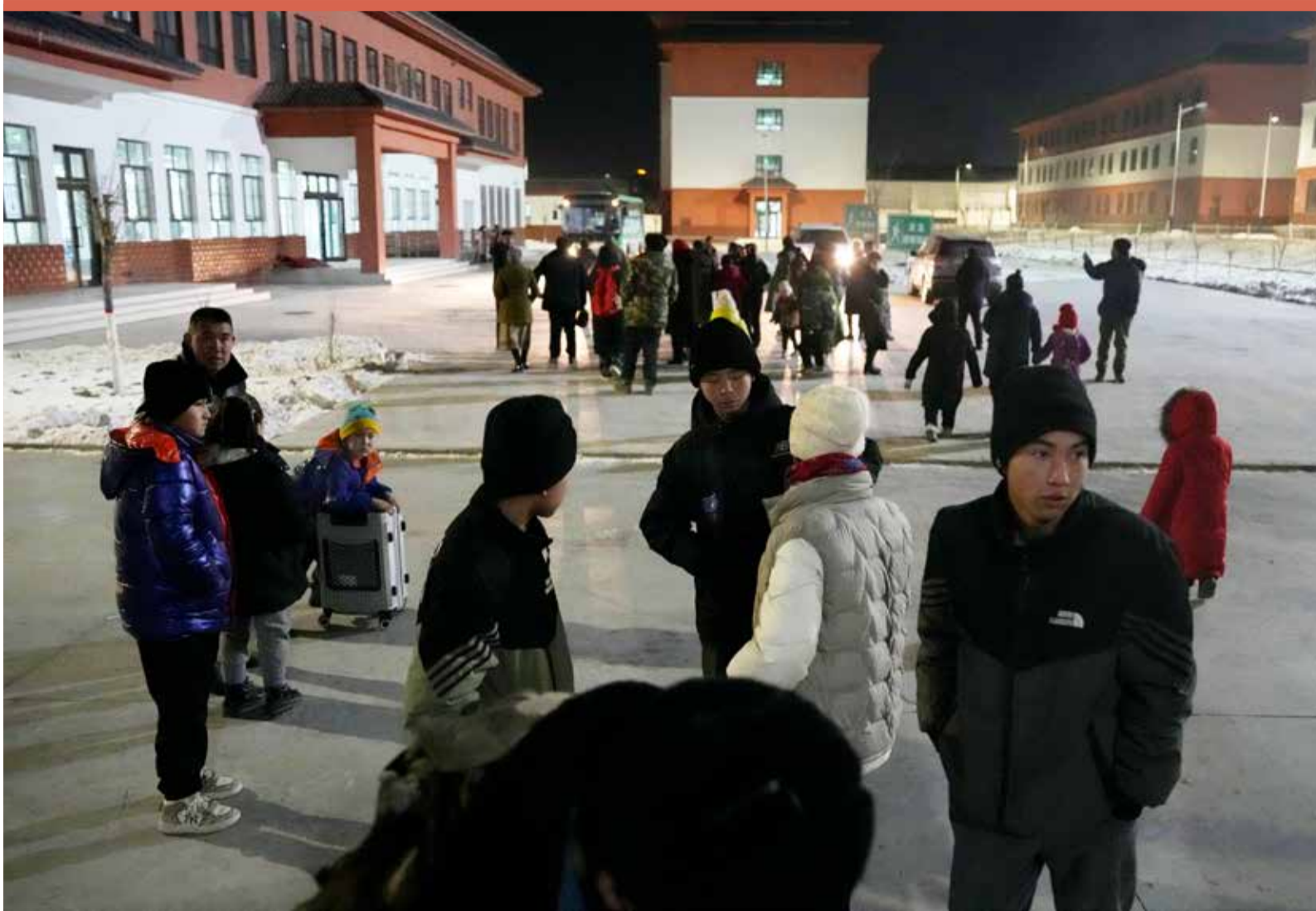
Residents displaced in the aftermath of an earthquake arrive at a school dormitory used as temporary shelter in Wushi county in Xinjiang