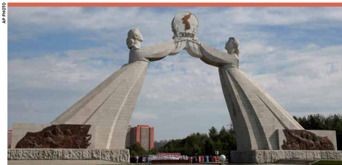
The Arch of Reunification, a monument to symbolize the hope for eventual reunification of the two Koreas, in Pyongyang

Clouds and snow cover made it difficult to ascertain when North Korea tore down the monument, but it appeared to be within the last few days. NKNews, a website focused on North Korea, first re-