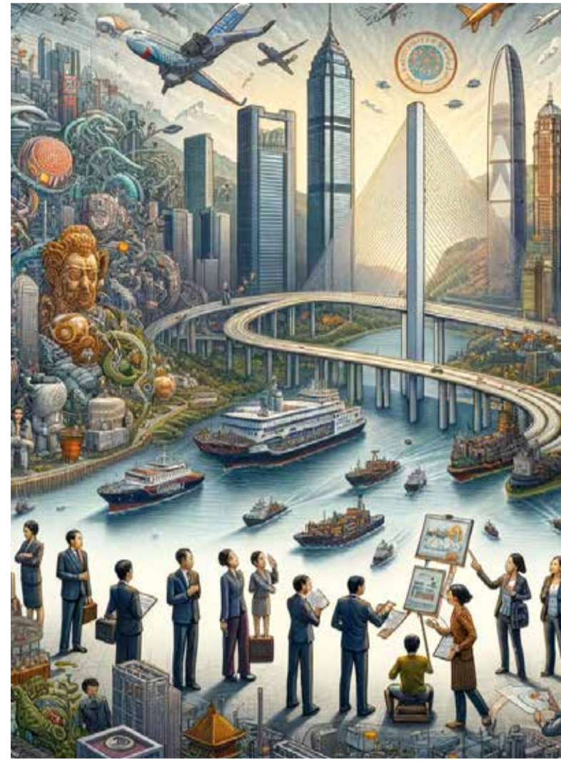
AI-generated artistic rendition that visually captures the blend of architectural elements across various professions, and symbolic references to connectivity

Transferring the three sets of internalised knowledge and ways of being and