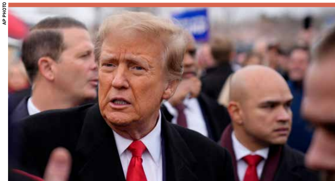
Republican presidential candidate former President Donald Trump arrives a campaign stop in Londonderry, New Hampshire

AP VoteCast is a survey of 1,968 New Hampshire voters who are taking part in the Republican primary and 903 De-