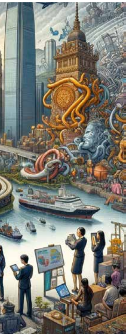
lements, the human aspect of integration and policy changes in GBA

of Guangdong outside the GBA. It will remain to be seen whether and where there may be reluctance, and which push and pull factors will prevail in the transition: the international characteristics of the free-market economies of Hong Kong and Macau or that of more centralised control and big government.