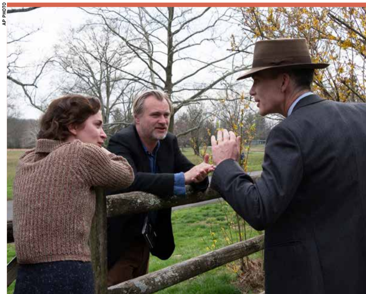
Actress Emily Blunt (left) with writer-director-producer Christopher Nolan (center) and actor Cillian Murphy on the set of "Oppenheimer"