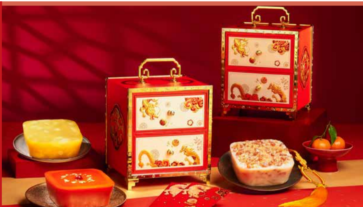
Wynn Chinese New Year Festive Cake Jewelry Gift Boxes

Wynn is pleased to present sets of four Chinese New Year Festive Cakes in elegantly designed gift boxes. The striking red 'jewelry gift box' with gold handles features two majestic dragons and Wynn's iconic floral patterns to symbolize the "soaring of the dragon" and "blossoming flowers for prosperity". Designed to be both elegant and practical, the gift boxes may be used time and again as jewelry cases, in line with Wynn's ongoing commitment to sustainability.