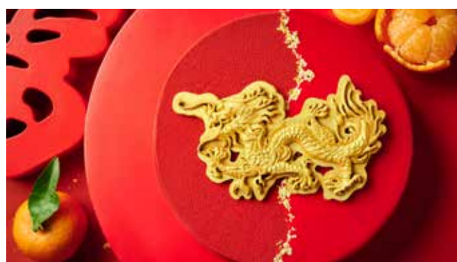
Sweets will present a limited-edition Year of the Dragon – Milk Chocolate and Mandarin Cake