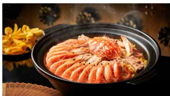
Golden Flower is pleased to present a luxurious Northern hot pot with seafood and lamb for Chinese New Year