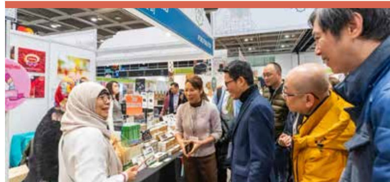
MGTO visits the international showcase of Halal certified food

Additionally, Bona Film Group has constructed the Bona International Cineplex in Macau. To commemorate its debut, the cinema hosted an event called the "Bona Film Group Movie Screening Event." The event offered free screenings of eight well-known Bona films, including acclaimed titles such as "Bursting Point," "The Battle at Lake Changjin," "Operation Mekong," and "Flying Swords of Dragon Gate."