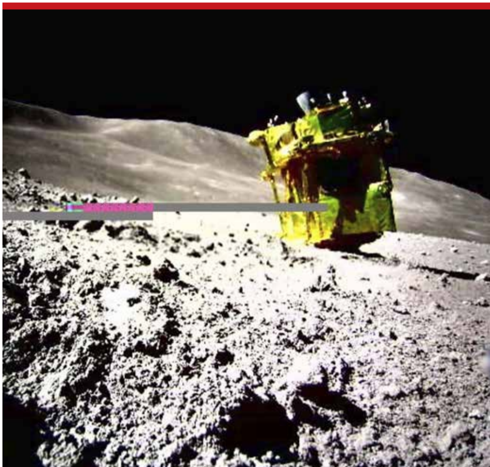
This image provided by the JAXA shows an image taken by a Lunar Excursion Vehicle 2 of a robotic moon rover called Smart Lander for Investigating Moon, or SLIM, on the moon