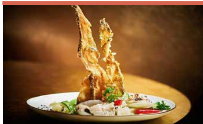
Wing Lei presents an auspicious Sautéed Macau sole fillet and crispy bones with black moss and truffle dish for Chinese New Year

From February 1 to 29, Sweets will also present a limited-edition Year of the Dragon – Milk Chocolate and Mandarin Cake. This festive red cake features a mighty golden dragon in a symbolic nod to a prosperous Year of the Dragon and is filled with a combination of citrus jam and milk chocolate, for a flavor that is full of surprises.