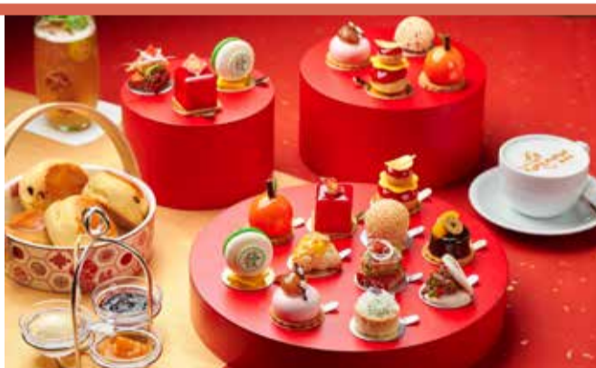
Experience a leisurely Chinese New Year afternoon tea at Café Esplanada