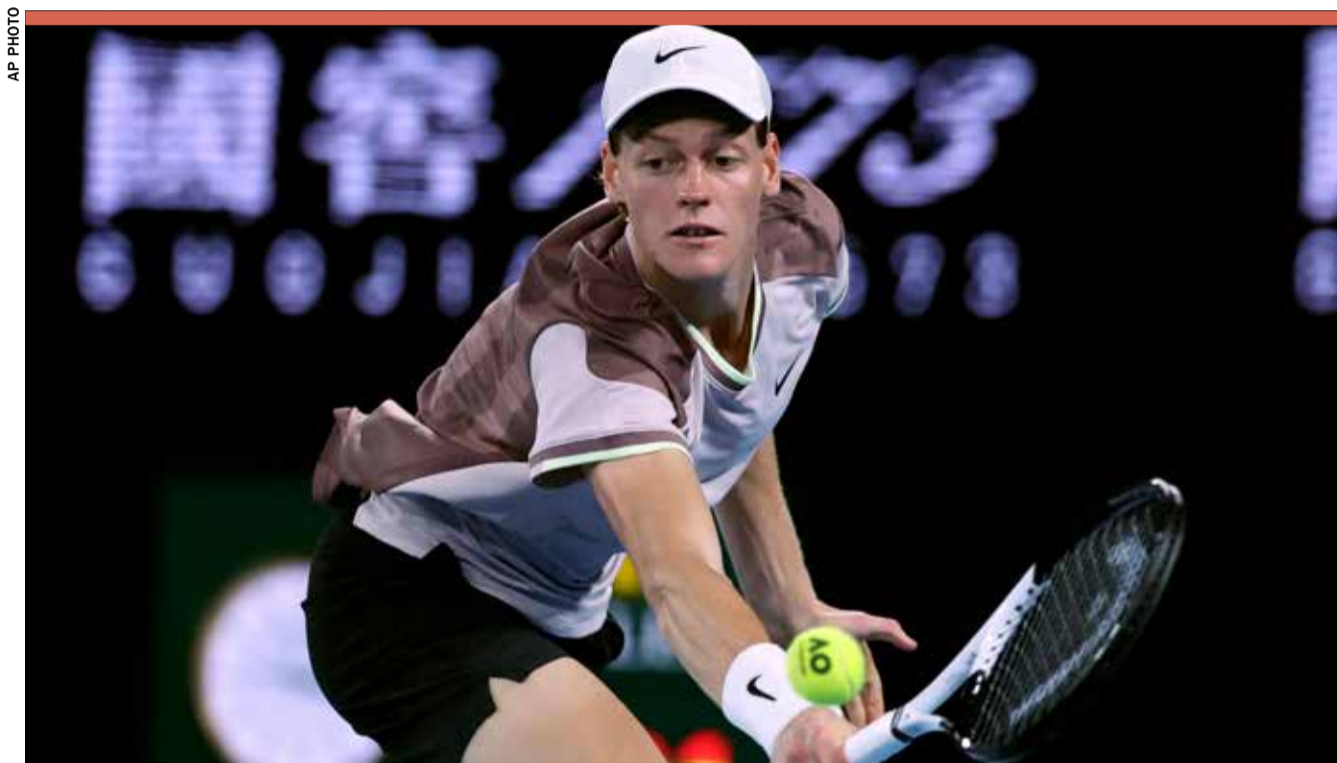
Jannik Sinner of Italy plays a backhand return to Daniil Medvedev of Russia during the men's singles final

a tennis fuse in Italy, where his run to the ATP Finals championship match and leading role in the Davis Cup title win in November captured the country's attention. The night time final in Australia made for pre-lunch viewing in Italy.