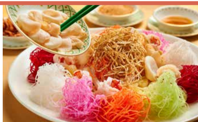
Lakeview Palace invites family and friends to celebrate a prosperous Chinese New Year with 'Yushang' abalone prosperity salad