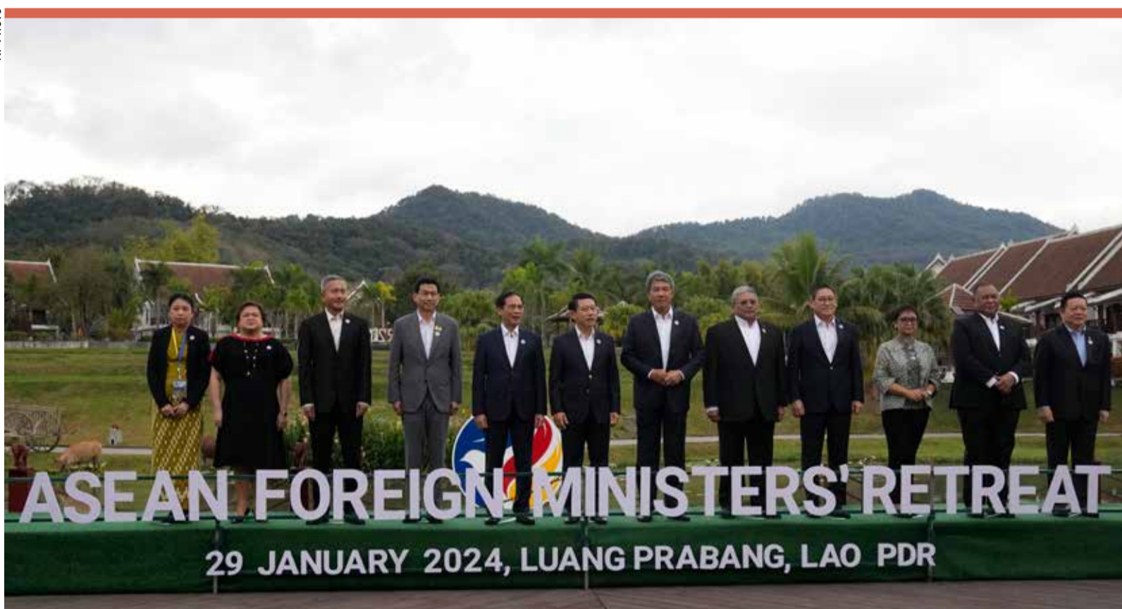
Representatives pose for a group photo during the ASEAN Foreign Ministers retreat meeting in Luang Prabang

the military took control of the country, giving it a perspective different from that of previous chairs.