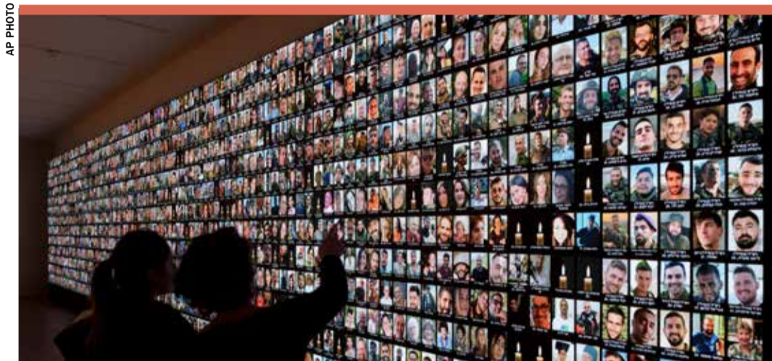
Visitors look at photos of Israeli people who were killed during Hamas militants attack on Oct. 7 and those who died during the Israel-Hamas war in the Gaza Strip

The intelligence meeting included CIA Director Bill Burns, the head of Israel's Mossad intelligence agency, David