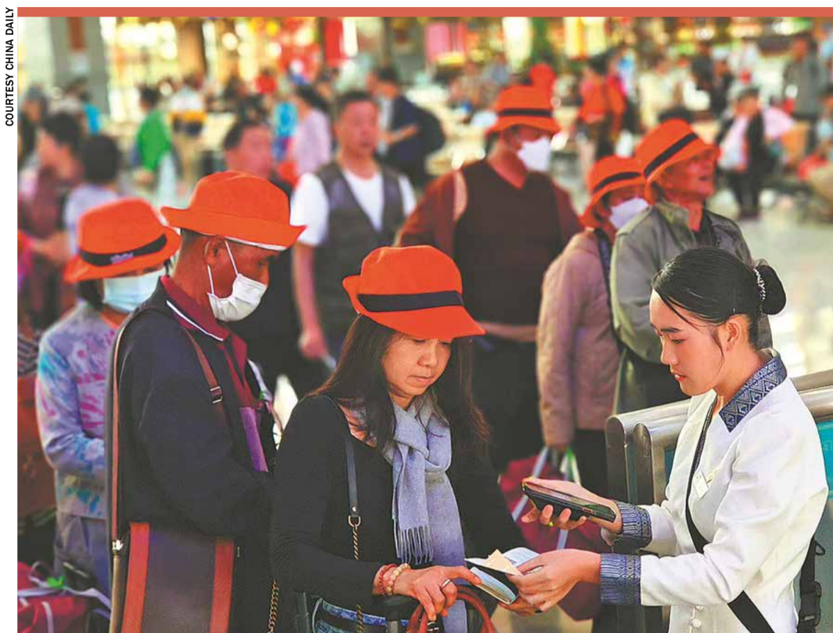
Members of a tour group from Thailand check in to take the train on the China-Laos Railway in Vientiane, Laos, on Friday

"The train is always busy," she said, adding that her Chinese friends asked her to buy train tickets for them during Spring Festival.