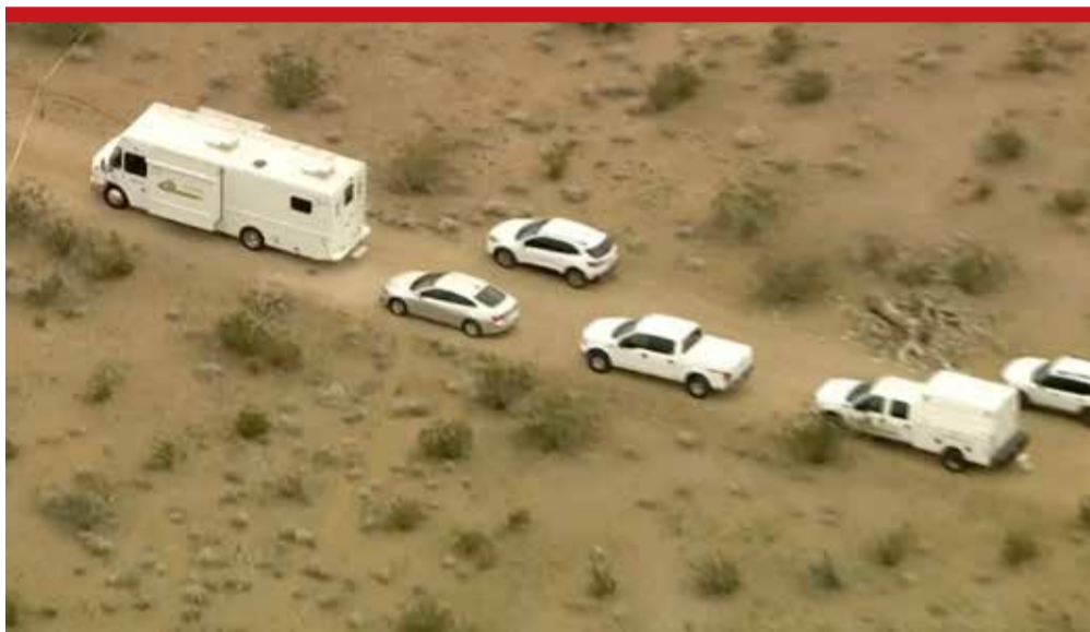
This aerial still image from video shows law enforcement vehicles where several people were found shot to death in El Mirage, California