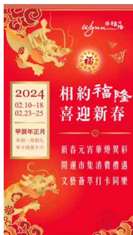
Wynn presents a series of vibrant Chinese New Year festivities at Rua da Felicidade

Macao and Wynn Palace. Wynn will also host special Chinese New Year-themed events in the Rua da Felicidade Pedestrian Zone and participate in the Macao SAR Government's "Parade for Celebration for the Year of the Dragon 2024". In grand tradition, Wynn Macau and Wynn Palace will also showcase colorful Chinese dragon and lion dance performances to convey Chinese New Year blessings to visitors from around the world.