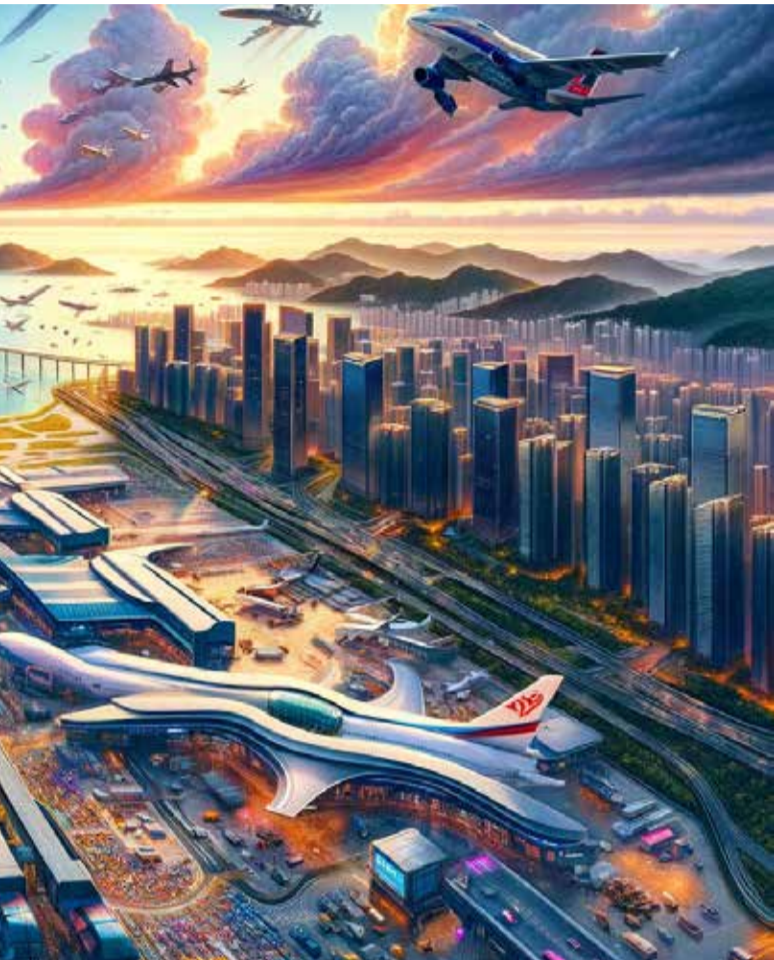
The scene showcases the key airports, busy runways, dynamic passenger flow, and Macao Bridge

in Hong Kong, expected to serve around 500,000 passenger trips annually. This integration is a clear example of the GBA's commitment to enhancing connectivity and