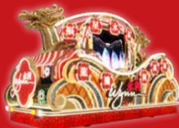
Wynn will participate in the "Parade for Celebration for the Year of the Dragon 2024" hosted by MGTO

beat of drums and weave their way through all major areas of each resort while "plucking the green" – a symbolic way of spreading blessings of peace, prosperity, and good health. Both resorts will be full of elegant Chinese New Year décor, for a truly festive atmosphere.