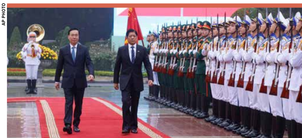
Philippine President Ferdinand Marcos Jr. (right) and Vietnamese President Vo Van Thuong inspect honor guards during a welcome ceremony in Hanoi, yesterday

Several countries, including the Philippines and Vietnam, are locked in maritime disputes with China over its claims of sovereignty over virtually the entire South China Sea, one of the world's most crucial waterways for shipping, and high-seas faceoffs between Chinese and Philippine ships have intensified over the past year in the contested waters, fueling fears of a