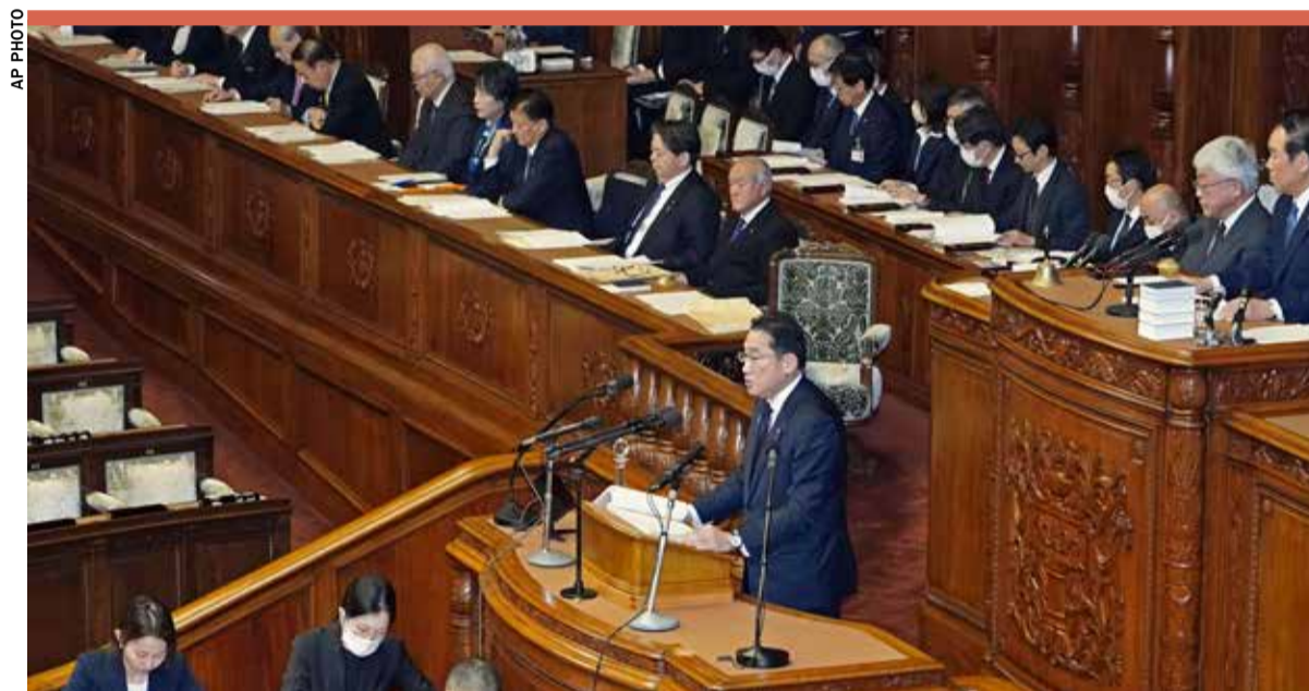
Japan's Prime Minister Fumio Kishida, on platform, delivers his policy speech at parliament in Tokyo, yesterday

gain public trust, citing challenges including a deadly earthquake on New Year's Day and the economy.