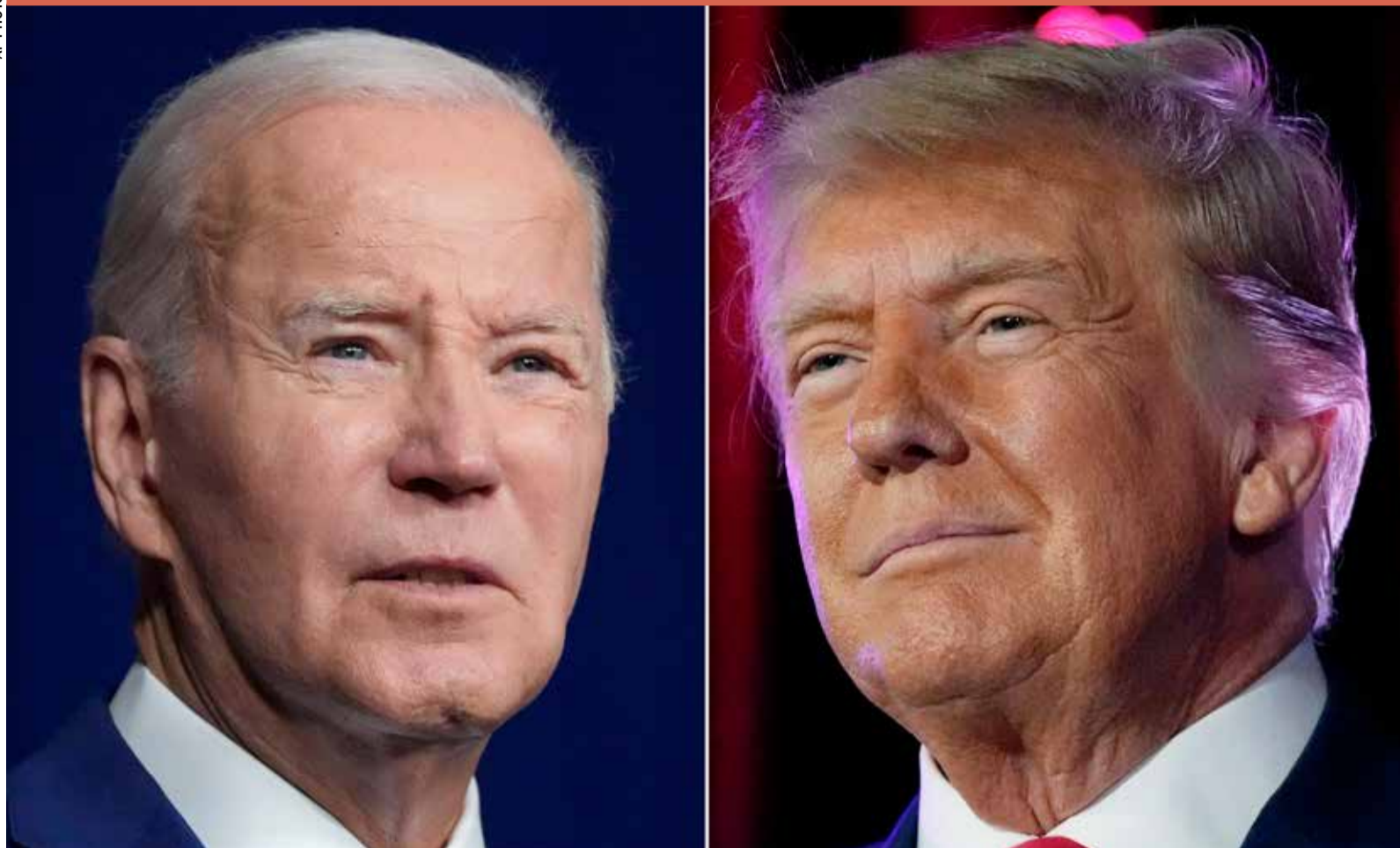
Biden or Trump: China ponders who is 'the lesser of two evils'