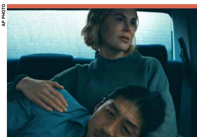
This image released by Prime Video shows Brian Tee, foreground, and Nicole Kidman in a scene from "The Expats"

The city has hardened its controls over political