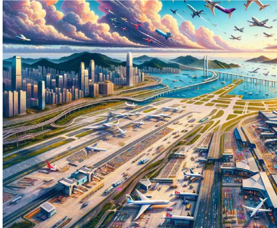
An artistic rendering of the GBA as a bustling aviation hub, capturing its ambition to establish a world-class airport cluster. The connectivity symbolized by the Hong Kong-Zhuhai-

These airports, along with Macau International Airport and Zhuhai Jinwan Inter-