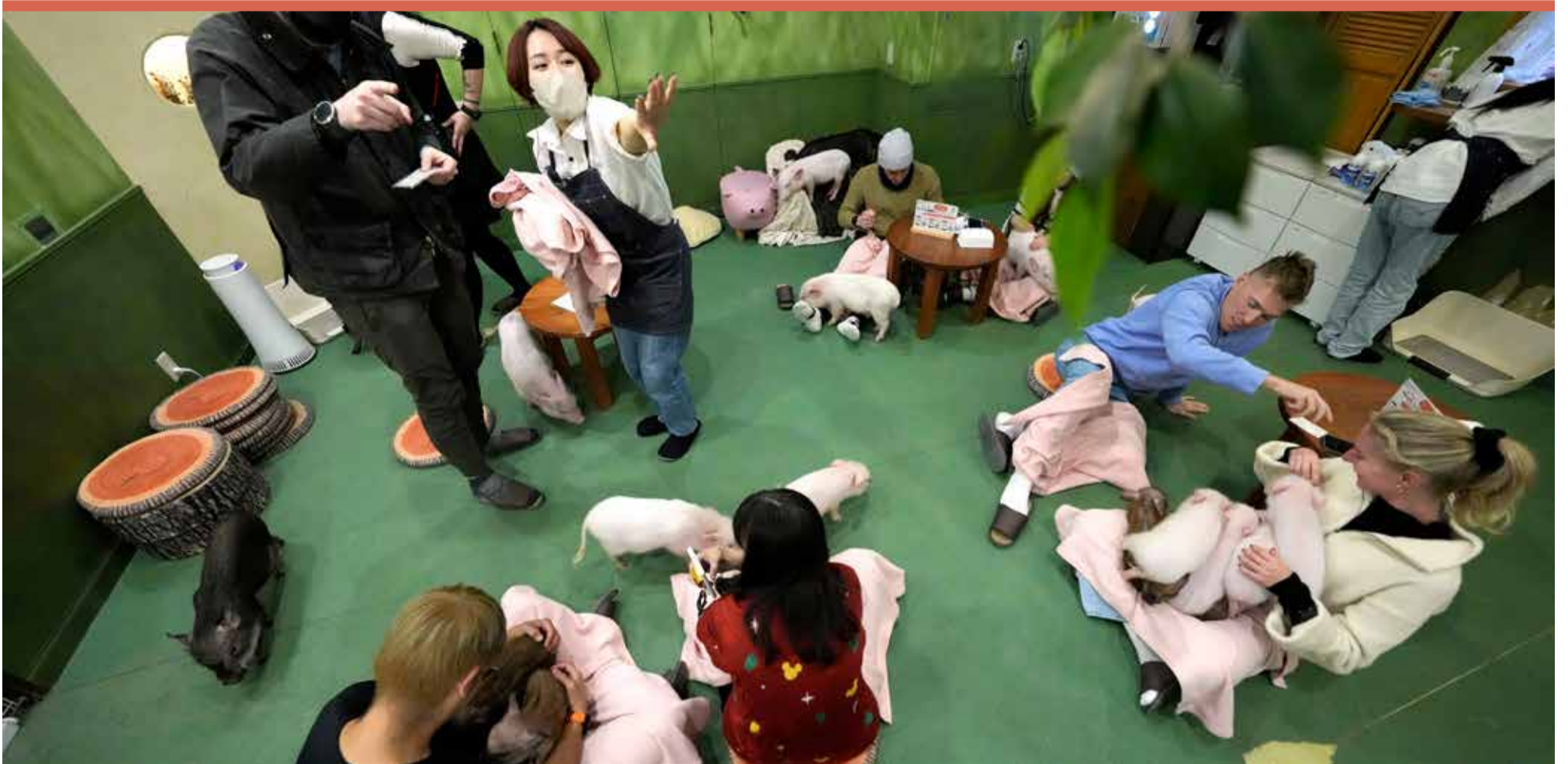
Customers play with micro pigs at a mipig cafe in Tokyo