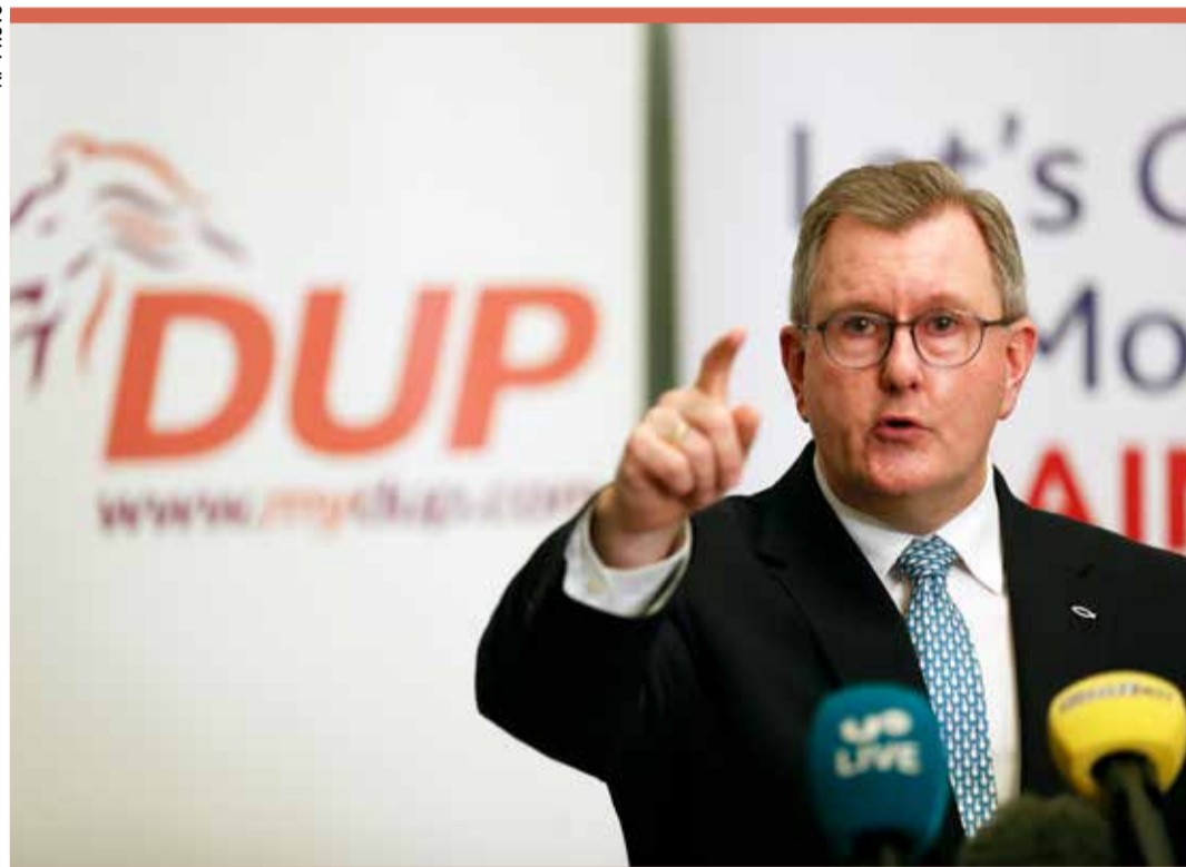
Democratic Unionist Party leader Jeffrey Donaldson

The walkout left Northern Ireland's 1.9 million people without a functioning administration to make key decisions as the cost of living soared and backlogs strained the creaking public health system. Amid mounting pu-