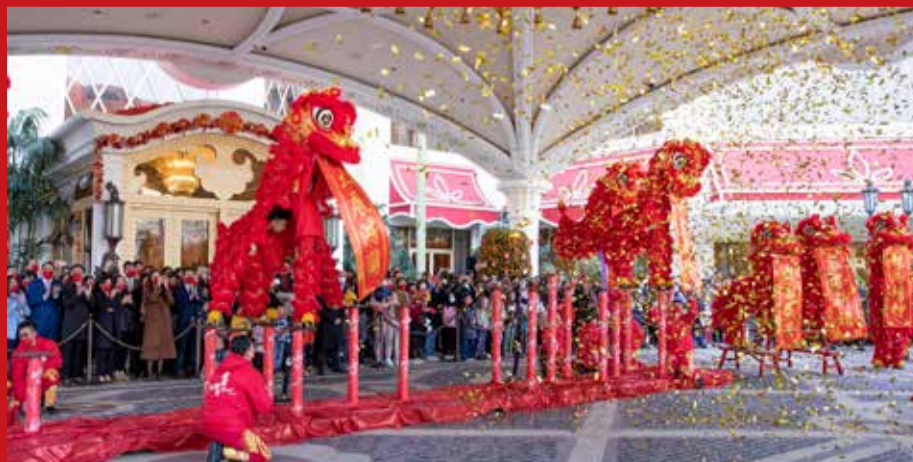
Wynn celebrates Chinese New Year with dragon and lion dance performances and the lighting of firecrackers