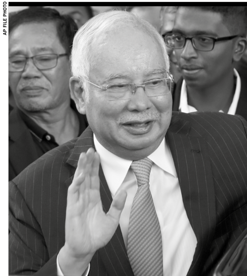
Former Malaysian Prime Minister Najib Razak

The board said it considered Najib's application for a royal par-