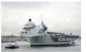
NATO British aircraft carrier that had been set to lead the largest NATO exercises since the Cold War did not set sail yesterday after a problem with its propeller was discovered during final checks, the Royal Navy said. The HMS Queen Elizabeth will not join the exercises off Norway's Arctic coast and will be replaced by the HMS Prince of Wales. The change of plans is almost a reverse scenario of what happened in August 2022 when the Prince of Wales broke down with a propeller problem on its way to carry out training exercises with the United States and Canada off North America.