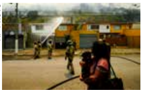
Chile Intense forest fires burning around a densely populated area of central Chile have caused at least 46 deaths, Chile's president said, and officials said at least 1,100 homes had been destroyed. In a nationally televised address, President Gabriel Boric warned that the death toll could worsen as four large fires burn in the region of Valparaiso, where firefighters have struggled to reach the most threatened neighborhoods.