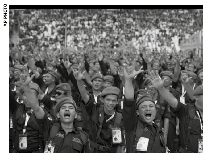
Supporters of Indonesian Democratic Party of Struggle (PDIP) shout slogans during a campaign rally at Gelora Bung Karno Main Stadium in Jakarta, Indonesia, Saturday

Activists, students and university lecturers in Indonesia in recent days have expressed concern over democratic standards in Indonesia, citing unethical, corrupt and nepotistic practices and worsening quality of life in the country. MDT/AP