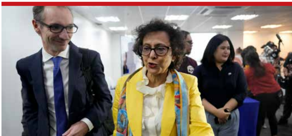
United Nations Special Rapporteur on Freedom of Opinion and Expression Irene Khan, center, gestures after talking to reporters during a press conference in Mandaluyong, Philippines, Friday, Feb. 2.