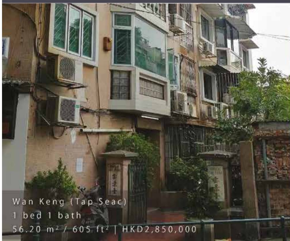
Wan Keng (Tap Seac) 1 bed 1 bath 56.20 m 2 / 605 ft 2 | HKD2,850,000