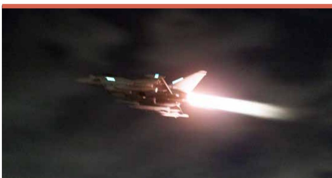
A RAF Typhoon aircraft takes off to conduct further strikes against Houthi military targets in Yemen, from RAF Akrotiri, Cyprus, Saturday