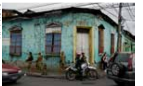
El Salvador People headed out to vote yesterday in a presidential and legislative elections that's largely about the tradeoff between security and democracy. With soaring approval ratings and virtually no competition, Nayib Bukele is almost certainly headed for a second term as president. El Salvador's constitution prohibits reelection. Nonetheless, about eight out of 10 of voters support Bukele, according to a January poll from the University of Central America. That's despite Bukele taking steps throughout his first term that lawyers and critics say chip away at the country's system of checks and balances.