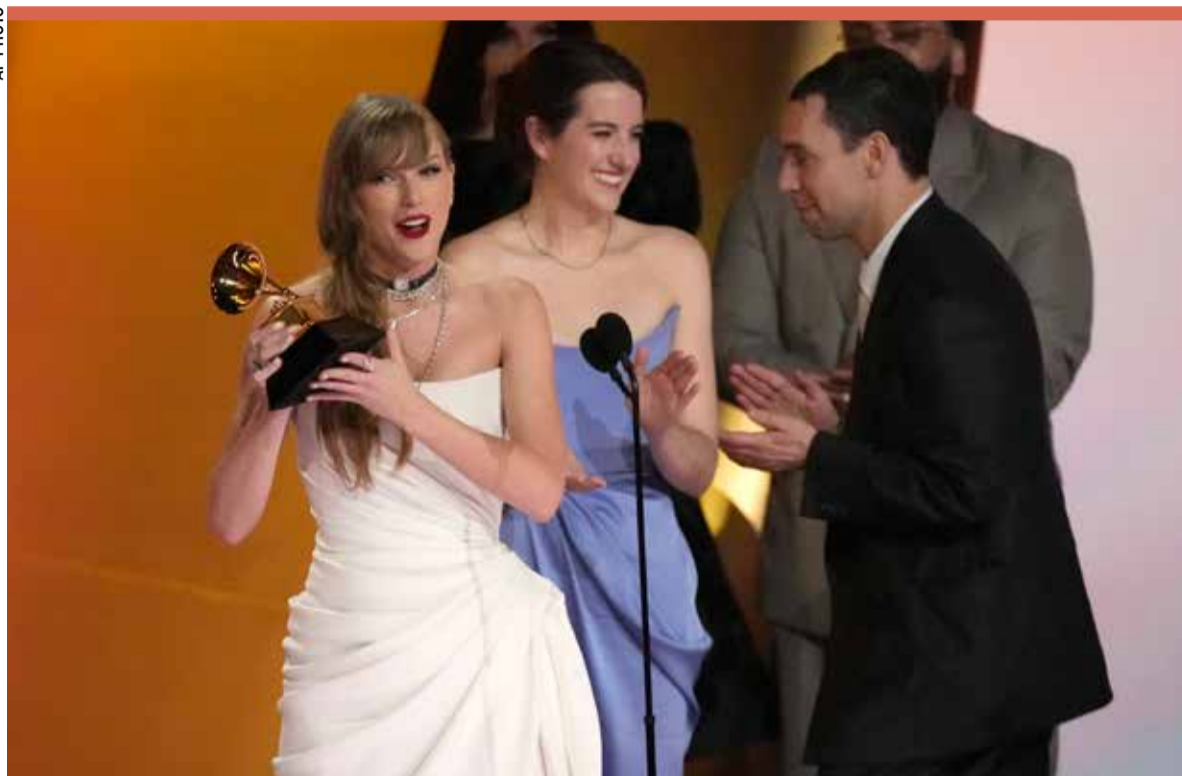
Taylor Swift accepts the award for album of the year for "Midnights" during the 66th annual Grammy Awards

with personality. "I don't think I've forgotten anyone," she said, after a requisite list of thank-yous, "but I may have forgotten underwear."