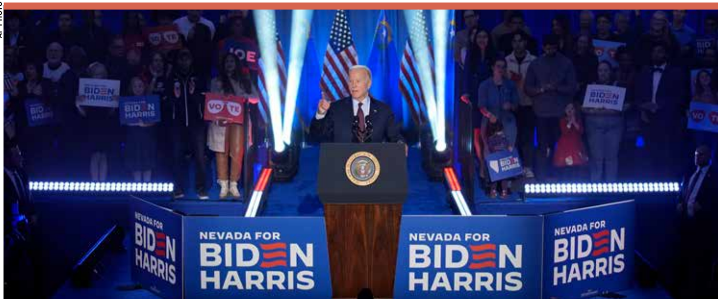
U.S. President Joe Biden speaks at a campaign event Sunday in North Las Vegas