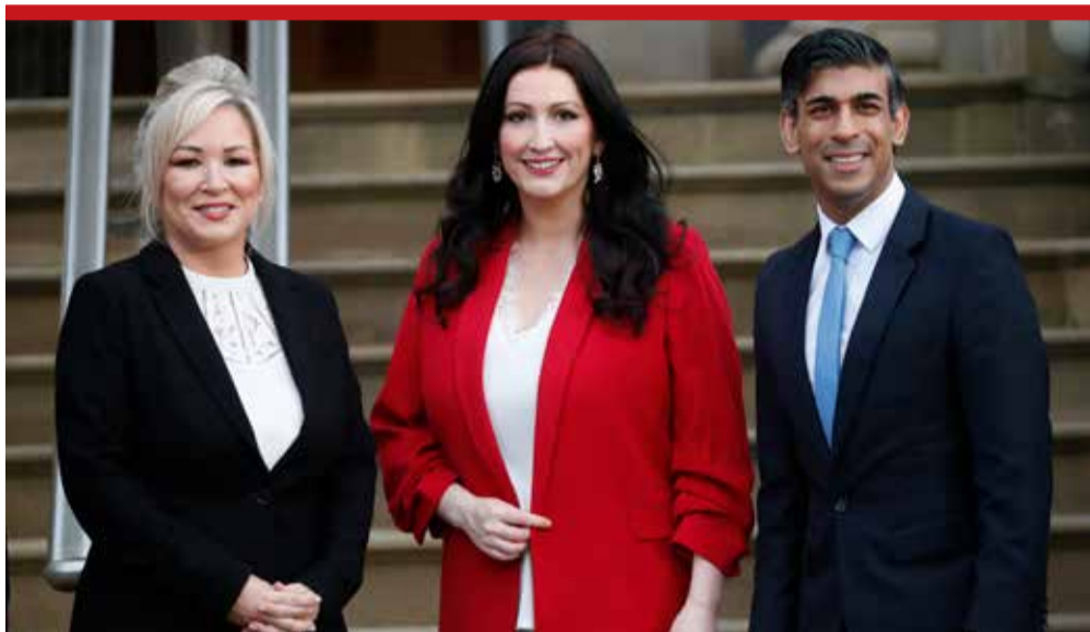
Britain’s Prime Minister Rishi Sunak (right) with Northern Ireland’s First Minister Michelle O’Neill (left) and Deputy First Minister Emma Little-Pengelly as he arrives Stormont Castle in Belfast, yesterday