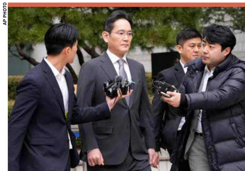
Samsung Electronics Chairman Lee Jae-yong, second from left, leaves the Seoul Central District Court in Seoul, yesterday

The ruling was criticized by activists, progressive politicians