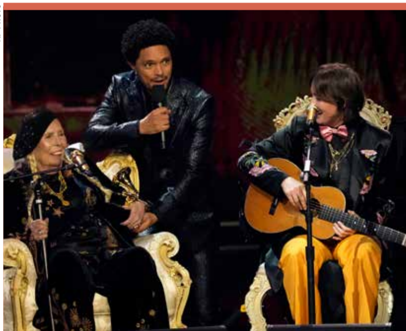
From left: Joni Mitchell, host Trevor Noah, and Brandi Carlile