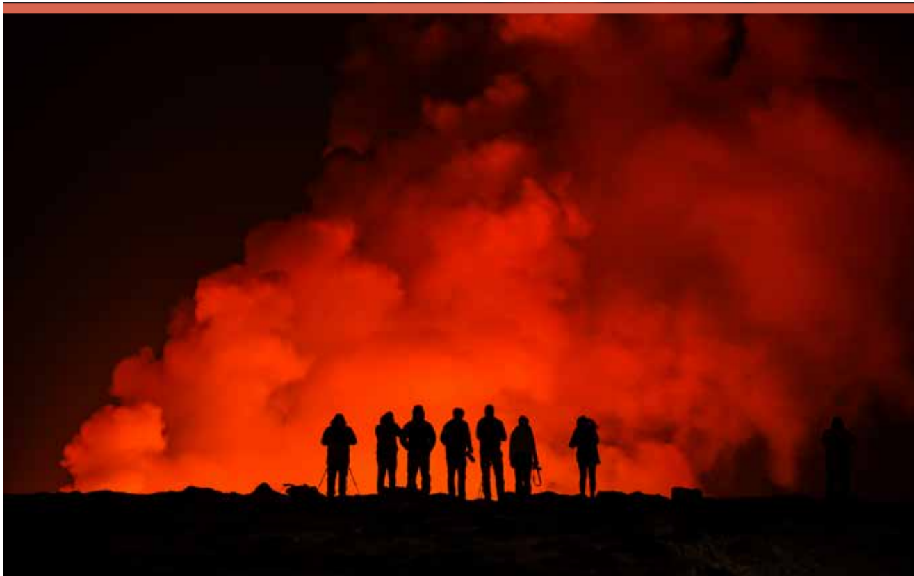
People look at the volcano erupting and spilling lava, north of Grindavik, yesterday