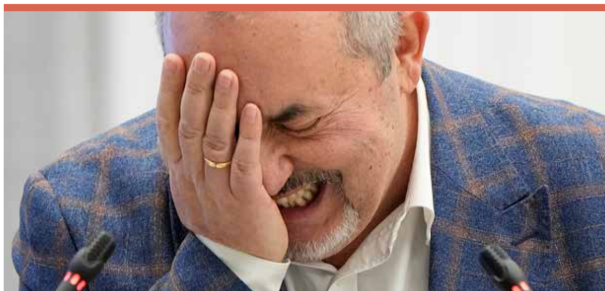
Boris Nadezhdin, a liberal Russian politician

lined up across the country last month to sign papers in support of his candidacy, an unusual show of opposition sympathies in the country's rigidly controlled political landscape.