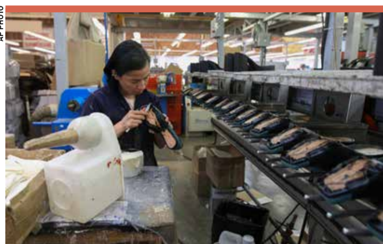
A woman works in a shoe maquiladora or factory in Leon, Mexico

Economic relations between the United States and China have severely deteriorated in recent years as Beijing has fought aggres-