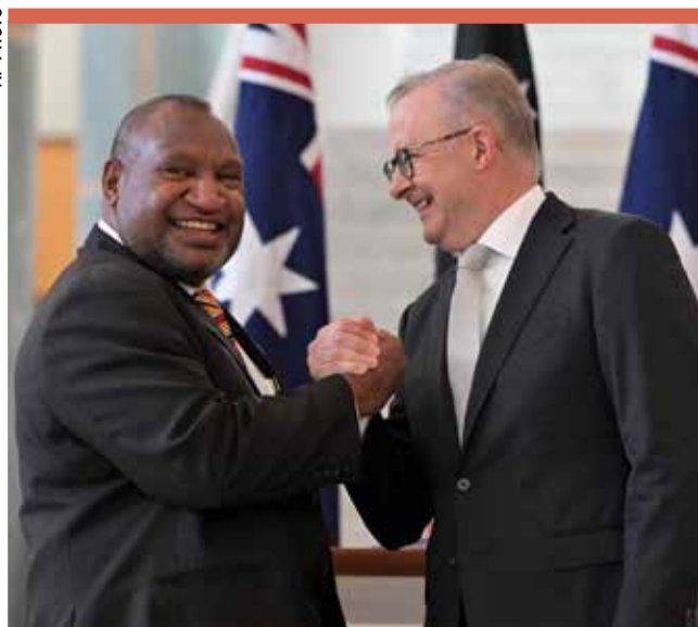
Australia's Prime Minister Anthony Albanese (right) greets Papua New Guinea's Prime Minister James Marape at Parliament House in Canberra, yesterday

P APUA New Guinea Prime Minister James Marape yesterday became the first Pacific leader to address Australia's parliament, vowing “nothing will come in between our two countries.”