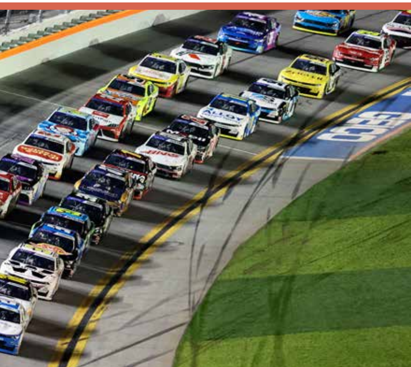
NASCAR Xfinity Series auto race at Daytona International Speedway, Monday

“The rating agencies have upped NASCAR to a better rating based on the health of NASCAR,” Polk said. “That debt that NASCAR had is now down to like $400 million. They paid off $1 billion of debt in less than five years.”