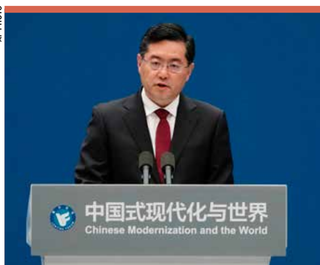
Former FM Qin Gang

C HINA'S former foreign minister, Qin Gang, who has been missing from public view since last June, has resigned from the national legislature, state media reported yesterday.