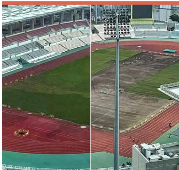
Before and after the concert

He explained that the company was notified to fix the damage to the facility and they did so without further government involvement.