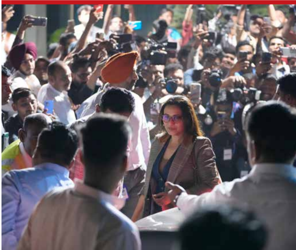
Bollywood actor Rani Mukherjee, center, arrives at airport to attend the pre-wedding celebrations of Anant Ambani and Radhika Merchant in Jamnagar, India, last week