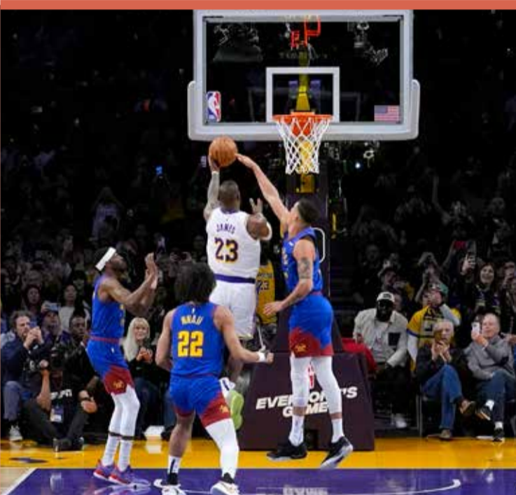
Los Angeles Lakers forward LeBron James (23) scores as Denver Nuggets forward Michael Porter Jr. (1), defends, during the first half of an NBA basketball game, Saturday