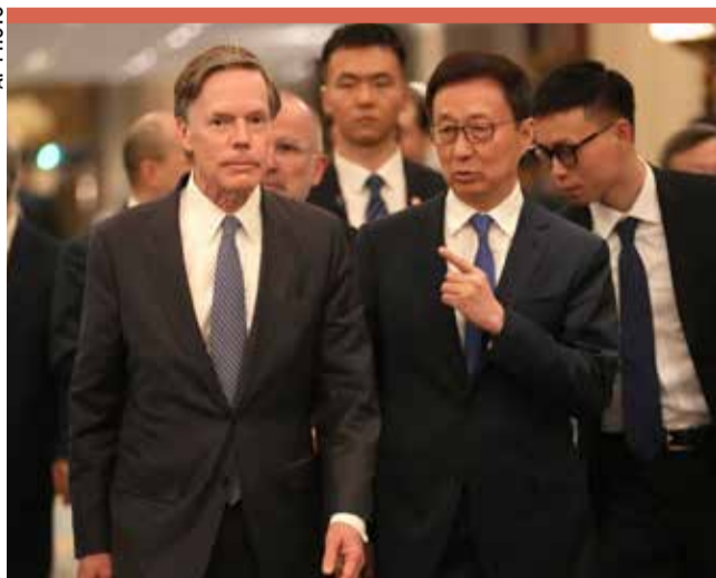
Chinese Vice President Han Zheng, right, chats with US ambassador to China Nicholas Burns

"China's development achievements have been made through opening up," he said at an American Chamber of Commerce in China banquet. "We will unwaveringly adhere to a