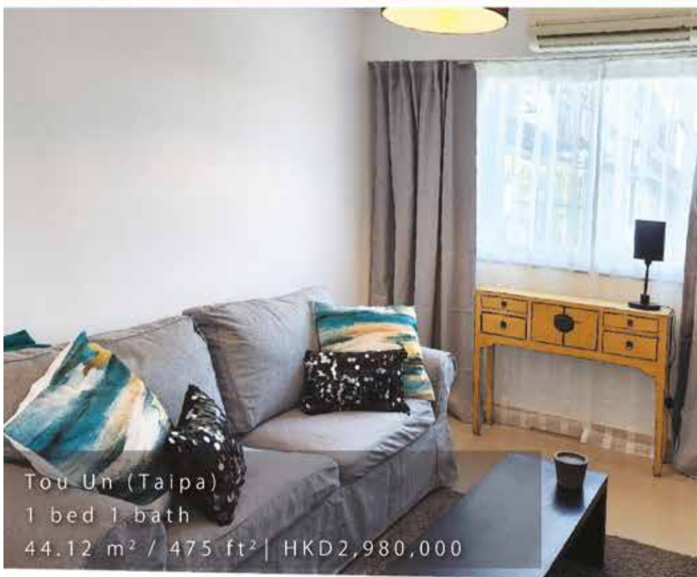
Tou Un (Taipa) 1 bed 1 bath 44.12 m 2 / 475 ft 2 | HKD2,980,000