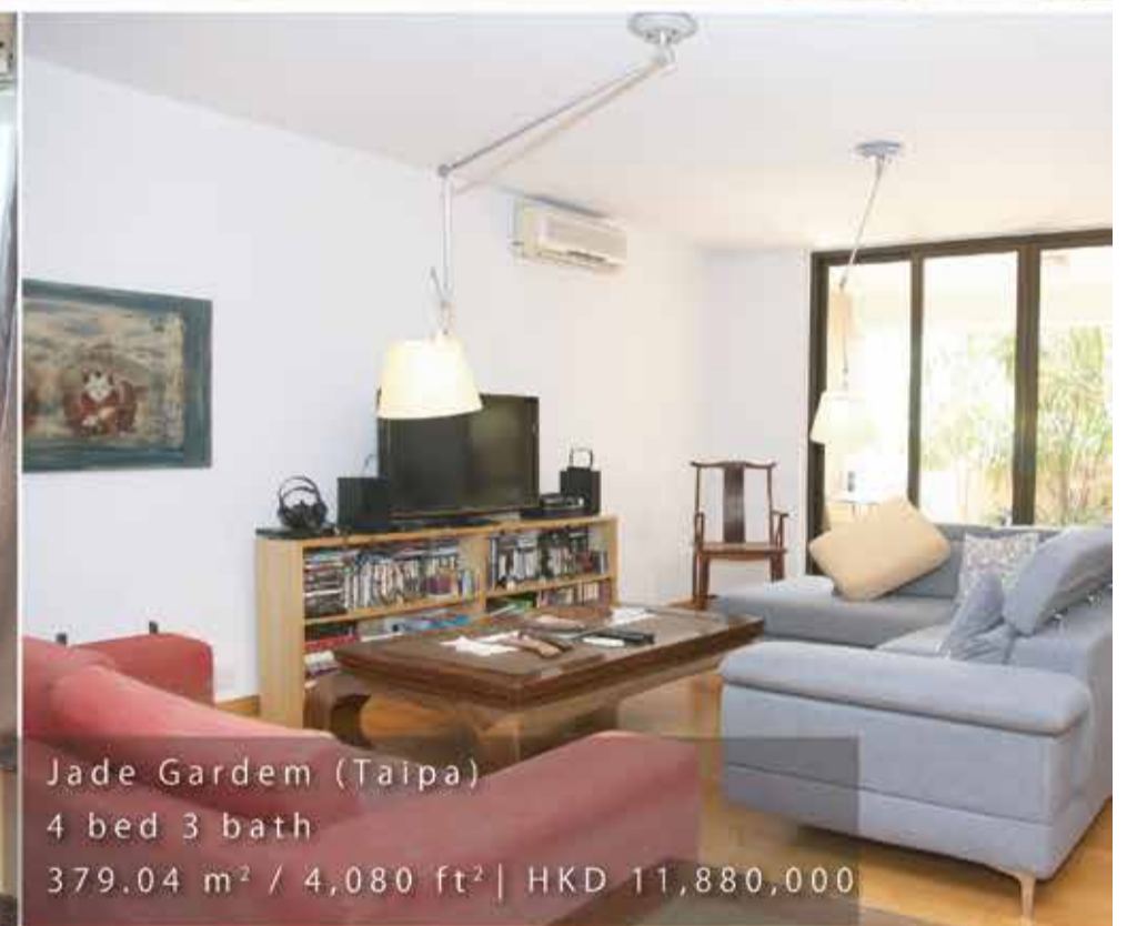
Jade Gardem (Taipa) 4 bed 3 bath 379.04 m 2 / 4,080 ft 2 | HKD 11,880,000