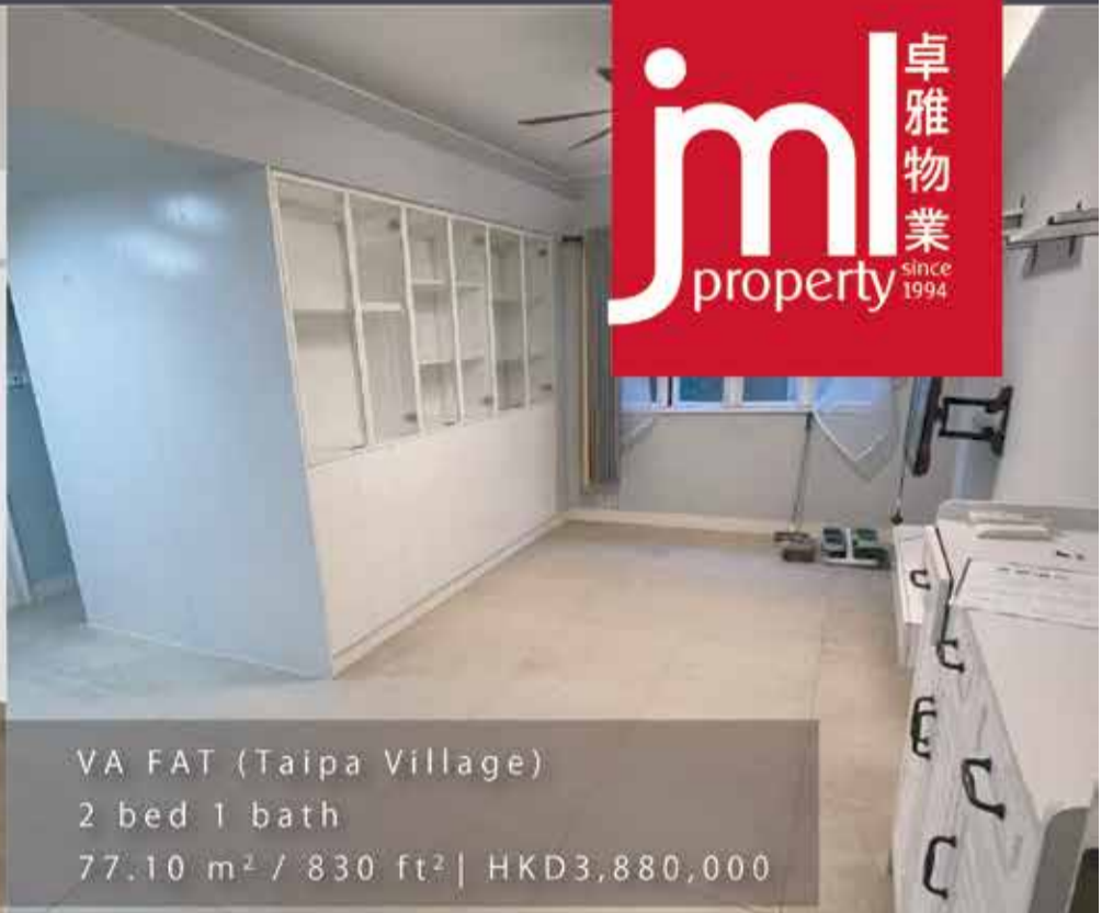
VA FAT (Taipa Village) 2 bed 1 bath 77.10 m 2 / 830 ft 2 | HKD3,880,000