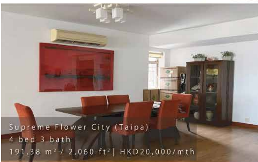
Supreme Flower City (Taipa) 4 bed 3 bath 191.38 m 2 / 2,060 ft 2 | HKD20,000/mth