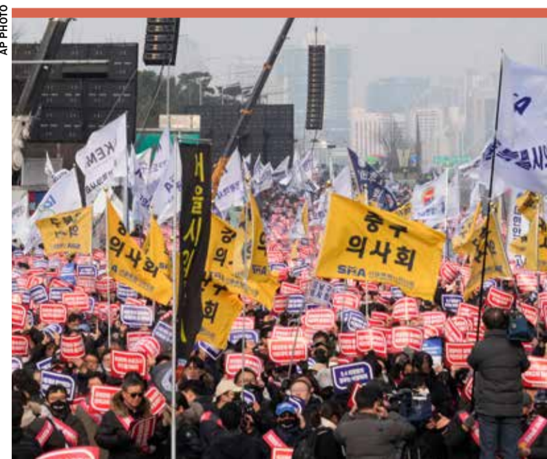
Doctors stage a rally against the government's medical policy in Seoul, South Korea, yesterday