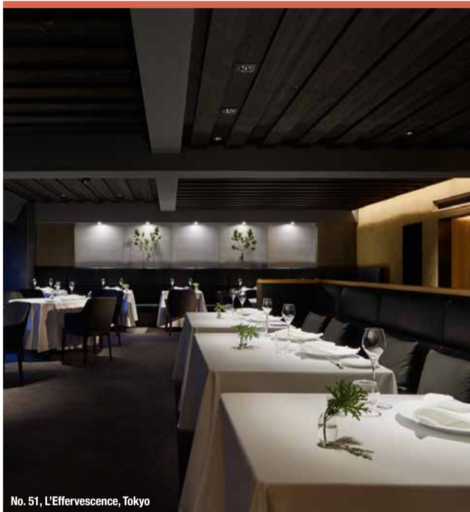
No. 51, L'Effervescence, Tokyo