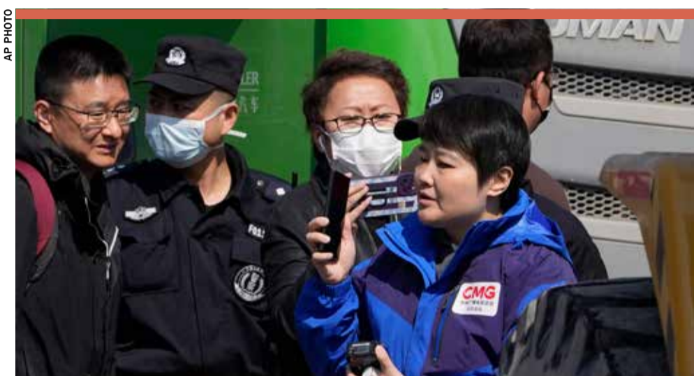
Chinese security personnel attempt to push Chinese journalists from the scene of an explosion in Sanhe city in northern China's Hebei province

A statement on the city's official website expressed "deep regret" over the treatment of the CCTV reporters and other media workers. It said