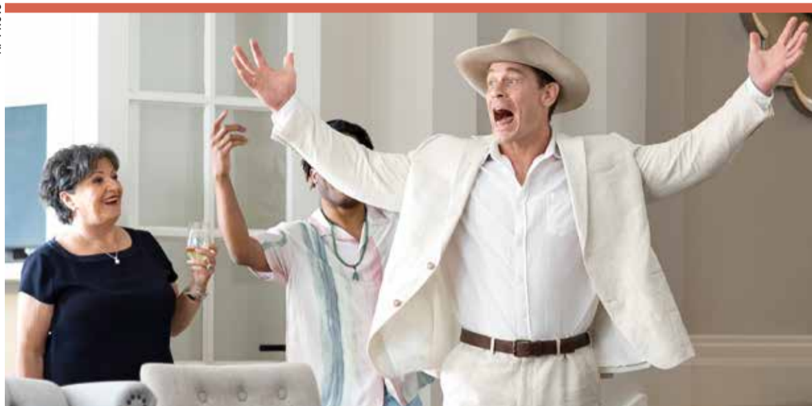
John Cena (right) in a scene from "Ricky Stanicky" (Amazon)

behind a jacket with a fake name inscribed in it: Ricky Stanicky. He becomes their imaginary fourth friend and forever fall guy even into adulthood (in which they're played by Zac Efron, Andrew Santino and Jermaine Fowler). But their house of alibis is in danger of crumbling when suspicious partners and one nagging mother-