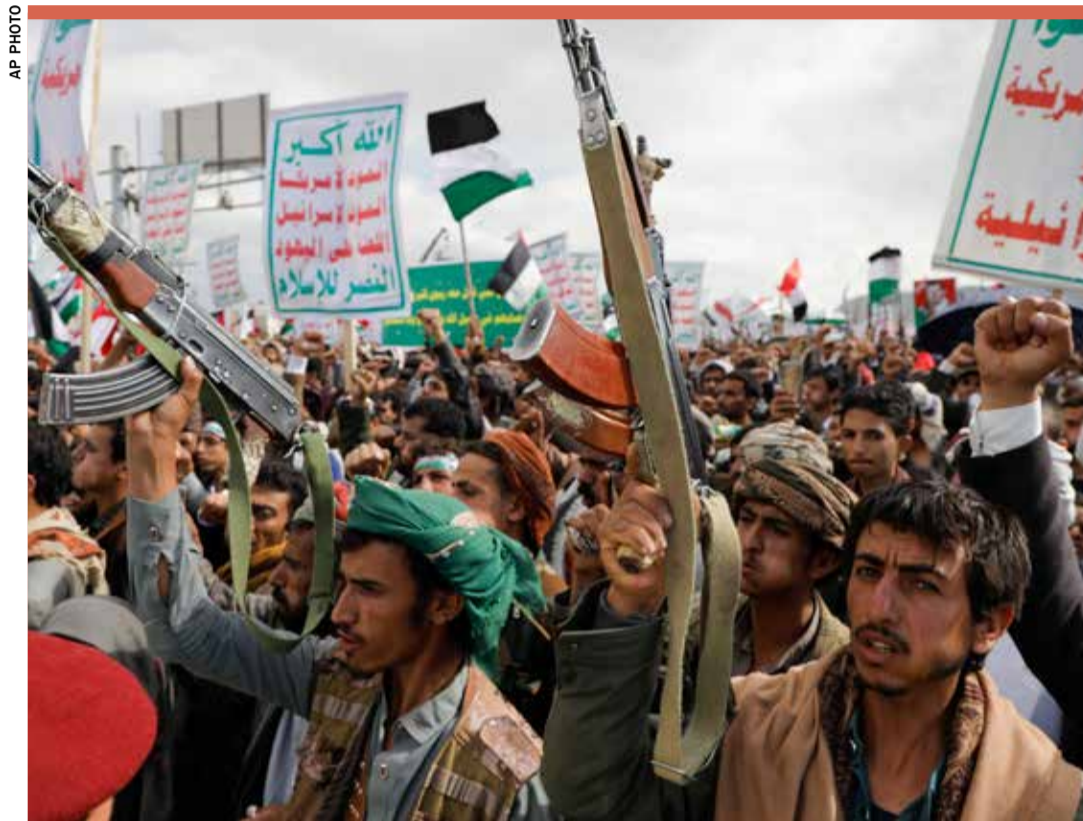
Houthi supporters attend a rally against the U.S. airstrikes on Yemen, last week

which fly at speeds higher than Mach 5, could pose crucial challenges to missile defense systems because of their speed and maneuverability.