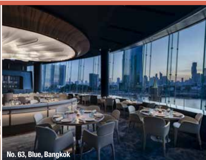
No. 63, Blue, Bangkok