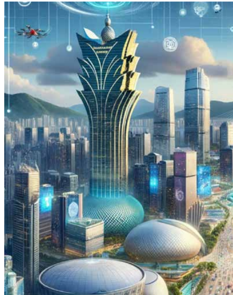
AI-generated illustrative scene capturing the essence

Having dedicated a large part of my professional career of more than 35 years in the areas of business management and communications, and to promoting technological and scientific development, I believe that in order to achieve a sustainable development strategy for Macau, Information and Communication Techno-