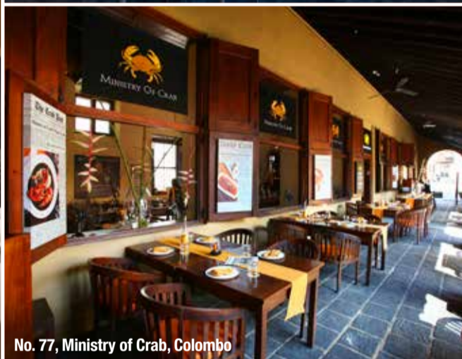
No. 77, Ministry of Crab, Colombo

press One To Watch Award 2024 and sits at No.97. Howard's Gourmet from Hong Kong enters the list at No.100 with its reinvented Chinese fine cuisine.