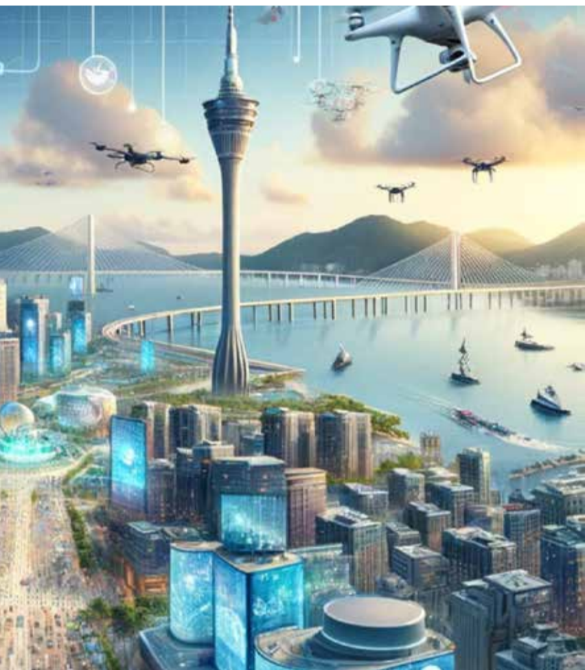
e of integrating GBA with a focus on Macau's telecom and tech

technology; stimulate competition between telecommunications operators, and encourage the entry of new service operators, enabling an improvement in services and more competitive prices for consumers; and encourage technological innovation, which through specific support, as well as the implementation of policies that facilitate the development and adoption of new technologies, will facilitate the establishment of startups and technology companies.