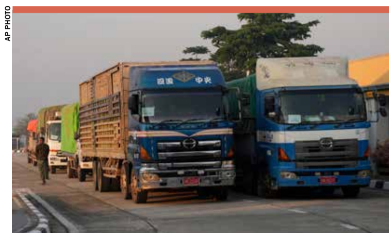
A Myanmar's truck driver walks by his truck carrying aid before they leave the customs checkpoint near the Thai border with Myanmar, in Mae Sot

Thailand sent ten trucks over the border from the northern province of Tak, carrying some 4,000