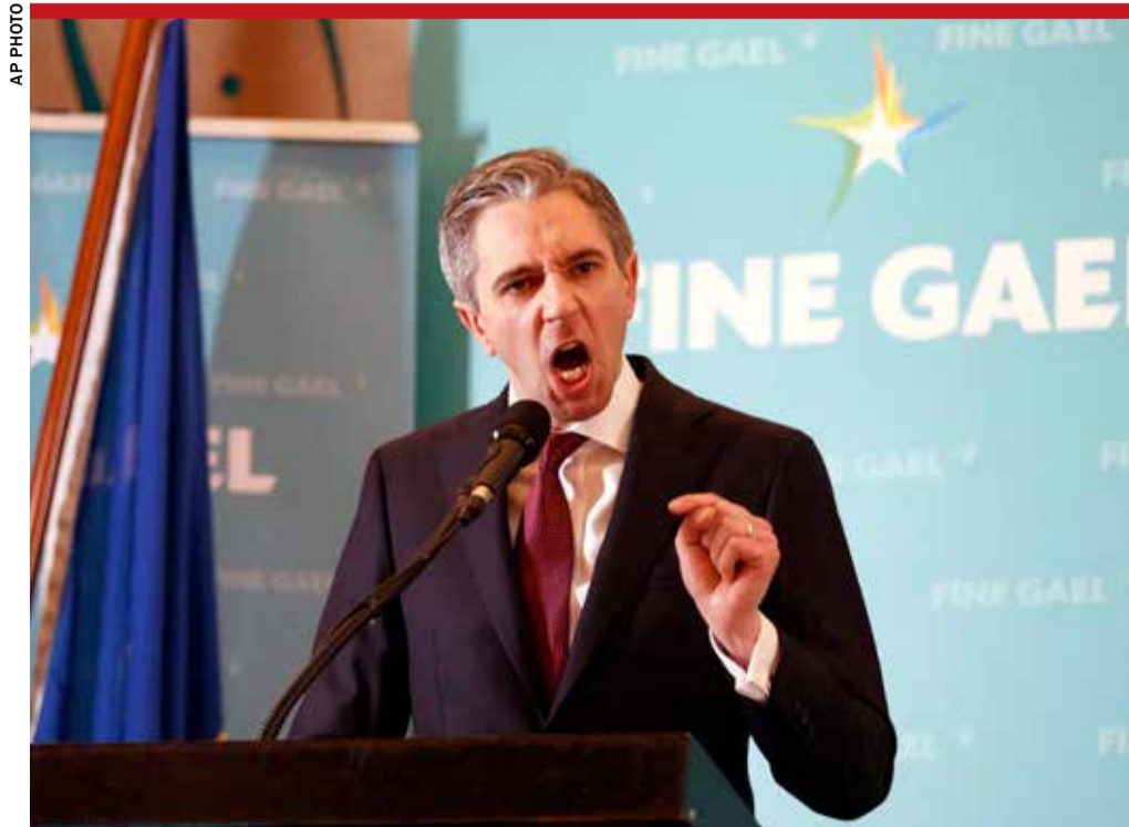
Simon Harris speaks after being confirmed as the new leader of Fine Gael, paving the way for him to become Ireland's youngest premier

France has repeatedly been hit by deadly Islamic State attacks, including the Bataclan theater massacre in 2015 in which extremists opened fire on concert-goers and held hostages for hours. French troops have also fought against Islamic extremists in the Middle East and Africa.