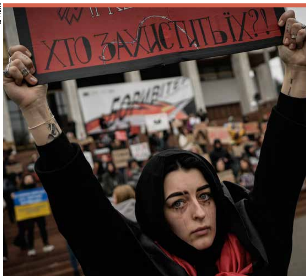
A woman holds a sign during a protest in Kyiv

The object entered near Oserdow, a village in an agricultural region near the border with Ukraine, and stayed in Polish airspace for 39 seconds, the statement said. It wasn't immediately clear if Russia intended for