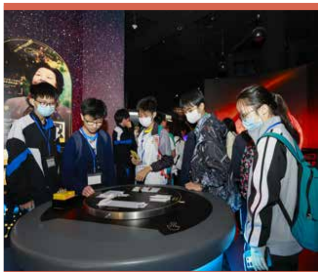
Museum, Macau Tower and Macao Grand Prix Museum.

The statement said the young travelers explored different famous attractions such as the Ruins of St. Paul's, Na Tcha Temple, Mount Fortress, Macao