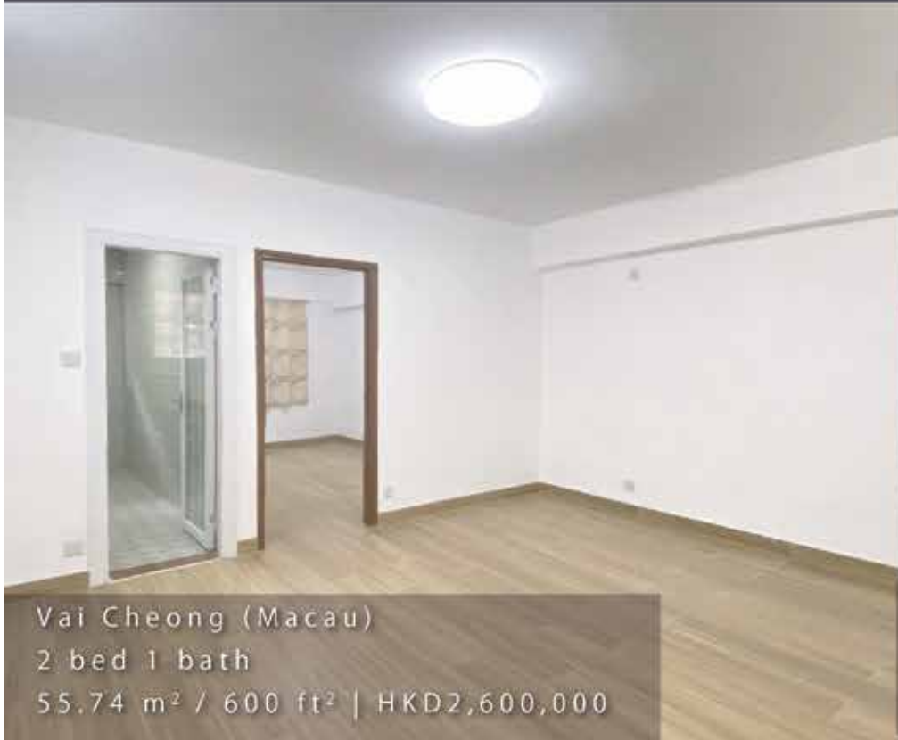
Vai Cheong (Macau) 2 bed 1 bath 55.74 m 2 / 600 ft 2 | HKD2,600,000