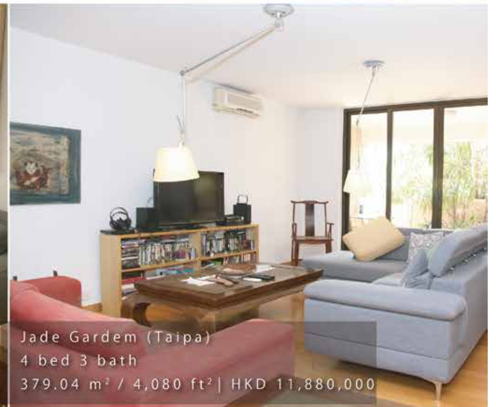
Jade Gardem (Taipa) 4 bed 3 bath 379.04 m 2 / 4,080 ft 2 | HKD 11,880,000