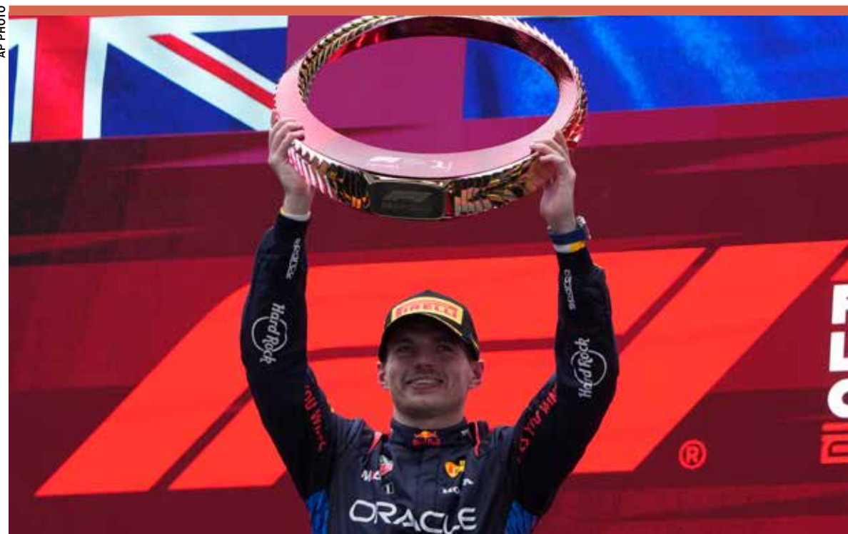
Red Bull driver Max Verstappen of the Netherlands

"It felt amazing," Verstappen said. "All weekend we were incredibly quick and it was just enjoyable to drive. The car was basically on rails and I could do whatever