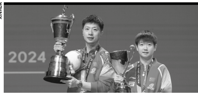
Ma Long and Sun Yingsha