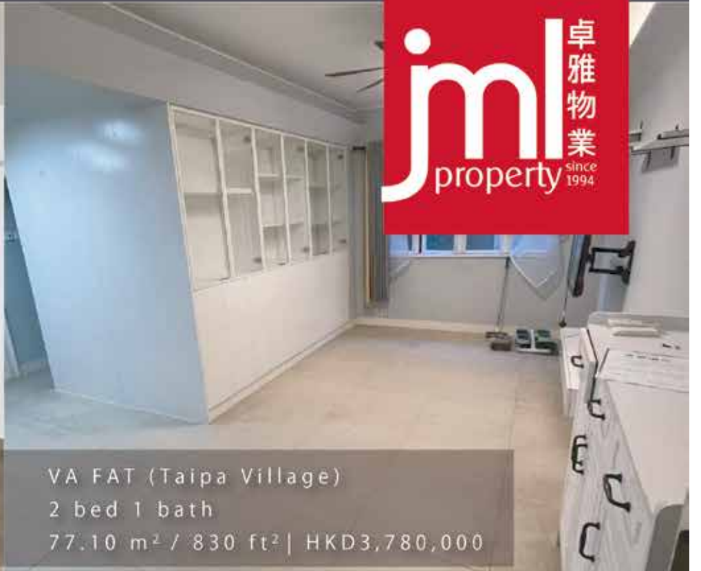
VA FAT (Taipa Village) 2 bed 1 bath 77.10 m 2 / 830 ft 2 | HKD3,780,000