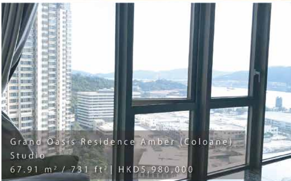
Grand Oasis Residence Amber (Coloane) Studio 67.91 m 2 / 731 ft 2 | HKD5,980,000