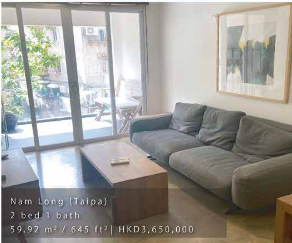
Nam Long (Taipa) 2 bed 1 bath 59.92 m 2 / 645 ft 2 | HKD3,650,000