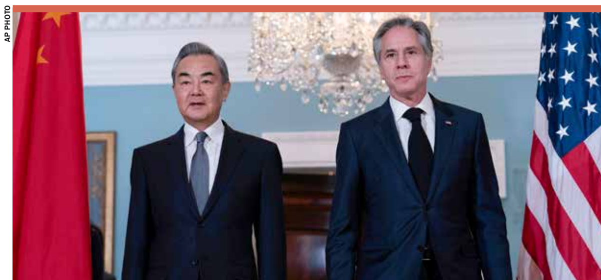
Secretary of State Antony Blinken, right, accompanied by China's Foreign Minister Wang Yi, walk to meet the media after a bilateral meeting at the State Department in Washington last year

The State Department said Saturday that Blinken, on his second visit to China in less than a year, will travel to Shanghai and Beijing starting Wednesday for three days of meetings with senior Chinese officials, including Foreign Minister Wang Yi. Talks between Blinken and Chinese President Xi Jinping are expected, although neither side will confirm such a meeting is happening