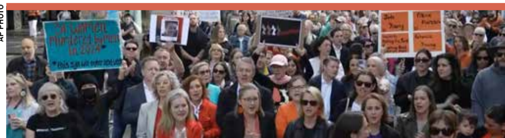
People march and shout slogans during a protest against gender-based violence in Melbourne, Sunday

Albanese said there needed to be more focus on perpetrators and prevention of violence. "We need to change the culture, we need to change attitudes — we need to change the legal system," Albanese told the rally.