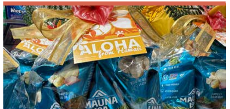
Packages of macadamia nuts are displayed on store shelves in Honolulu

Macadamia nut trees are native to Australia and were introduced to Hawaii in 1881 by a Scotsman who managed a Big Island sugar mill. The first major attempt at commercial planting dates to 1948. Chocolate-covered macadamia nuts took off the following decade. In the 1970s and '80s, Hawaii harvested more than 10 times the amount of the next four major producers combined.