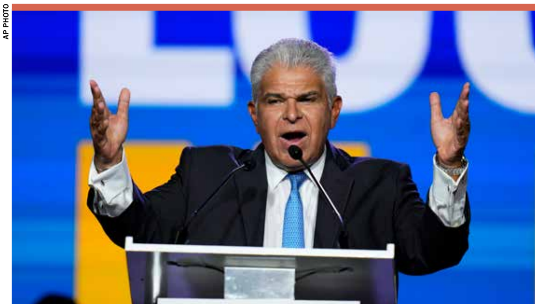
The presidential candidate Jose Raul Mulino addresses supporters during a campaign rally in Panama City, Sunday