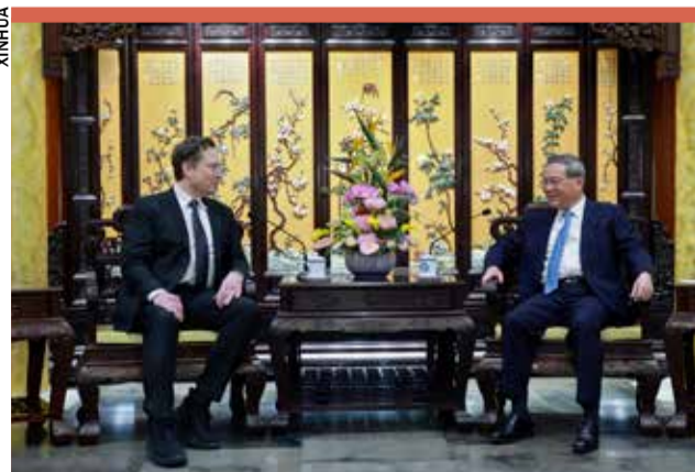
Tesla founder and CEO Elon Musk (left) meets with Chinese Premier Li Qiang in Beijing

The San Diego Zoo Wildlife Alliance has a nearly 30-year partnership with leading conservation institutions in China focused on protecting and recovering giant pandas and the bamboo forests they depend on. MDT/AP