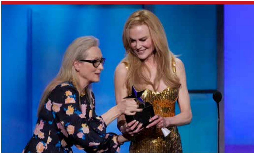
Meryl and Nicole at the Dolby Theatre in LA, last weekend