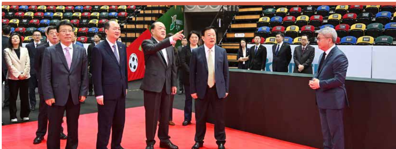
Director Xia Baolong visits the Macao East Asian Games Dome and the Athlete Training and Development Centre