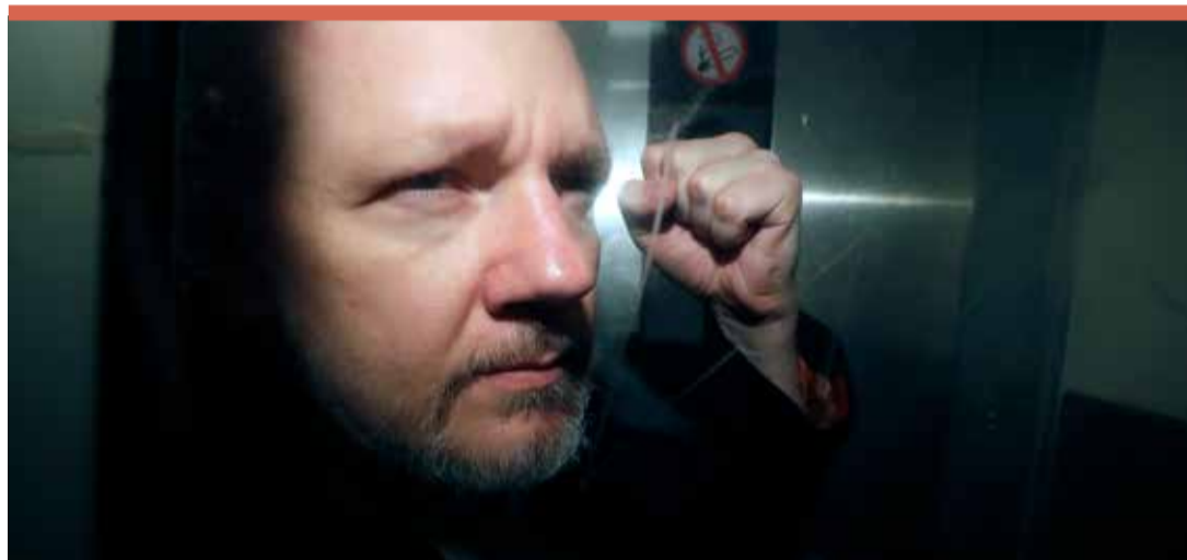
WikiLeaks founder Julian Assange being taken from court, London, 2019

Among the files published by WikiLeaks was video of a 2007 Apache helicopter attack by American forces in Ba-