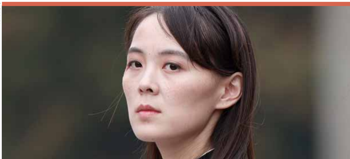
Kim Yo Jong

"We have no intention to export our military technical capabilities to any country or open them to the public," she said in a statement carried by state media.