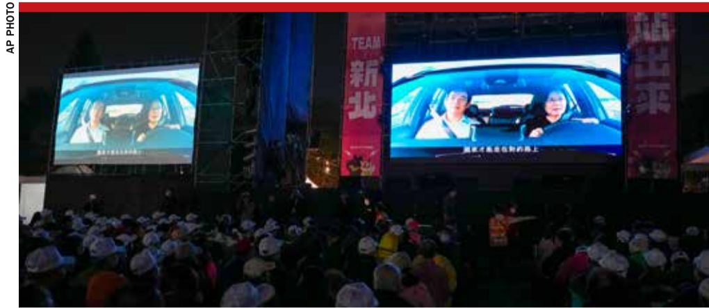
Supporters watch an ad showing then Taiwan Democratic Progressive Party (DPP) candidate Lai Ching-te in a car driven by incumbent leader Tsai Ing-wen during a rally held in New Taipei, Taipei, Saturday

Ya Lun and Xi Lun, born in 2016, are the youngest of seven pandas born at Zoo Atlanta since their parents arrived.