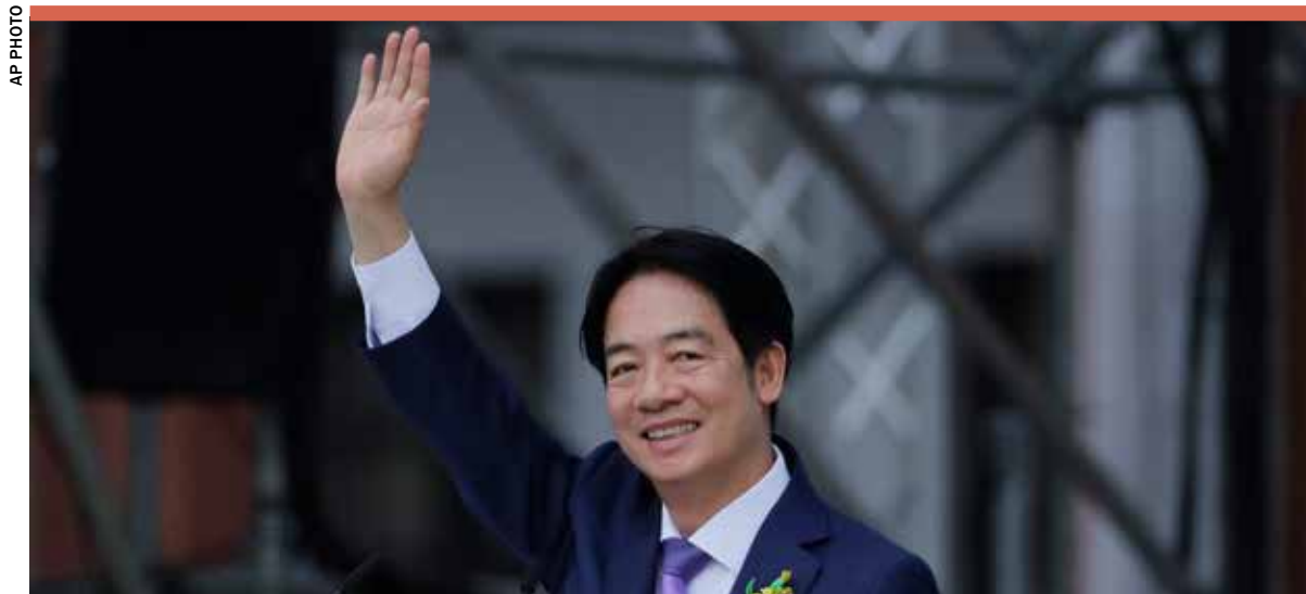
Lai Ching-te waves during his inauguration ceremonies in Taipei, yesterday

The Chinese office in charge of Taiwan affairs criticized Lai's inauguration speech as promoting "the fallacy of separatism," inciting confrontation and relying on foreign forces to seek independence.