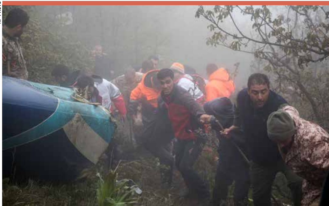
rescue team members work at the scene of a crash of a helicopter carrying Iranian President Ebrahim Raisi in Varzaghan in northwestern Iran, yesterday

"One of the main culprits of yesterday's tragedy is the United States, which ... embargoed the sale of aircraft and aviation parts to Iran and does not allow the people of Iran to enjoy good