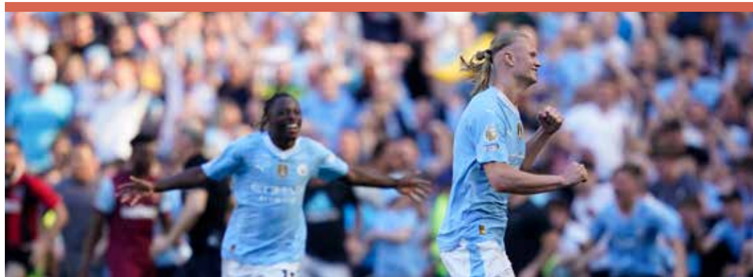
Manchester City's Haaland (right) and Doku celebrate at the end of the English Premier League soccer match between Manchester City and West Ham

pped West Ham midfielder James Ward-Prowse and unleashed a left-foot shot outside the area that rocketed into the top corner. The goal was timed at just under 80 seconds.