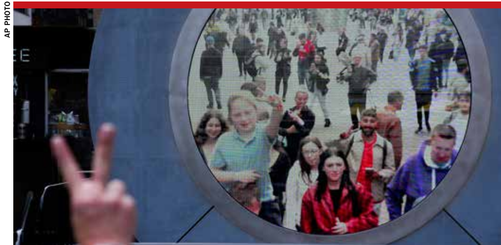
People in both New York and Dublin, Ireland, wave and signal at each other while looking at a livestream view of one another as part of an art installation on the street in New York

The two are currently both in a stable condition.