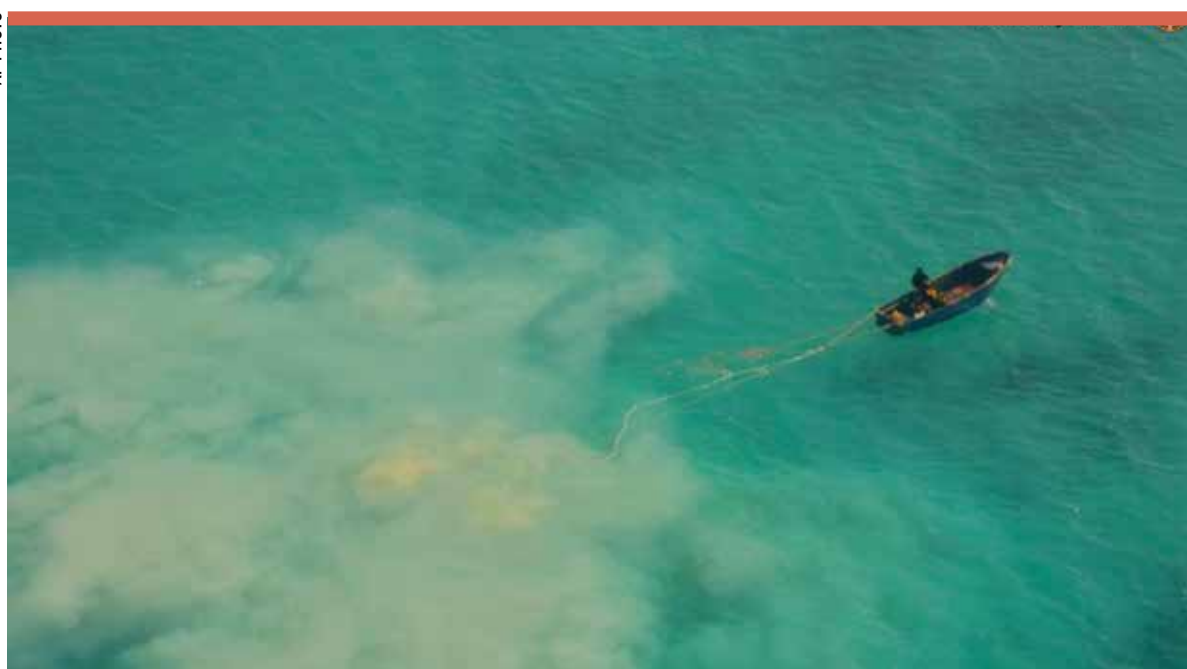
In this April 22, 2019 handout photo provided by the Philippine Coast Guard, Chinese service boats scour the seabed as they search for giant clams in the Scarborough shoal

The Chinese Embassy in Manila did not immediately respond to requests for comment. Beijing has repeatedly asserted its sovereignty over much of the busy South China Sea. The territorial disputes involve China, the Philippines, Vietnam, Malaysia, Brunei and Taiwan. The Indonesian navy has also been involved in skirmishes with the Chinese coast guard and fishing vessels in the Natuna waters in the margins of the South