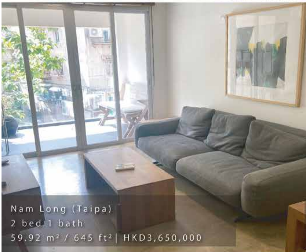
Nam Long (Taipa) 2 bed 1 bath 59.92 m 2 / 645 ft 2 | HKD3,650,000