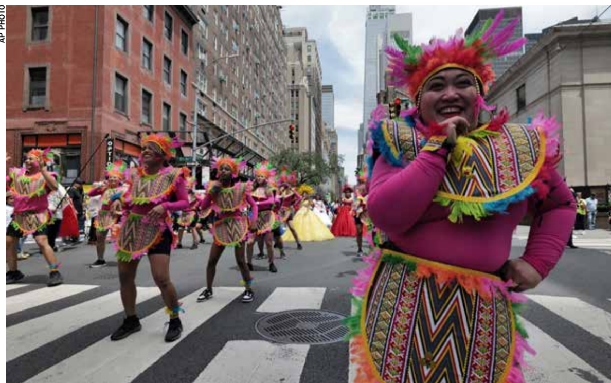
A Philippine Independence Day parade in New York, last week

The fight for independence dates back to 1565 when Spain colonized the Philippines, naming it for King Philip II. It wasn't until 1896 though that talk of revolution catalyzed action. Andrés Bonifacio, a leader of the Katipunan, a brotherhood of anti-Spain revolutionaries, and others tore up their "cedulas," residential tax