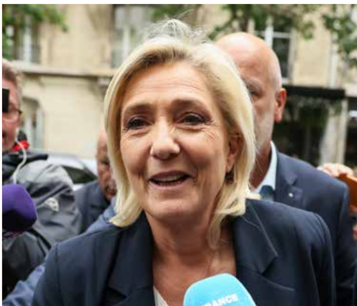
Winners and allies: Giorgia Meloni and Marine Le Pen