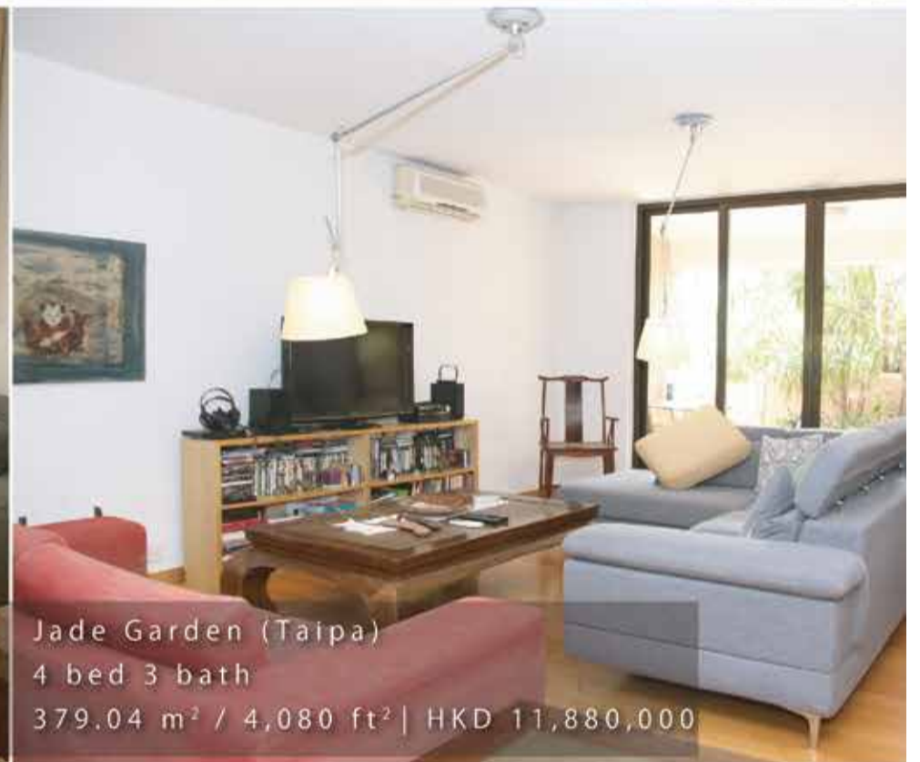
Jade Garden (Taipa) 4 bed 3 bath 379.04 m 2 / 4,080 ft 2 | HKD 11,880,000