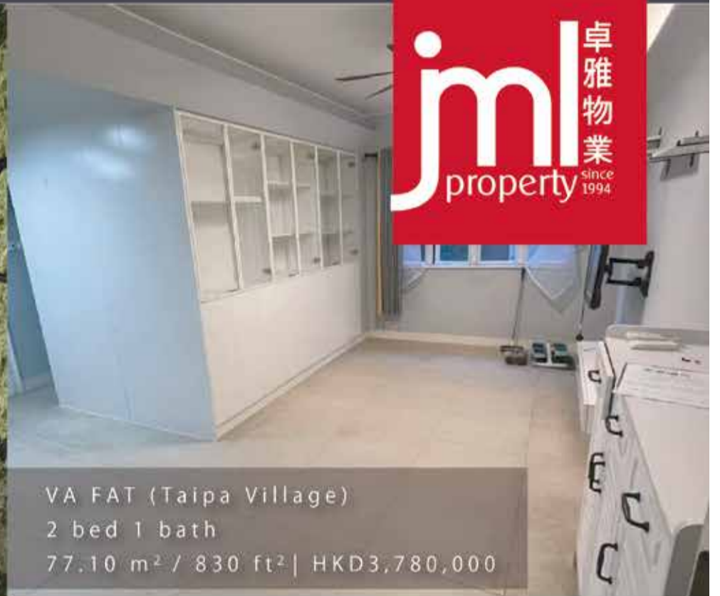
VA FAT (Taipa Village) 2 bed 1 bath 77.10 m 2 / 830 ft 2 | HKD3,780,000