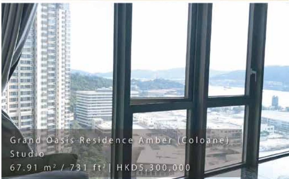
Grand Oasis Residence Amber (Coloane) Studio 67.91 m 2 / 731 ft 2 | HKD5,300,000