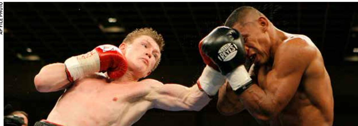
Ricky Hatton (left) of England, lands a left to the face of Juan Urango, of Colombia, in the seventh round of their IBF Jr. welterweight title boxing match in Las Vegas, in 2007

Moorer, who went 52-4-1 with 40 knockouts, said he has undergone 28 surgeries and been left without the ability to smell or taste. He said it was imperative for