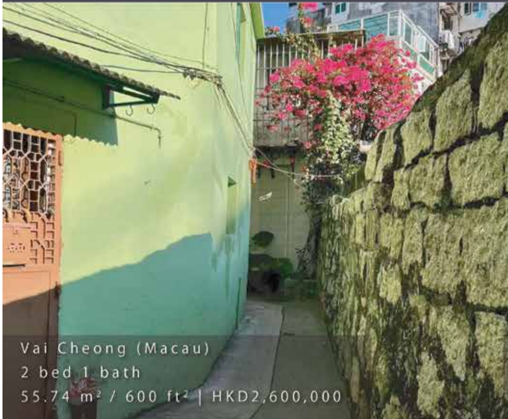
Vai Cheong (Macau) 2 bed 1 bath 55.74 m 2 / 600 ft 2 | HKD2,600,000