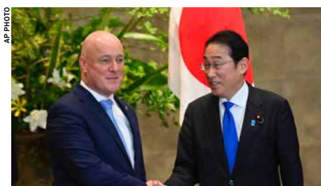
New Zealand Prime Minister Christopher Luxon, left, and Japan Prime Minister Fumio Kishida shake hands prior to their bilateral meeting at Kishida's office in Tokyo

Kishida and Luxon condemned "in the strongest possible terms" the increasing military cooperation between North Korea and Russia, including the North's shipment to Russia of ballistic missiles used against Ukraine, the joint statement said. MDT/AP