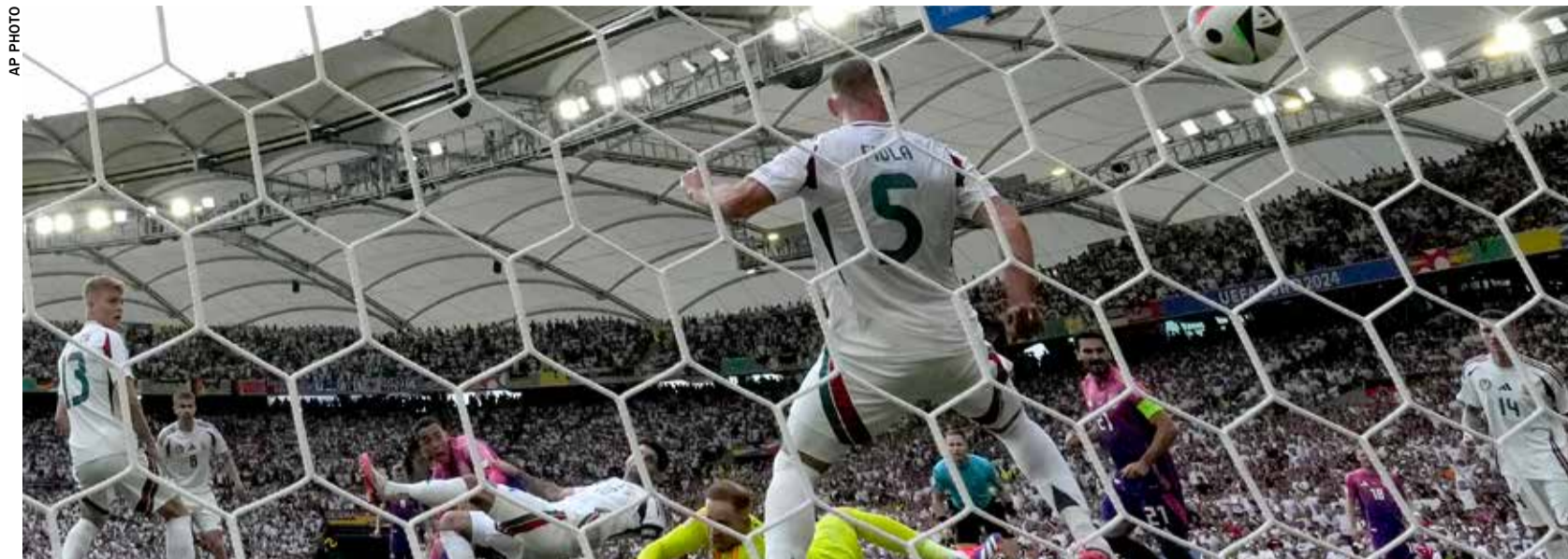
Germany's Jamal Musiala, third left, scores the opening goal during a Group A match between Germany and Hungary at the Euro 2024 soccer tournament in Stuttgart, Germany