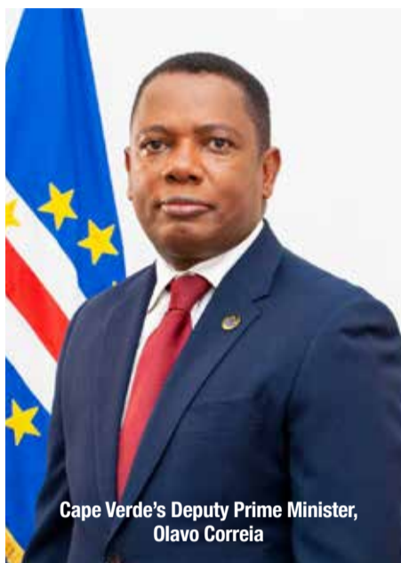
Cape Verde's Deputy Prime Minister, Olavo Correia

to reach an amicable agreement, Correia explained that these statements were referring to the extended period that the Cape Verde government gave to MLD to propose a solution.