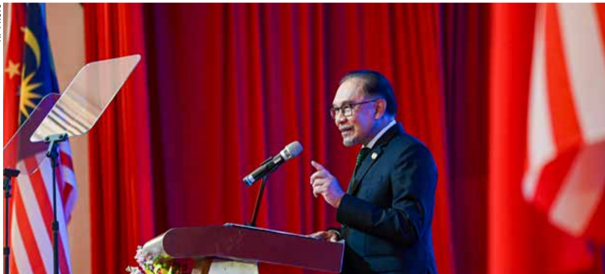
Malaysian Prime Minister Anwar Ibrahim speak during a business luncheon with China's Premier Li Qiang at a hotel in Kuala Lumpur, Malaysia, yesterday

having a neutral stance, have the resolve to work with all countries and with China," he said. "We see Premier Li Qiang as a friend that would work together with us."