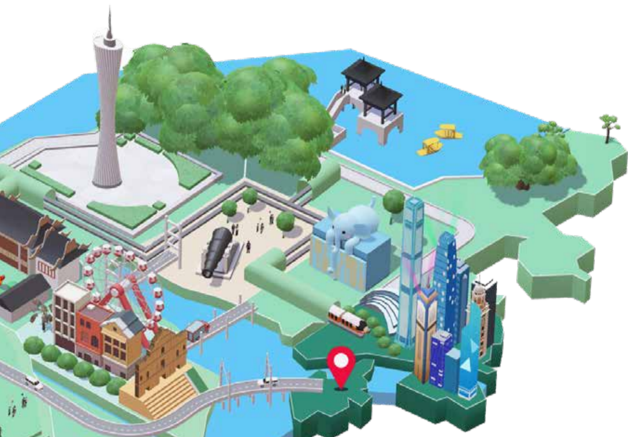
Artistic rendition of the 11 cities of GBA

world these Local Futures. The state can also drive vibrant interaction between community and visitor engagement. The reserve of government-safeguarded land in Macau is an example of a potential eco-tourism asset which may promise to deliver all three economic, ecological and socio-cultural activities. While these plots sit idle waiting for more permanent allocation of use (The Times June 14), they could be temporarily converted into urban farming centres, even for just one growing season: They would be places for people to gather,