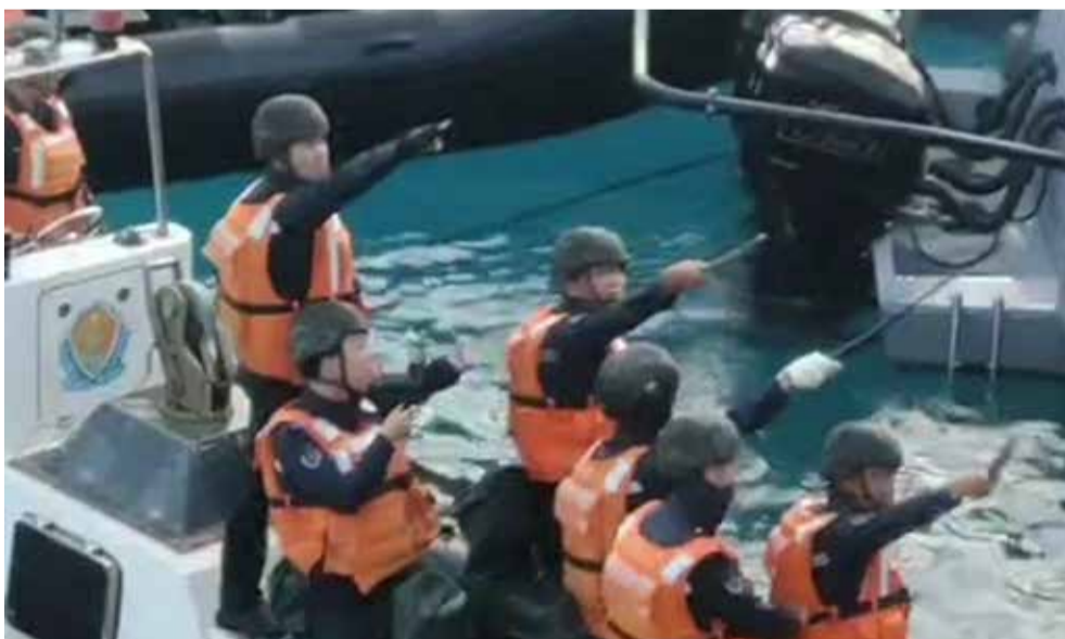
Chinese Coast Guard hold knives and machetes as they approach Philippine troops on a resupply mission in the Second Thomas Shoal at the disputed sea earlier this week

boat with a pole and grab what appears to be a bag with a stick.