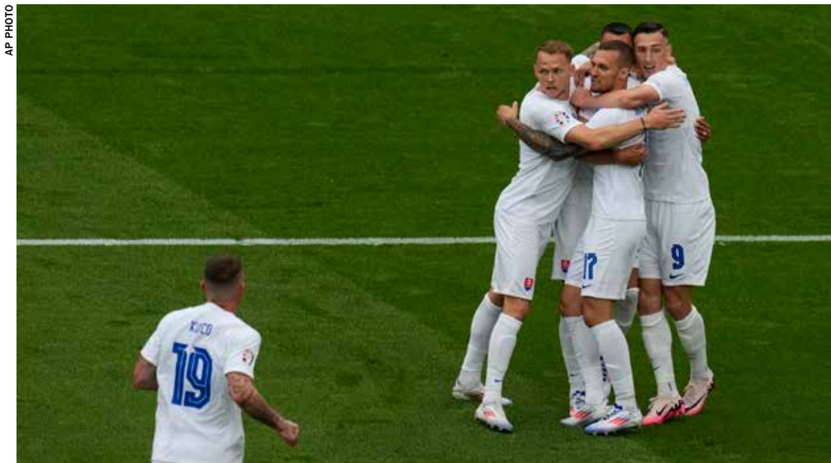
Slovakia players celebrate after teammate Slovakia's Ivan Schranz scored the opening goal during the Group E match between Belgium and Slovakia at the Euro 2024 soccer tournament in Frankfurt, Germany, Monday