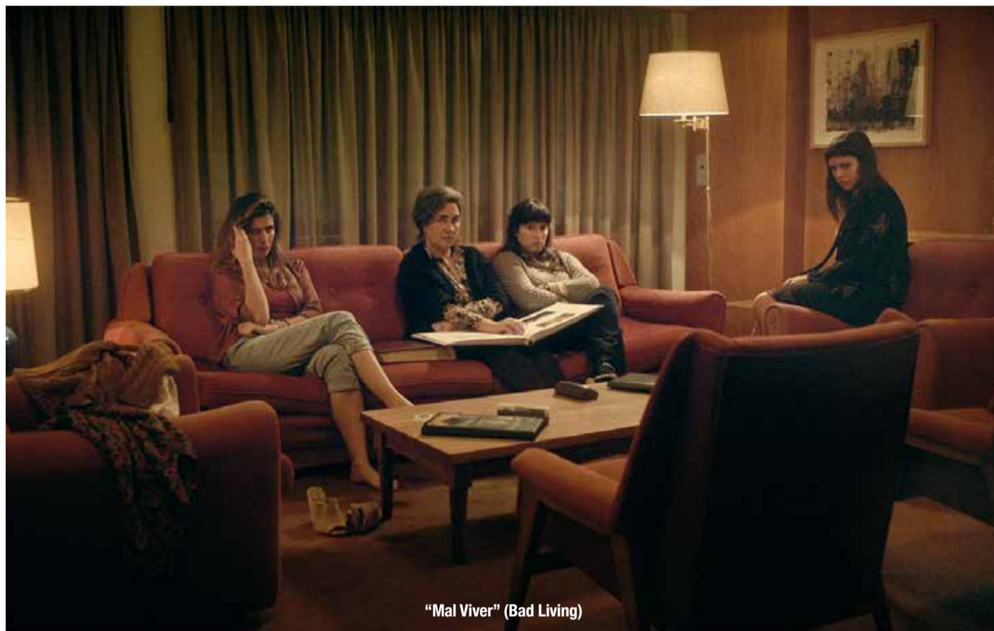
"Mal Viver" (Bad Living)