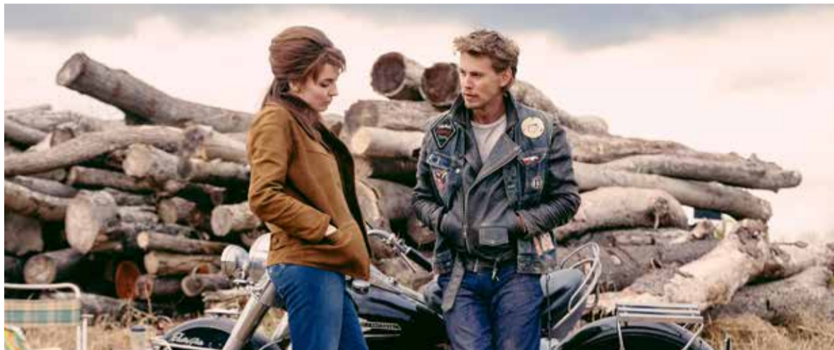
This image shows Jodie Comer, left, and Austin Butler in a scene from "The Bikeriders"

It's not hard to see what Nichols saw in Lyon's black-and-white stills. There's the stylish raw materials — the chrome bikes, the slicked back hair, the black leather jackets. But there's also a just emerging anti-authoritarian, easy-riding spirit and camaraderie. Like the central figures of "Loving," they are classically drawn outsiders who encapsulate something glorious and uneasy about freedom in America.