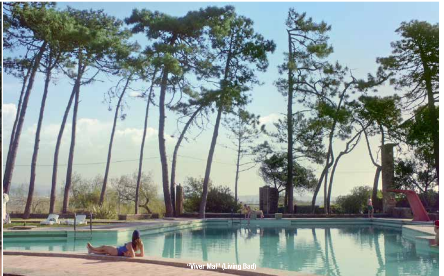
"Viver Mal" (Living Bad)