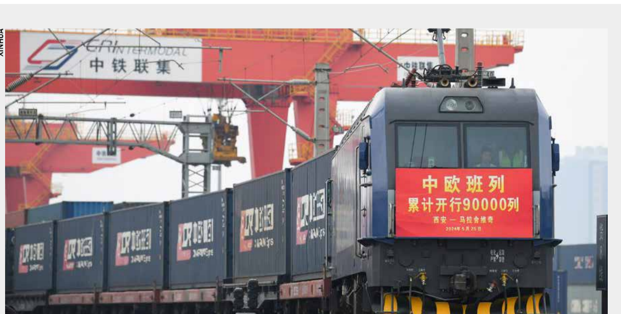
A panoramic view of Nansha Jiaomen River in Guangzhou, South China's Guangdong province

local wetlands. An Embedded Economy model is a useful way to grasp the concept that when any one element in the model or system is changed, it shifts the whole. Should there be an articulated and clear vision as to what the whole looks like – a clear and crisp story – then when each element is changed, removed or added, it can be assessed against how it will contribute to a realisation of the whole, whether that be eco-tourism or another story. Should integration into the GBA shift the vibrancy of our SME retail trade or other elements in Macau, a vision for an alternative story – another integrated and whole system - may guide what is to be done with our built, communal, human and natural assets.