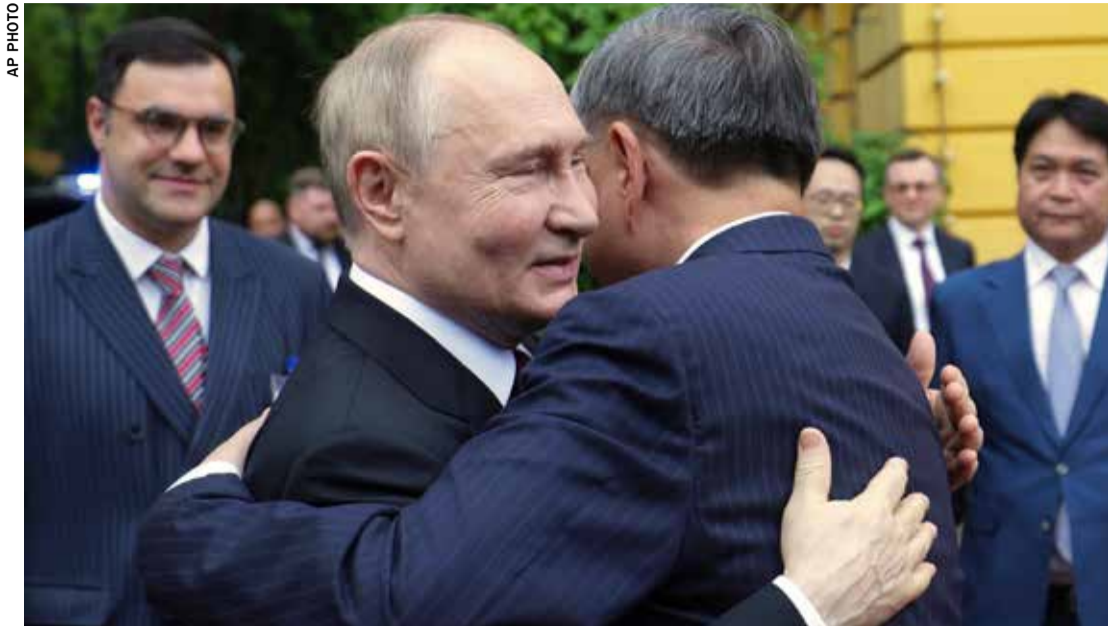
Russian President Vladimir Putin, left, and Vietnamese President To Lam embrace during an official welcome ceremony at the Presidential Palace, in Hanoi, yesterday