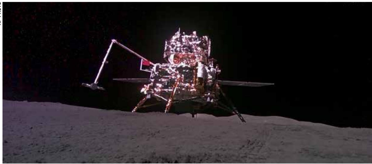
Lander-ascender combination of Chang'e-6 probe taken by a mini rover after it landed on the moon surface

The samples "are expected to answer one of the most fundamental scientific questions in lunar science research: what geologic activity is responsible for the differences between the two sides?" said Zongyu Yue, a geologist at the Chinese Academy of Sciences, in a statement issued in