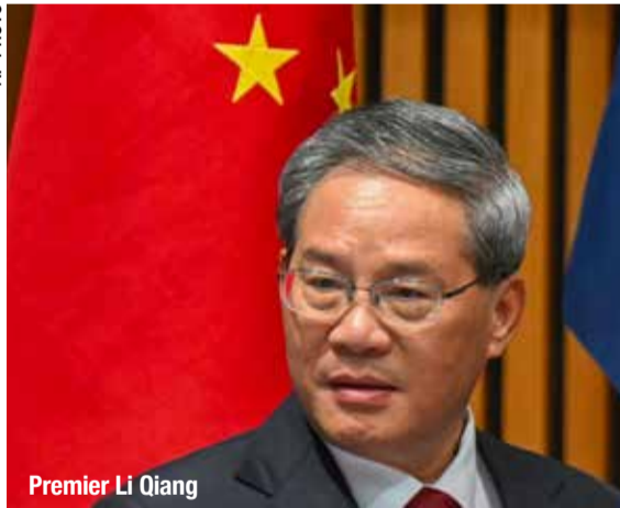
Premier Li Qiang

China and the E.U. said over the weekend they are open to talks over the tentative tariffs after Beijing last week announced an anti-dumping probe into European pork, largely seen as retaliation for the EV duties.