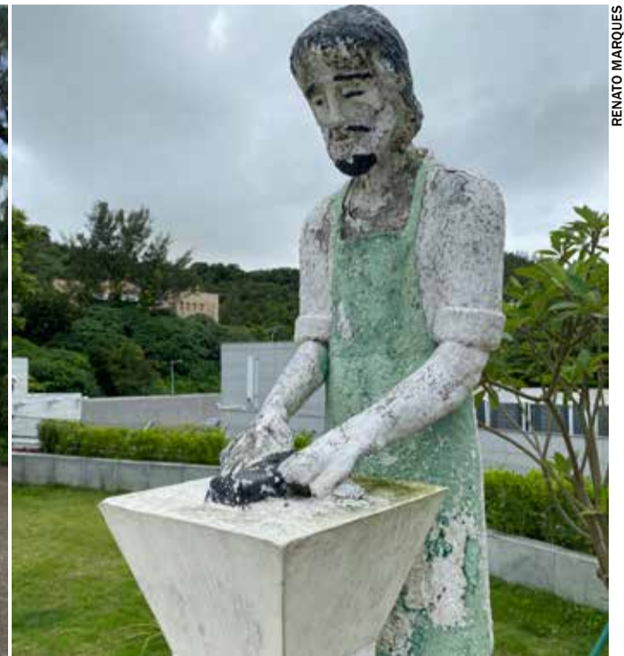
Before and after of Guardian Angel and Child, and Saint Joseph the Worker