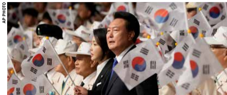
South Korean President Yoon Suk Yeol, center right, his wife Kim Keon Hee wave the national flags during a ceremony to mark the 74th anniversary of the outbreak of the Korean War in Daegu, South Korea, yesterday

In its earlier balloon launches, North Korea dropped manure, ci-