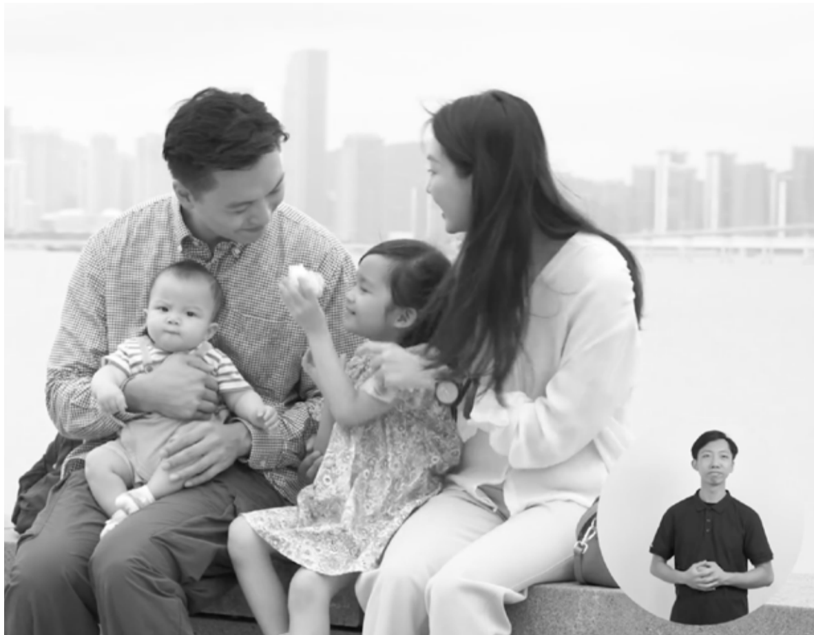
A screenshot from the "Having children brings greater happiness" video

"Macau is really bad on birth policies. Macau has 70 days of ma-