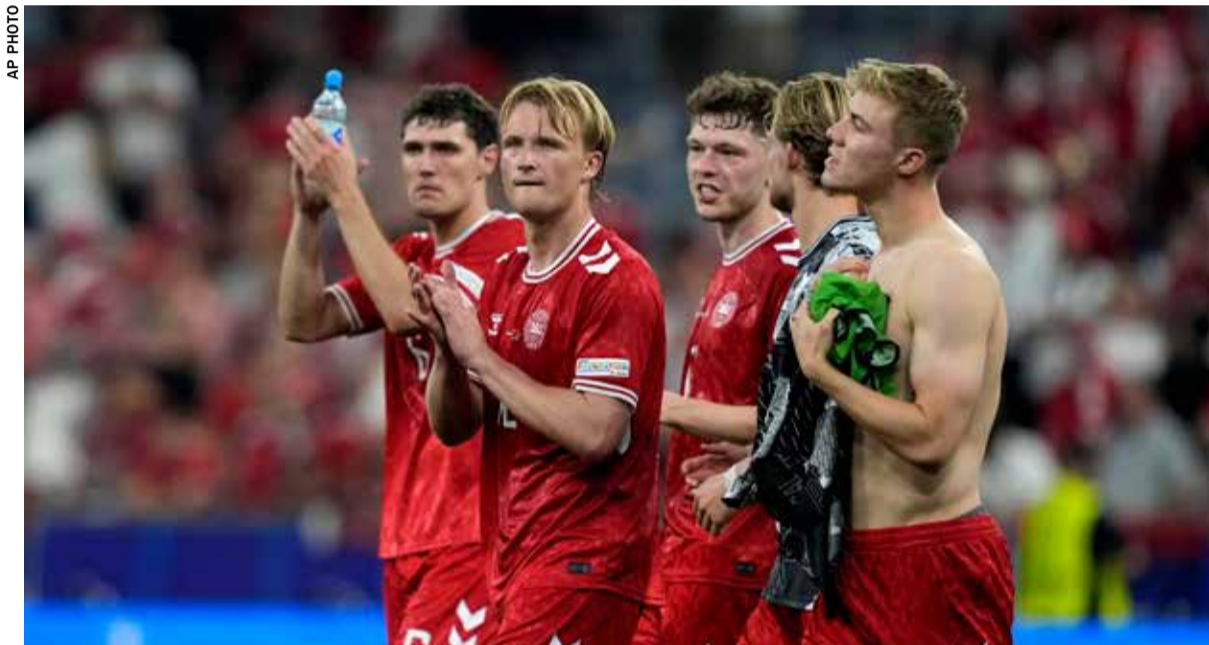
Denmark’s Andreas Christensen (6), Kasper Dolberg (12) and teammates react after a Group C match between Denmark and Serbia at the Euro 2024 soccer tournament in Munich, Germany, yesterday

Disappointed Serbian fans hurled plastic cups onto the field after the disallowed goal, causing a brief stoppage as stewards ran to clear them.