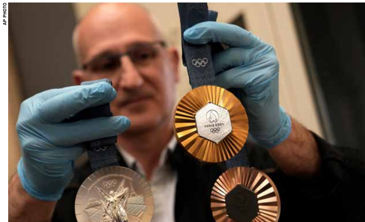
An employee holds medals for the upcoming 2024 Paris Olympic and Paralympic Games after the finishing touches were added, in the workshops of La Monnaie de Paris, in Paris

Gracenote's ranking is based on overall medals won, although others focus the rankings on gold totals. The International Olympic Committee does not