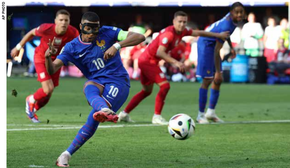
Kylian Mbappe of France sores the opening goal by penalty kick during a Group D match between the France and Poland at the Euro 2024 soccer tournament in Dortmund, Germany, yesterday

"I thought he was quite good on his feet with the mask — he needed to get used to it," the coach said. "But when he sweats, that sticks in his eyes and he needed to wipe his eyes." MDT/AP