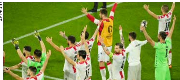
Georgia's players thank their fans after a round of sixteen match against Spain at the Euro 2024 soccer tournament in Cologne, Germany, Sunday

In its opening 3-1 loss against Turkey, Georgia scored off an elaborate passing move. In its 1-1 draw with the Czech Republic, Georgia nearly won but missed a crucial shot on the last kick of the game. The shock