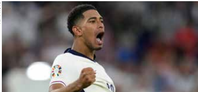
England's Jude Bellingham celebrates at the end of the round of sixteen match between England and Slovakia at the Euro 2024 soccer tournament in Gelsenkirchen, Germany, Sunday

Bellingham later posted part of a speech by Roosevelt on his Instagram channel, likely in response to the fierce criticism the England team has received at Euro 2024.