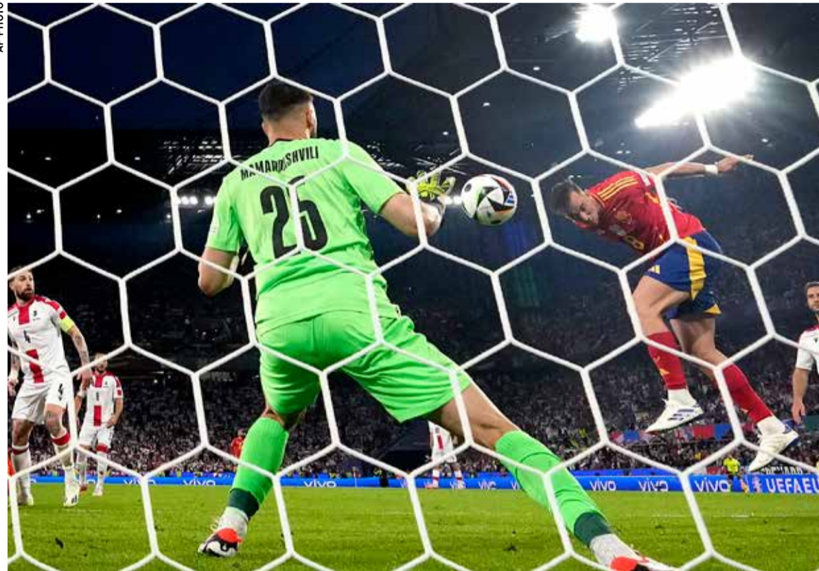
Spain's Fabian Ruiz, second right, scores his side's second goal during a round of sixteen match between Spain and Georgia at the Euro 2024 soccer tournament in Cologne, Germany, Sunday

"It was a tough game. We knew it before. Maybe they don't have the big names, but they made it hard for us," he