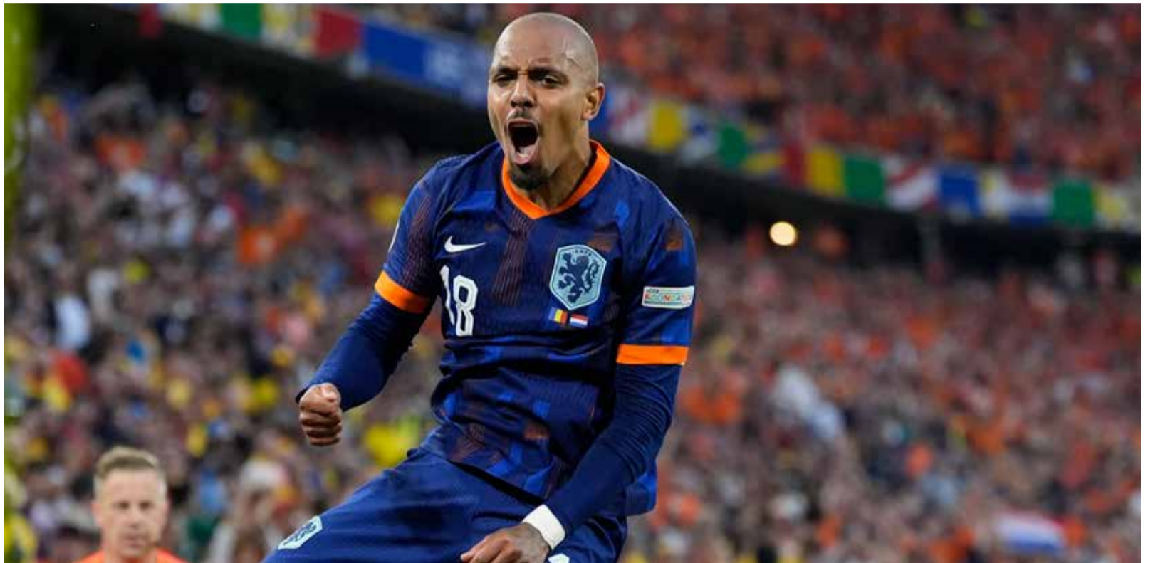
Netherlands' Donyell Malen celebrates after scoring his side's third goal during a round of sixteen match between Romania and the Netherlands