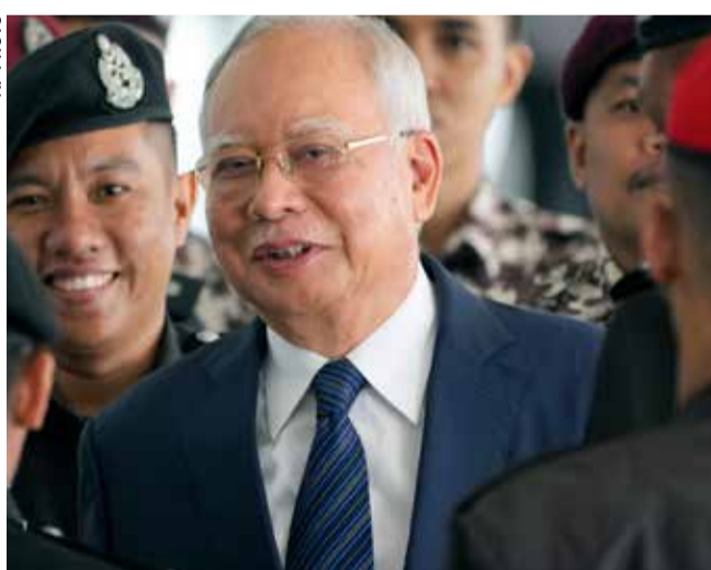
Former Malaysian Prime Minister Najib Razak

Home Minister Saifuddin Nasution Ismail said he had