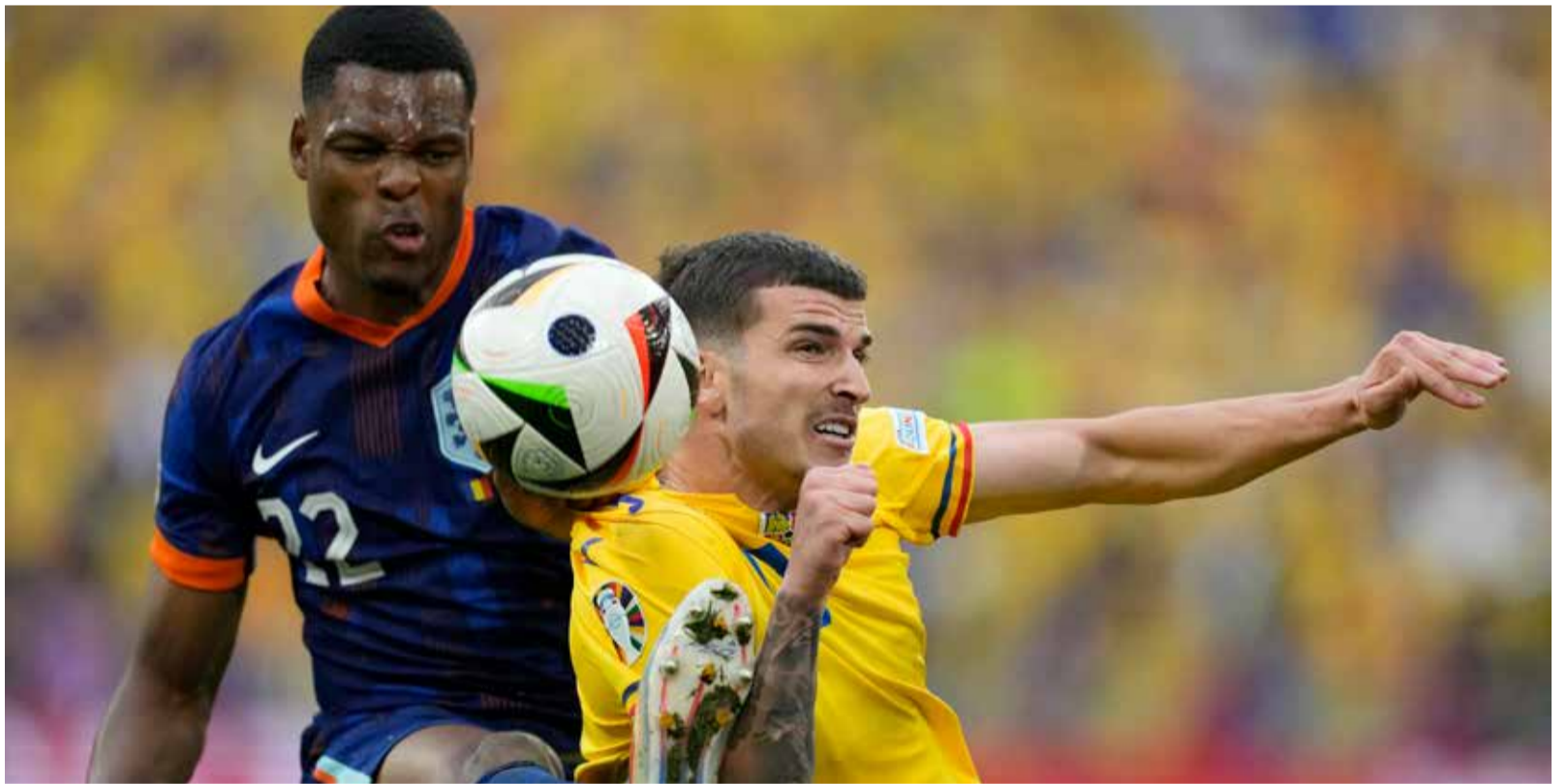
Denzel Dumfries of the Netherlands fights for the ball against Romania's Valentin Mihaila