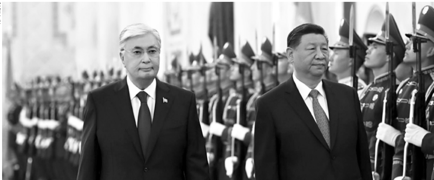
President Kassym-Jomart Tokayev, left, and Chinese President Xi Jinping attend an official welcome ceremony at the palace in Astana, Kazakhstan, yesterday