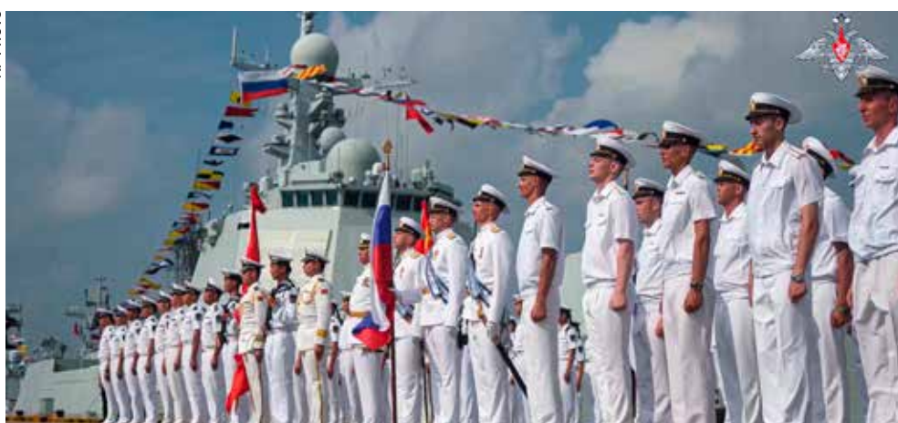
Russian military sailors attend a welcome ceremony of their joint naval forces exercise in Zhanjiang, Guangdong province, China, Sunday

began in Guangdong province yesterday and is expected to last until mid-July, aimed to demonstrate the capabilities of the navies in addressing