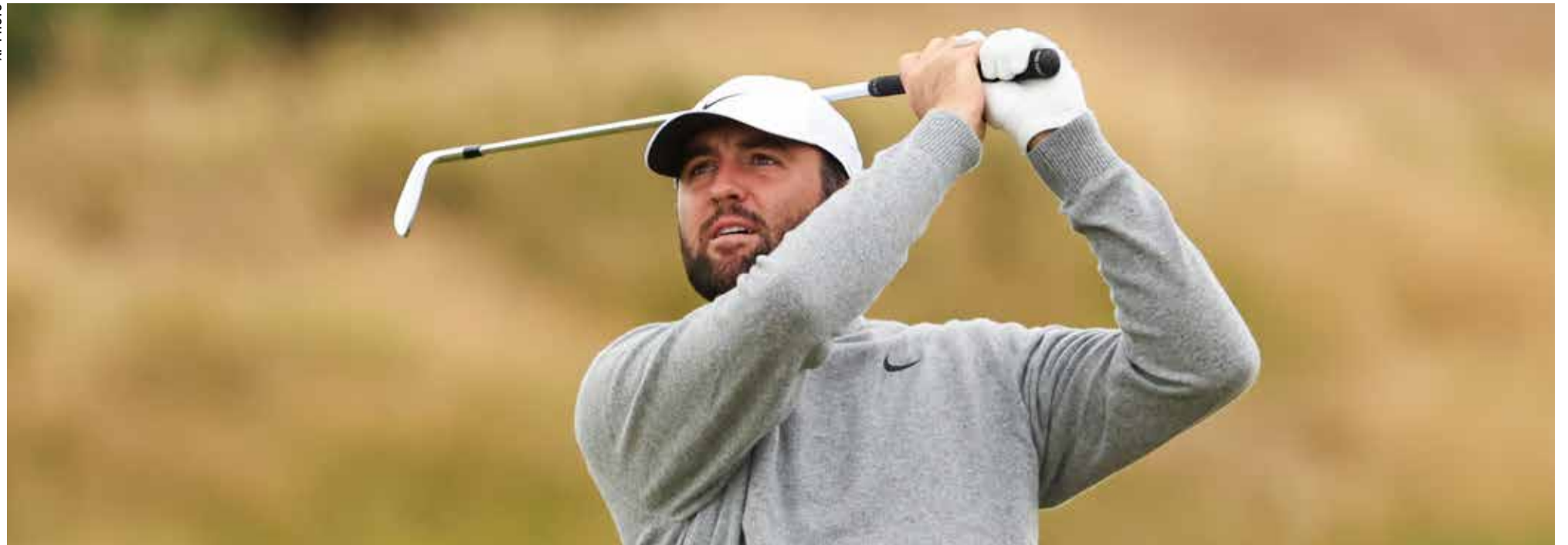
Scottie Scheffler of the United States