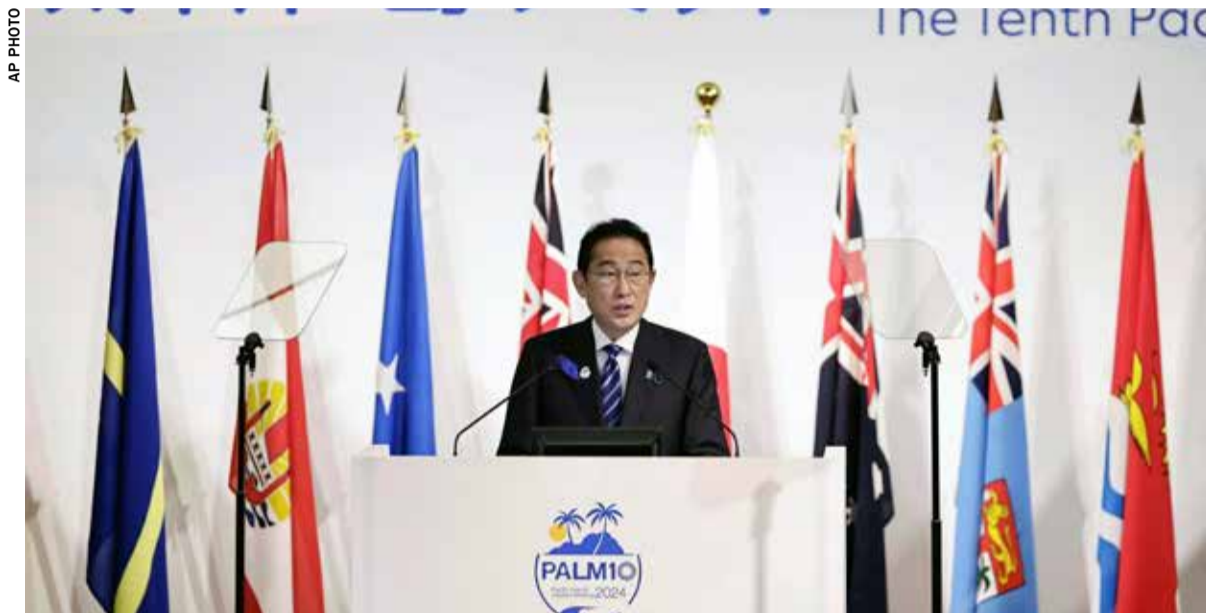
Japanese Prime Minister Fumio Kishida

In his opening remarks, Japanese Prime Minister Fumio Kishida said he hoped to elevate Japan's ties with the Pacific islands to a higher stage and renew its commitment to "walk together toward the future." He stressed the importan-