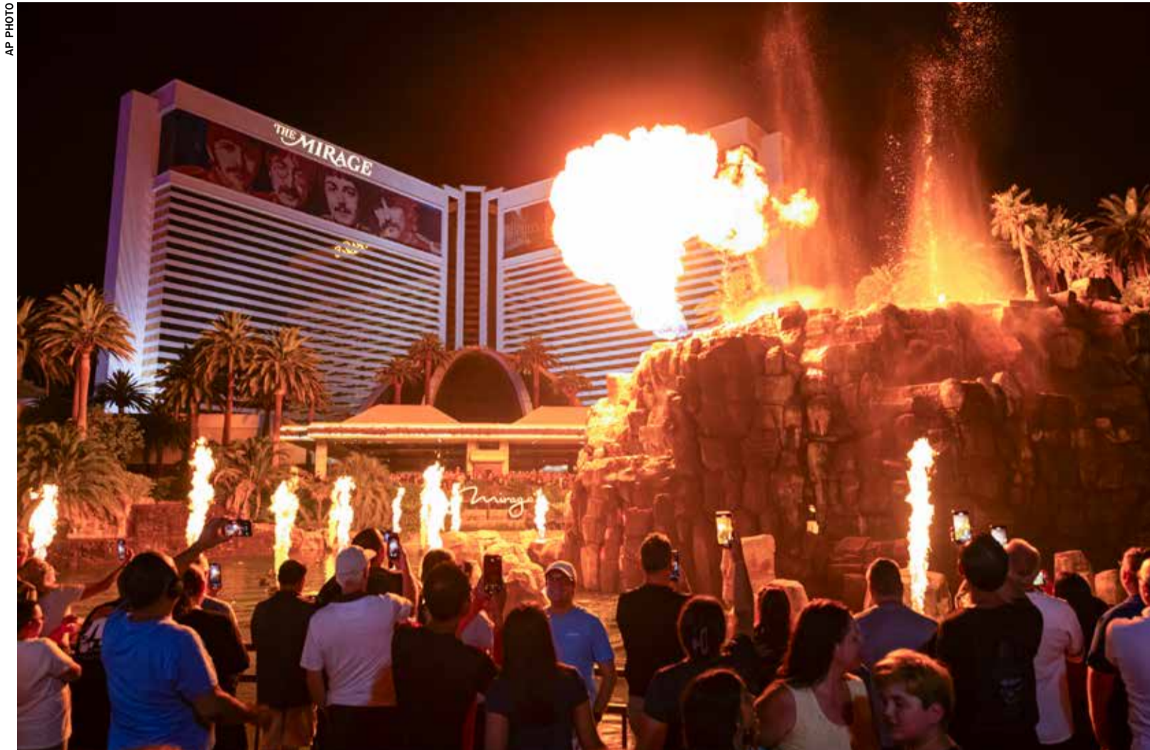
People watch the final scheduled volcano show during the final night of operations and gaming at The Mirage, earlier this week