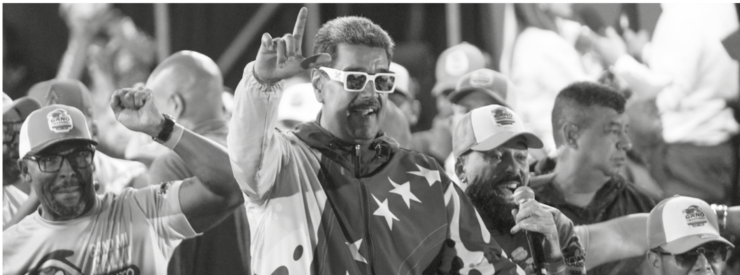
President Nicolas Maduro dances outside the Miraflores presidential palace after electoral authorities declared him the winner of the presidential election in Caracas