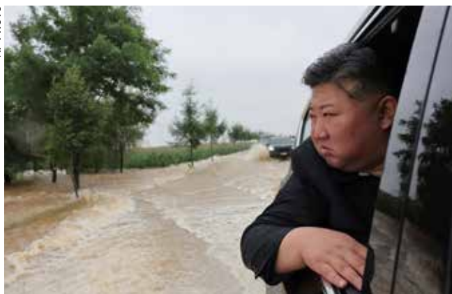
In this photo provided by the North Korean government, North Korean leader Kim Jong Un inspects a flood-hit area in North Phyongan province, this week

KCNA cited Kim as calling the rescue works "miraculous" as more than 5,000 people were saved through the efforts.