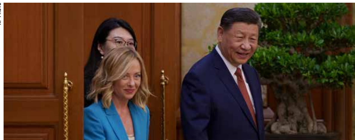
Chinese President Xi Jinping, right, walks with Italian Premier Giorgia Meloni, left, for a meeting at the Diaoyutai State Guesthouse in Beijing, China, yesterday

one of Xi's signature policies, aims to build power and transportation infrastructure around the world in order to sti-