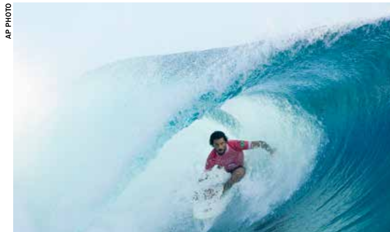
Filipe Toledo, of Brazil, surfs during the second round of the 2024 Summer Olympics surfing competition, in Tahiti

"It's been nice— everyone slept in and had a leisurely breakfast," Shane Dorian, U.S. Olympic surfing team head coach, told The Associated Press. "Some are out surfing, some are