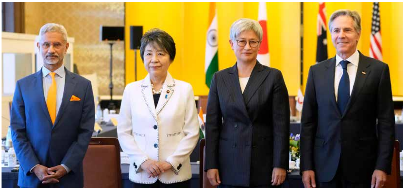
Indian External Affairs Minister Subrahmayam Jaishankar, Japanese Foreign Minister Yoko Kamikawa, Australian Foreign Minister Penny Wong and U.S. Secretary of State Antony Blinken pose for a photo ahead of the Quad Ministerial Meeting at the Foreign Ministry's Iikura guesthouse in Tokyo, yesterday

creasingly unstable, so unity and cooperation is needed more than ever among the Quad countries in securing a rules-based free and open international order.