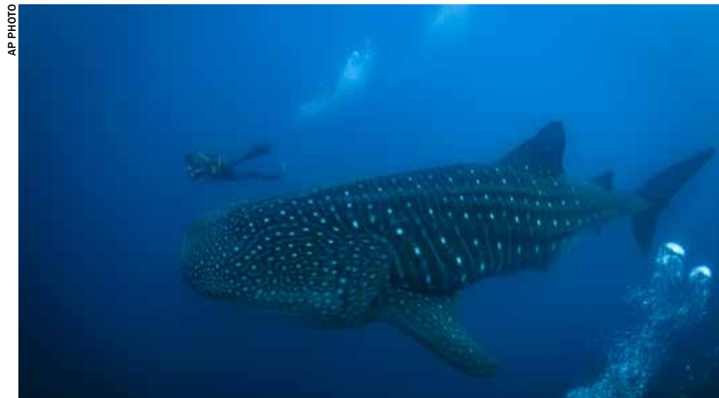
A whale shark swims through the waters off of Wolf Island, Ecuador, next to Enrique "Quike" Moran

The widely shared video is an example of how lifelike AI-generated images, videos or audio clips have been utilized both to poke fun and to mislead about politics.