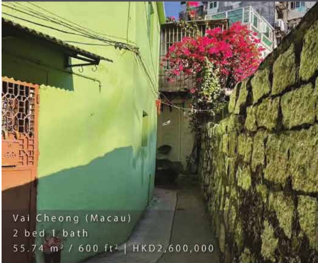
Vai Cheong (Macau) 2 bed 1 bath 55.74 m 2 / 600 ft 2 | HKD2,600,000