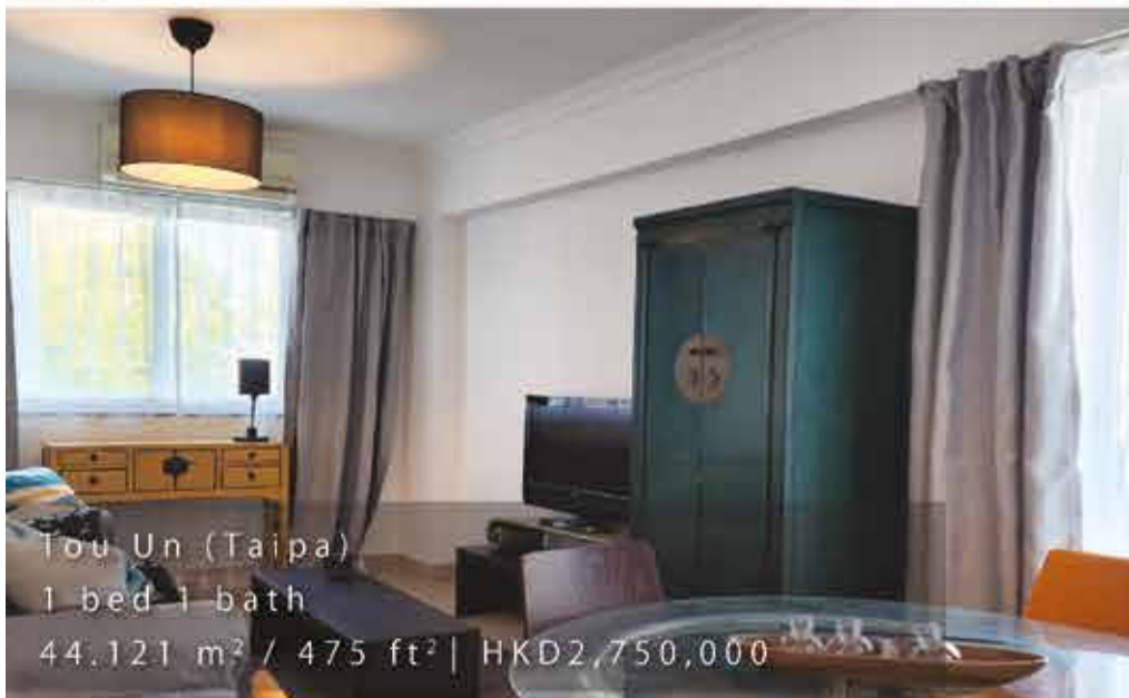
Tou Un (Taipa) 1 bed 1 bath 44.121 m 2 / 475 ft 2 | HKD2,750,000