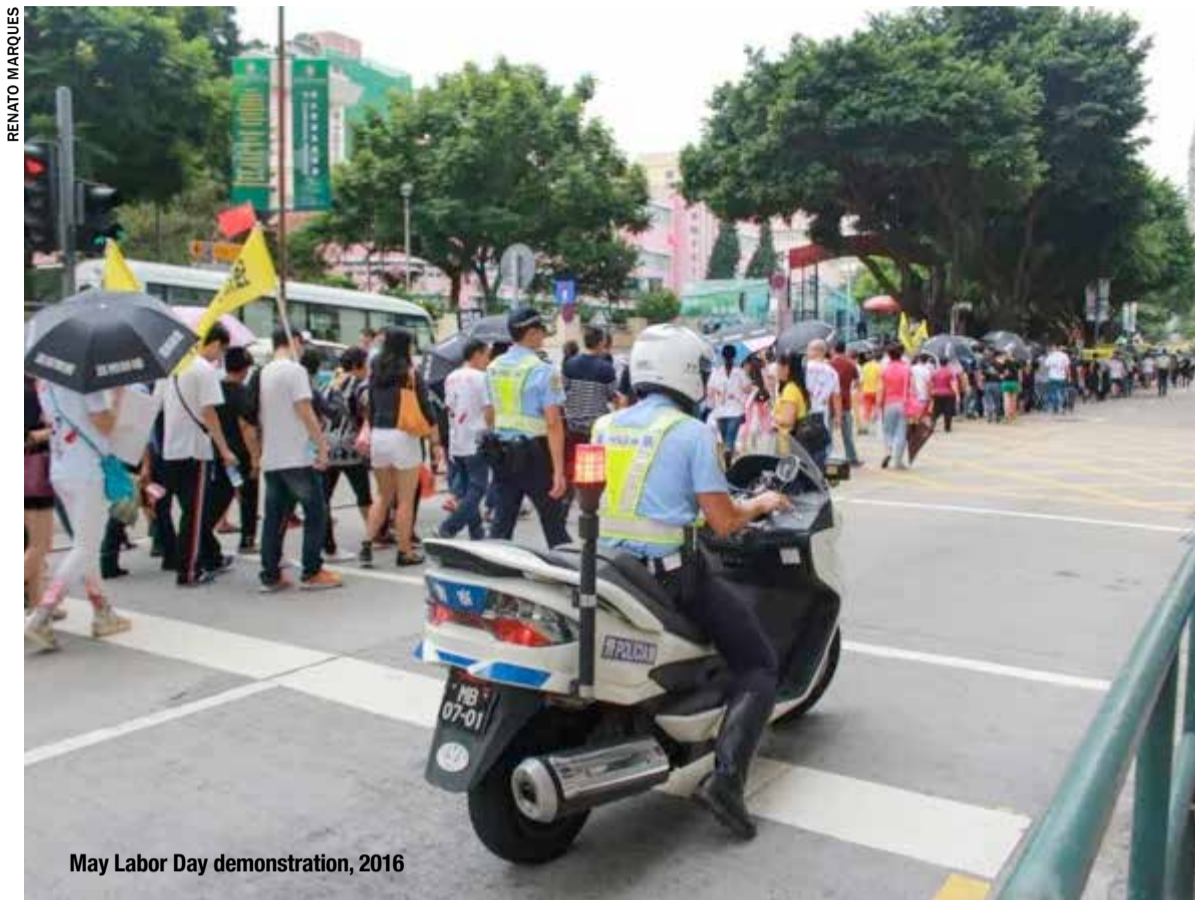
May Labor Day demonstration, 2016

The Meteorological and Geophysics Bureau (SMG) has issued an orange hot weather alert, warning residents of extreme heat in the coming days. The Taipa Grande meteorological station reported a scorching 34.6 degrees Celsius yesterday, marking the highest temperature of the year. Yesterday afternoon, the Outer Harbour station recorded an even hotter 37.1 degrees stressing the severity of the current heatwave. The SMG has warned temperatures may soar to 36 degrees or higher in some areas. Authorities have advised the public to take precautions against heatstroke, including avoiding direct sun exposure and staying hydrated.