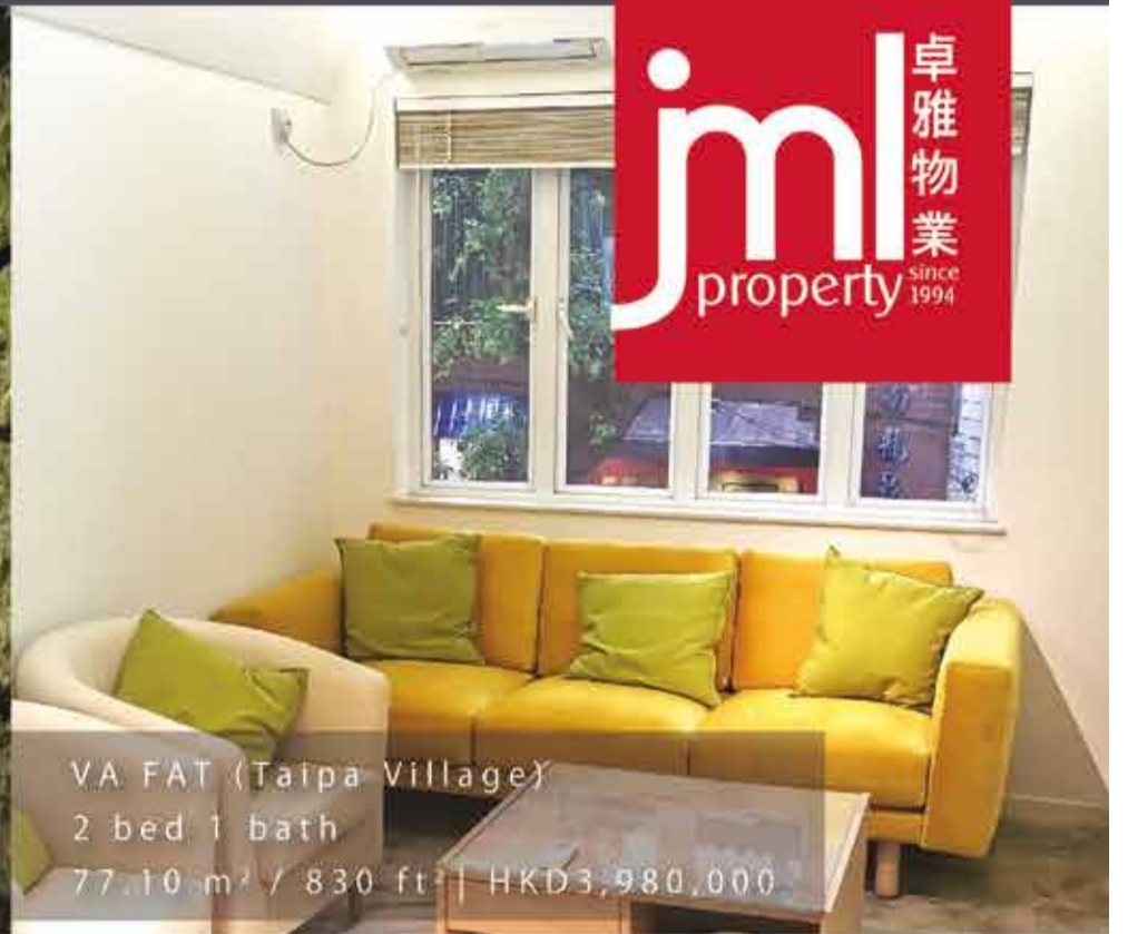
VA FAT (Taipa Village) 2 bed 1 bath 77.10 m 2 / 830 ft 2 | HKD3,980,000