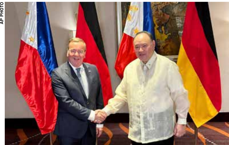
German Defense Minister Boris Pistorius, left, meets with his Philippine counterpart Gilberto Teodoro, Jr. in Manila, Philippines, yesterday