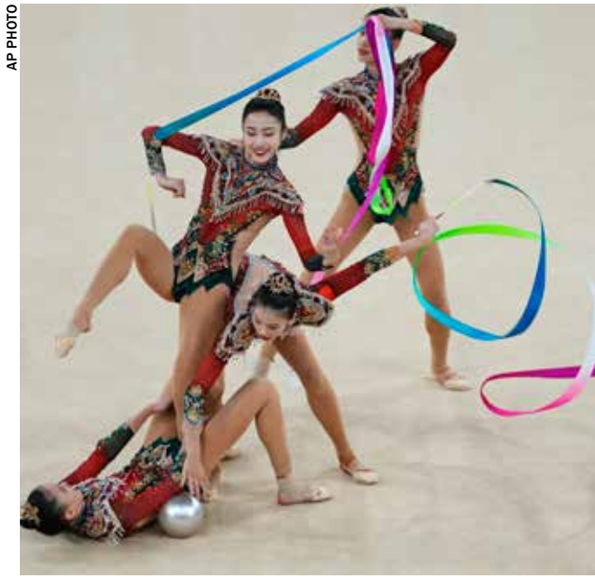
Team China performs with ribbons and balls in the group all-around rhythmic gymnastics final at La Chapelle Arena