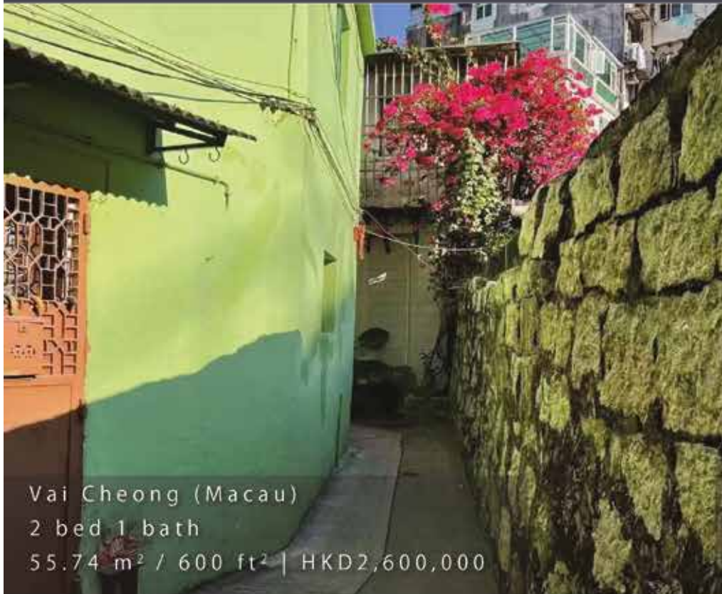
Vai Cheong (Macau) 2 bed 1 bath 55.74 m 2 / 600 ft 2 | HKD2,600,000