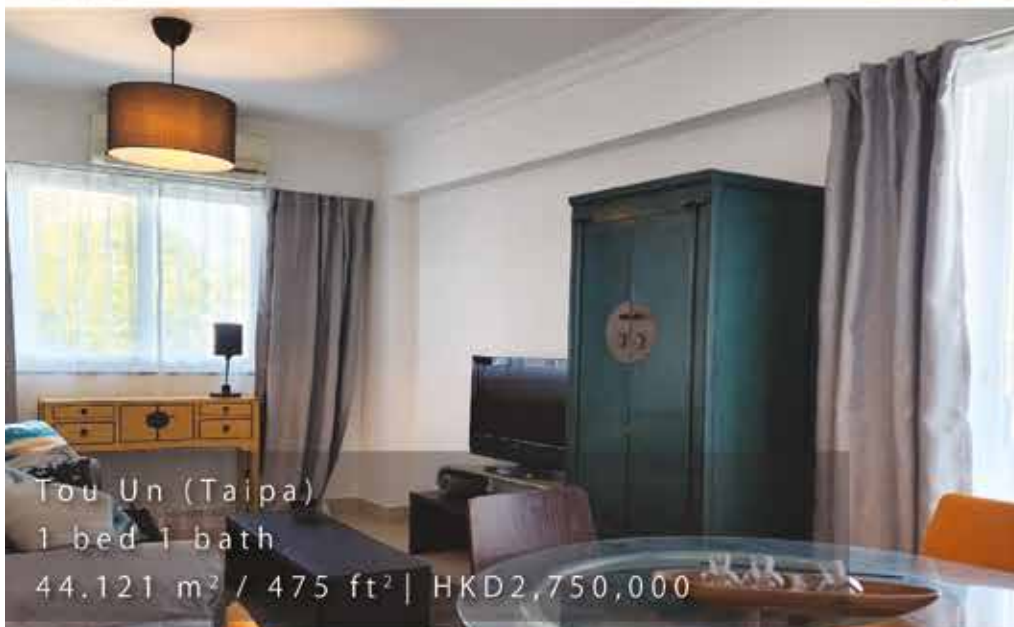
Tou Un (Taipa) 1 bed 1 bath 44.121 m 2 / 475 ft 2 | HKD2,750,000