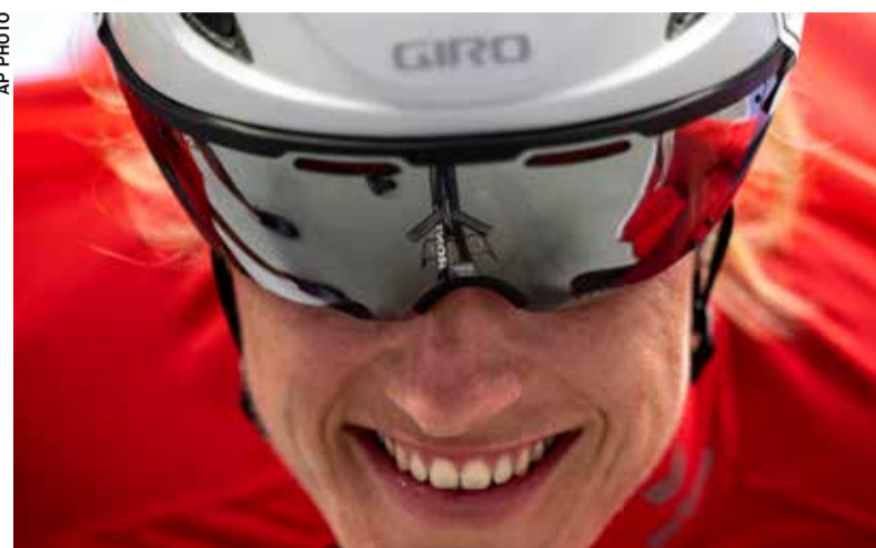
Catherine Debrunner, of Switzerland, celebrates after winning at Women's 5000m - T54 final at the Stade de France stadium, during the 2024 Paralympics, Saturday

Switzerland's Catherine Debrunner opened her six-event