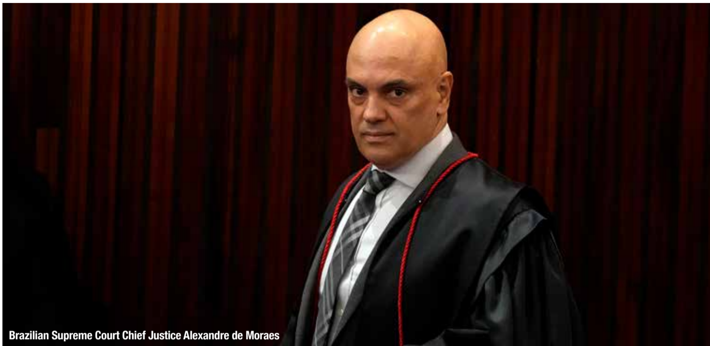
Brazilian Supreme Court Chief Justice Alexandre de Moraes