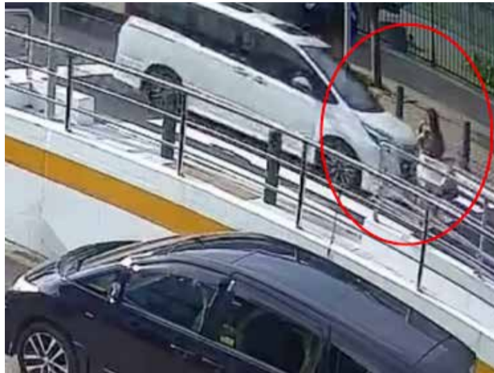
A screenshot from a video shows a woman crossing the zebra crossing just before being struck by a car

Footage of the incident, which has circulated onto