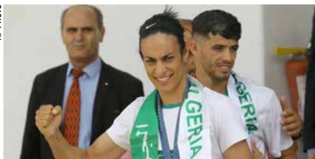
Olympic champion Imane Khelif