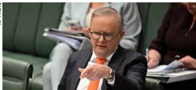
Australian PM Anthony Albanese

The Australian move comes as parents increasingly call for their children to be protected online