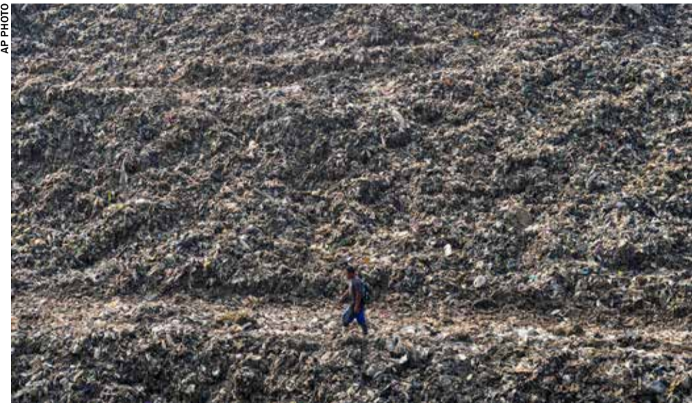
A pile of garbage at a landfill in Depok on the outskirts of Jakarta

It was the second massive Ukrainian drone attack on Russia this month.