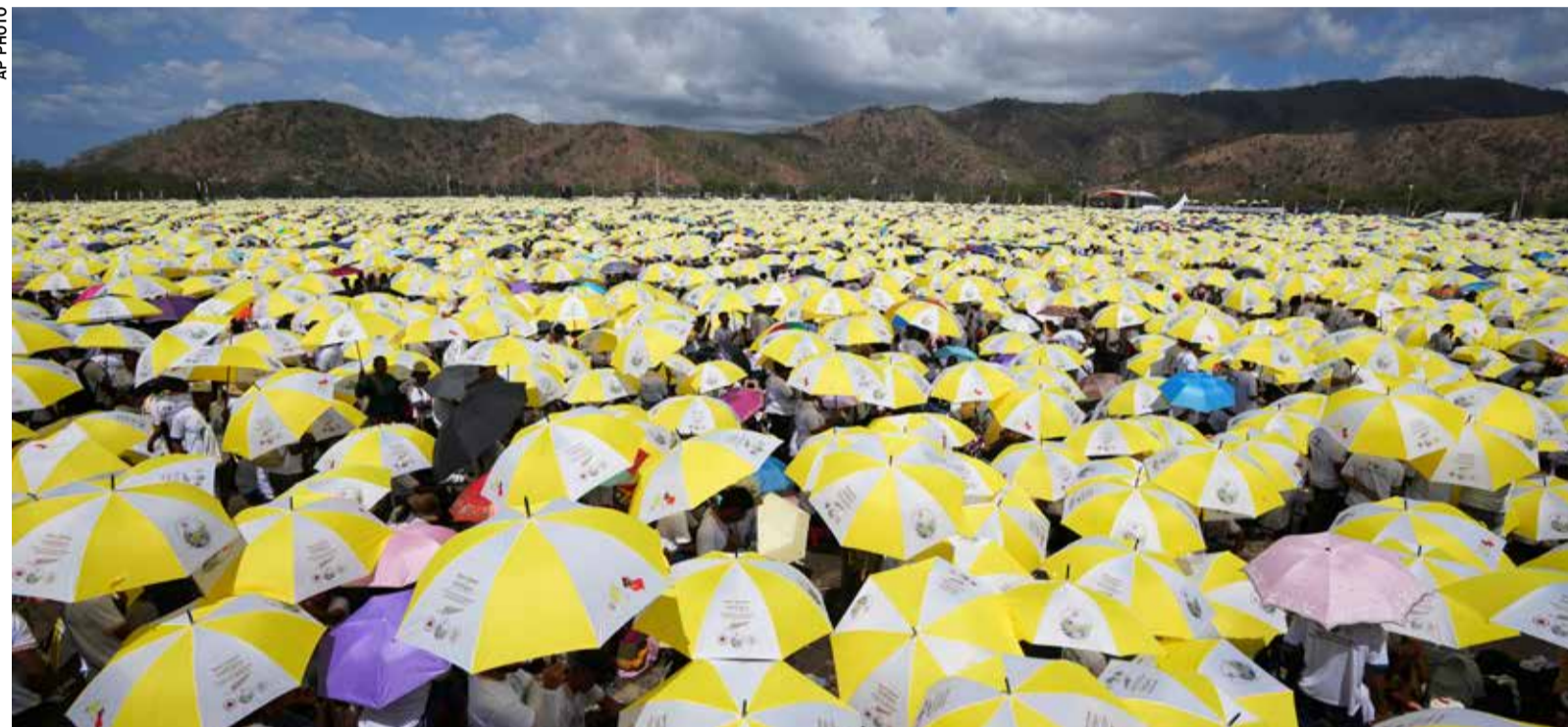
East Timorese crowd Tacitolu park for Pope Francis' Mass in Dili, yesterday

Tasitolu is said to have been a site where Indonesian troops disposed of bodies killed during their 24-year rule of East Timor. Now it is known as the "Park of Peace" and features a larger-than-life-sized statue of John Paul to commemorate his 1989 visit, when the Polish pope shamed Indonesia for its human rights abuses and encouraged the overwhelmingly Catholic Timorese faithful.