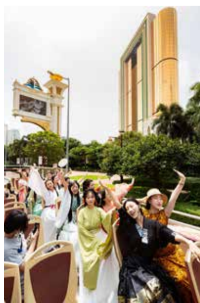
On September 15 and 16, an open-top bus, carrying dozens of enthusiasts dressed in Hanfu, will tour the city, inviting Macau citizens and tourists to engage with and appreciate the timeless beauty of traditional Chinese attire.

blooms in beauty". Guests can further engage with this masterpiece through a WeChat mini-program, enhancing their experience with the enchanting interplay of light and shadow, and winning instant prizes, including tickets to the "Love Between Fairy and Devil" VR Immersive Experience Center during the Mid-Autumn Festival holiday. Every Saturday and Sunday in September at 3 PM, models in traditional attire will also be available for guests to take photos