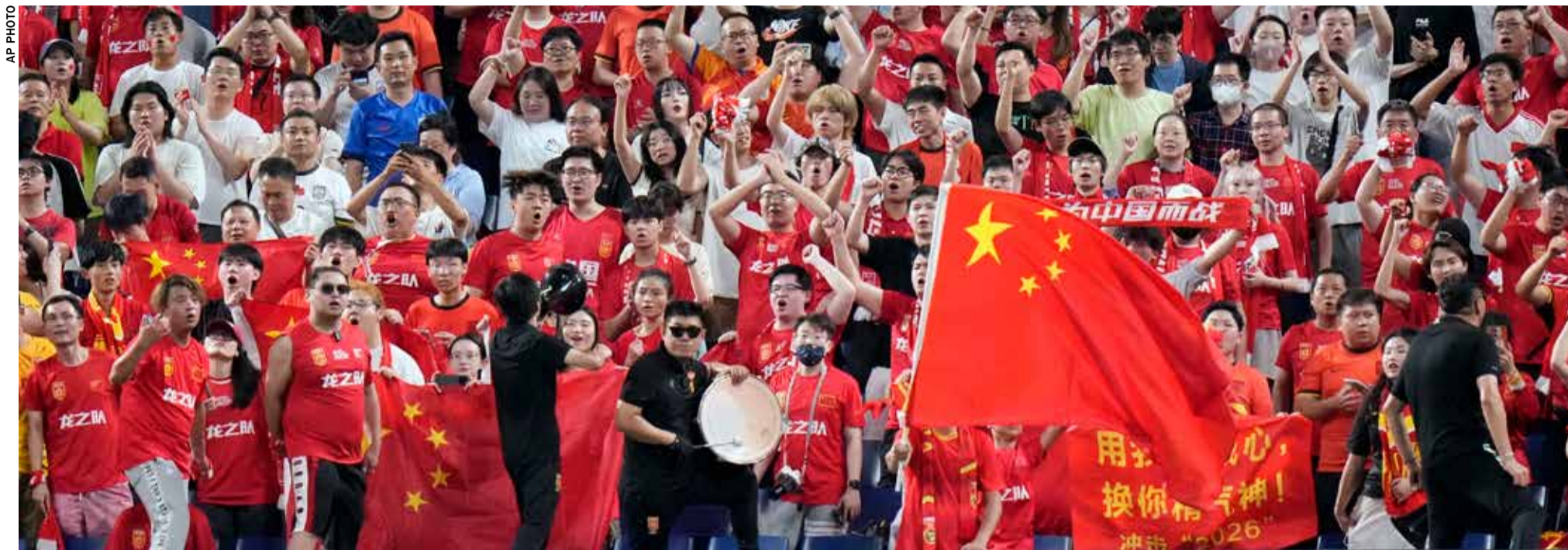
Supporters for Chinese team cheer during a World Cup and AFC Asian Qualifier between Japan and China