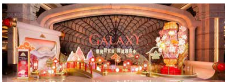
"The Splendor of China", the centerpiece located in the Diamond Lobby, vividly recreates the grandeur of a bygone era, where "the lanterns shine all night, and the city blooms in beauty".

The centerpiece, "The Splendor of China", located in the Diamond Lobby, draws inspiration from an ancient Chinese masterpiece. This exquisite installation features a serene, multi-colored lotus pond meticulously crafted on an elegantly unfurled scroll, with a central lantern symbolizing prosperity, wealth, and peace. This lantern takes the form of a magnificent peony, its petals gracefully opening and closing, evoking the grandeur of a bygone era when "the lanterns shine all night, and the city