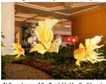
At the entrance of the Crystal Lobby, the "Jumping Fish, Blooming Lotus" installation, featuring two giant goldfish, brings to life a poetic scene of "dancing fish" from a famous poem by Song dynasty poet Xin Qiji.