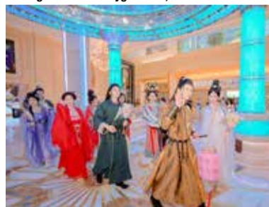
On the evening of MidAutumn Day (September 17th) at 8:45 PM, the highly anticipated Hanfu Parade will debut at Galaxy Macau.