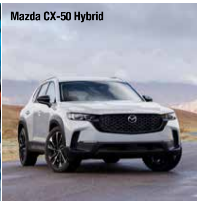
Mazda CX-50 Hybrid