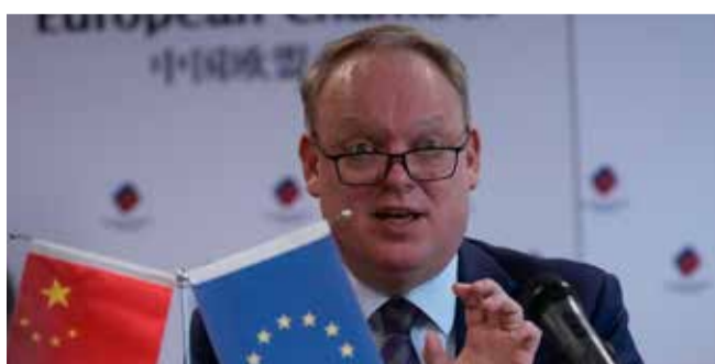
President of the European Union Chamber of Commerce in China Jens Eskelund speaks during a press conference in Beijing, yesterday

With "business confidence now at an all-time low" over lagging domestic demand and overcapacity in certain industries, the annual European Business in China Position Paper called on China to open its economy and allow a more