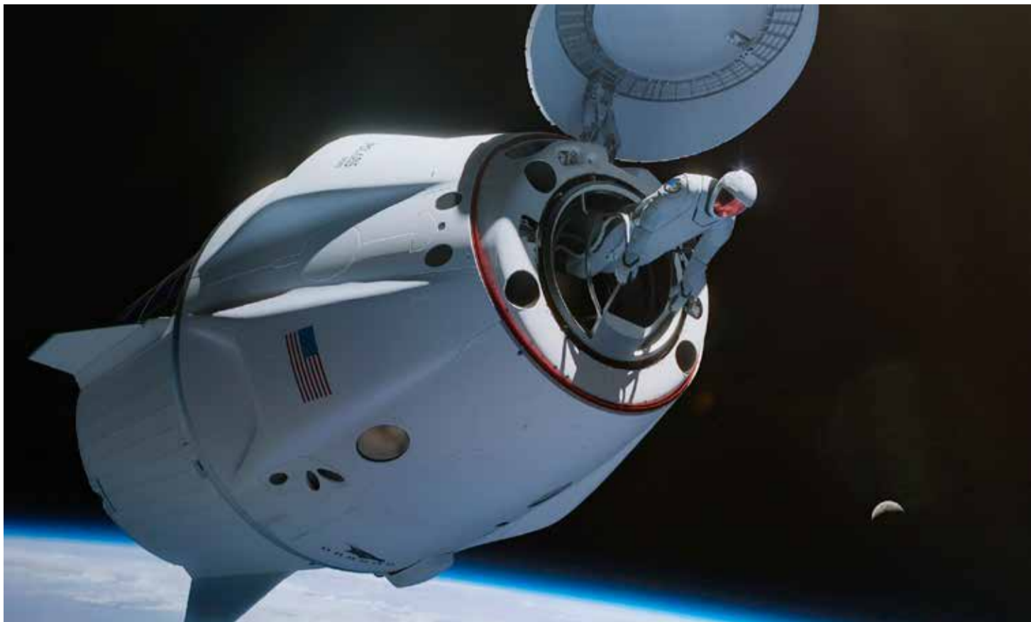
This illustration provided by SpaceX in 2024 depicts a spacewalk from the Dragon capsule