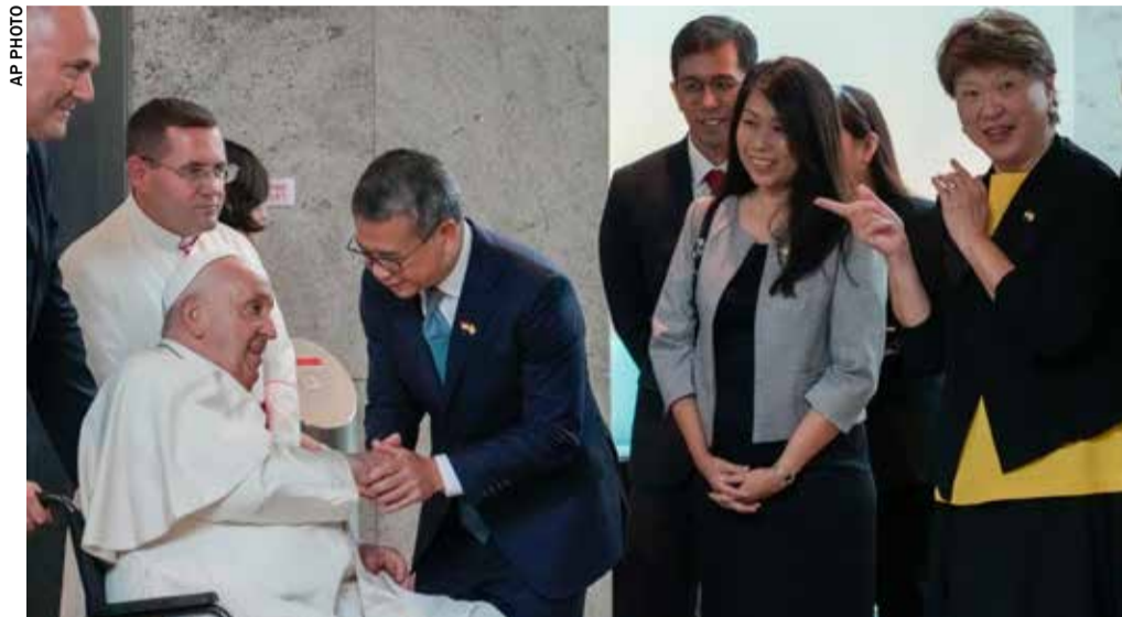
Pope Francis is welcomed by Singapore's Minister of Culture, Community and Youth Edwin Tong and his wife and the Ambassador of Singapore to the Holy at Singapore airport, yesterday