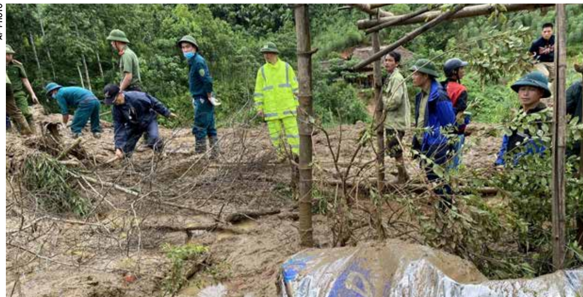
Rescue workers clear mud and debris brought down by a flood in Lang Nu hamlet in Lao Cai province

Floods and landslides have caused most of the deaths, many of which have come in the northwestern Lao Cai province, bordering China, where Lang Nu is located. Lao Cai province is also