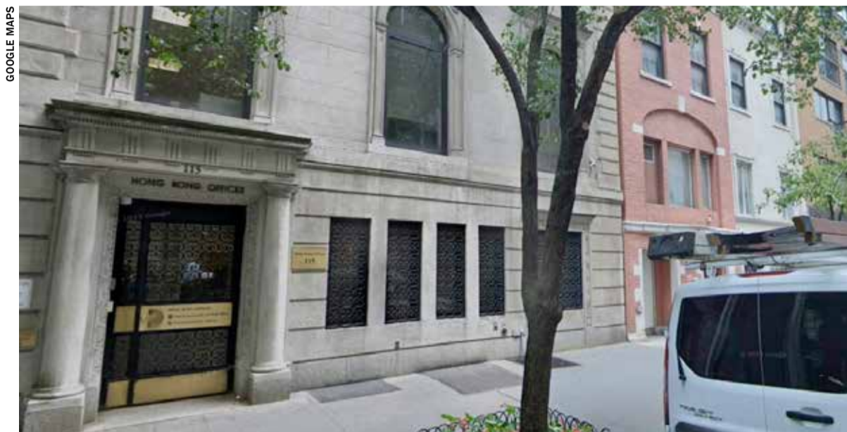
The Hong Kong Economic and Trade Office in New York City

of Commerce in Hong Kong had surveyed its members and found that about 70% of respondents felt no negative impact from the Beijing-imposed security law. He said there are about 1,200 American companies in the city.