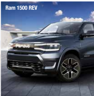
Ram 1500 REV