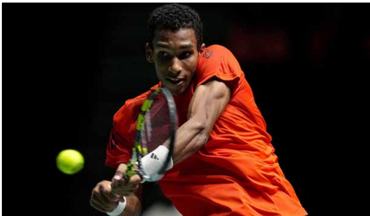
Canada's Felix Auger Aliassime returns the ball to Argentina's Sebastian Baez during the Davis Cup group stage finals match