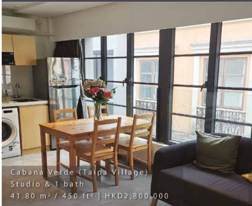
Cabana Verde (Taipa Village) Studio & 1 bath 41.80 m 2 / 450 ft 2 | HKD2,800,000