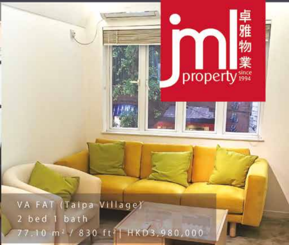
VA FAT (Taipa Village) 2 bed 1 bath 77.10 m 2 / 830 ft 2 | HKD3,980,000