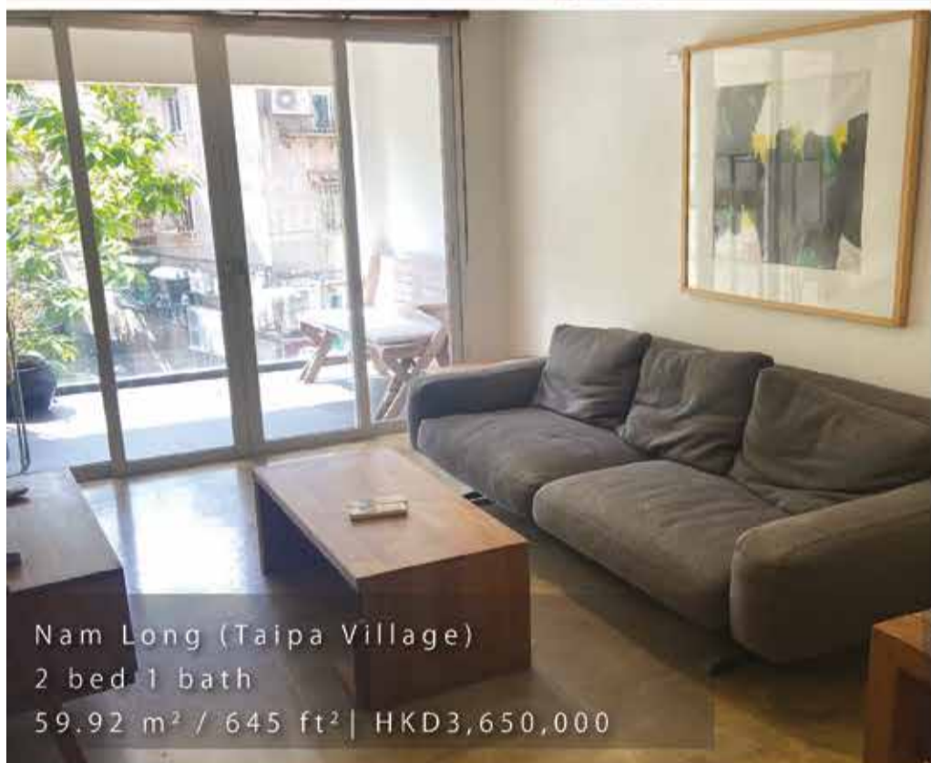
Nam Long (Taipa Village) 2 bed 1 bath 59.92 m 2 / 645 ft 2 | HKD3,650,000