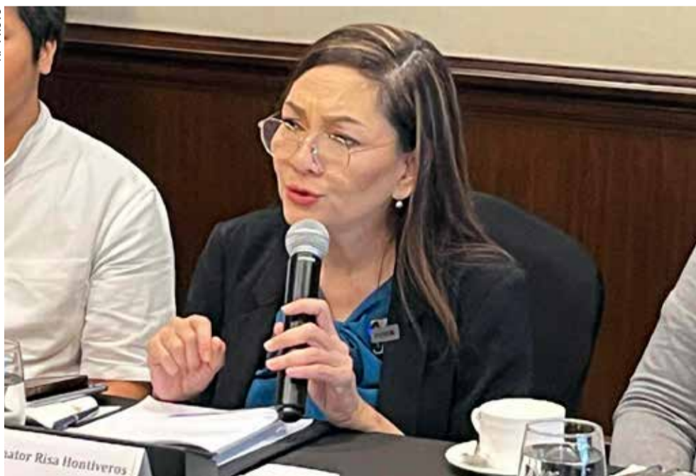
Filipino Sen. Risa Hontiveros, who has led an investigation into the massive online gambling and scam operations in the Philippines, speaks at a news briefing in Manila, Philippines

President Ferdinand Marcos Jr. ordered a ban on online gambling operations in July, saying they