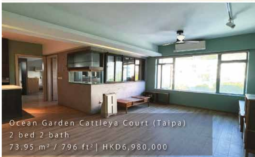
Ocean Garden Cattleya Court (Taipa) 2 bed 2 bath 73.95 m 2 / 796 ft 2 | HKD6,980,000