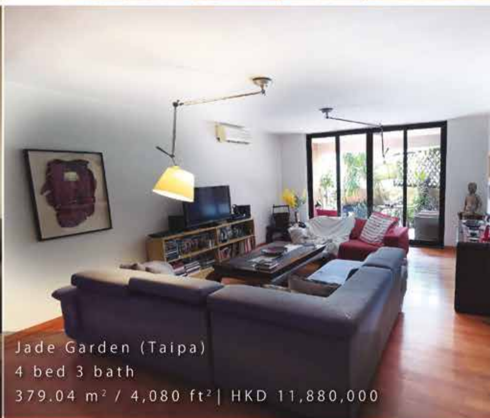
Jade Garden (Taipa) 4 bed 3 bath 379.04 m 2 / 4,080 ft 2 | HKD 11,880,000