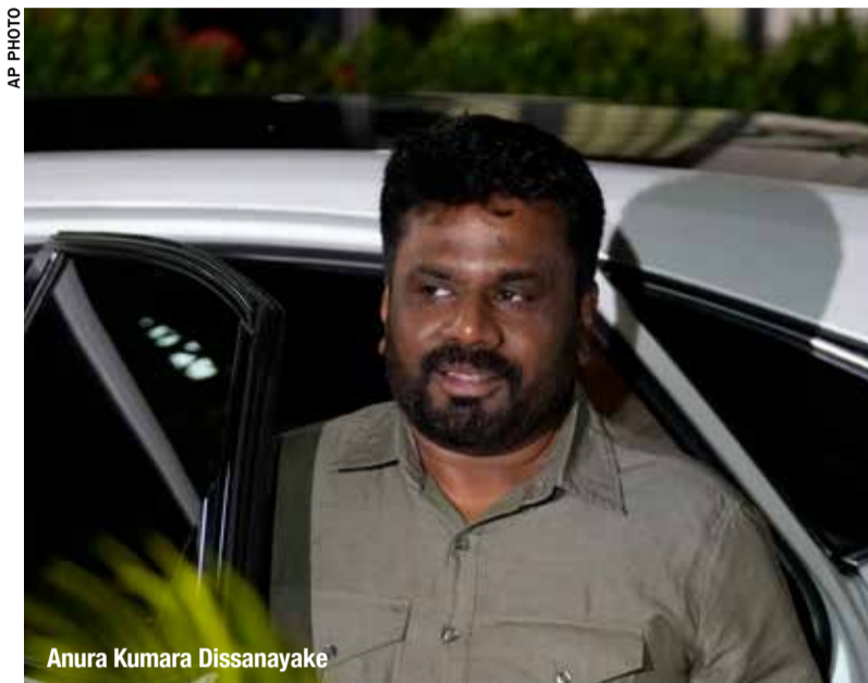
Anura Kumara Dis-sanayake

Dis-sanayake, whose pro-working class and anti-political elite campaigning made him popular among youth, was leading with 47% of total votes counted, followed by Premadasa with nearly 28% and Wickremesinghe with 15%.