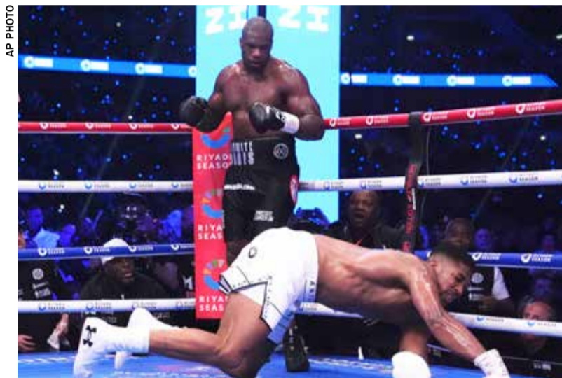
Daniel Dubois, left, knocks out Anthony Joshua in the IBF World Heavyweight bout at Wembley Stadium, in London, Saturday

The 27-year-old Dubois entered the ring first — an unusual twist given he was the champion — to strengthen the feeling this was being treated as a homecoming for Joshua, the decade-long darling of British boxing who was bidding to emulate the