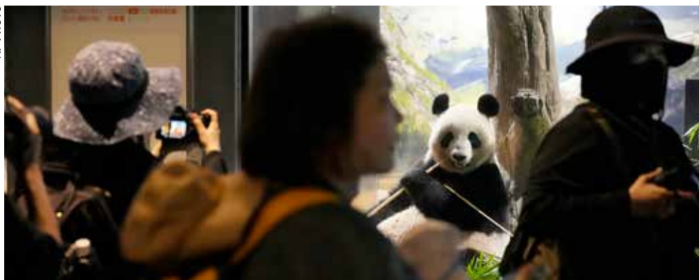
Visitors watch the giant panda Shin Shin at Ueno Zoo, a day before giant panda couple Ri Ri and Shin Shin's return to China, Saturday

T-shirts and carrying items decorated by panda motifs, queued outside