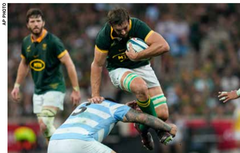
South Africa's Eben Etzebeth, right, is tackled by Argentina's Joel Sclavi during a rugby championship test match at Mbombela stadium in Nelspruit

A side of 10 changes and restocked with World Cup winners led