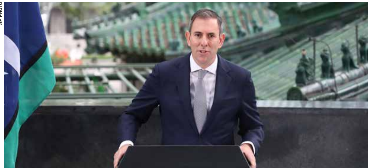
In this photo released by Australian Treasury, Australia's Federal Treasurer Jim Chalmers speaks during a press conference in Beijing, last week

"Our resilience and prosperity are closely connected to China's economy and the global economy," Chalmers wrote in an opinion piece published Friday in The Australian newspaper. He noted that his department forecasts Chinese annual economic growth at below 5% for the next three years, the weakest expansion since the late 1970s.