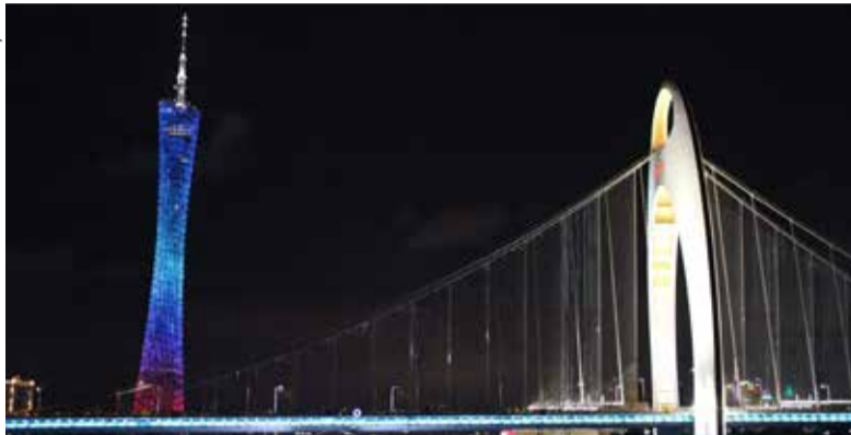
Formally named Guangzhou TV Astronomical and Sightseeing Tower, Canton Tower is seen with the Liede Bridge on the foreground, during a night cruise along the Pearl River

ting for about 11% of the nation’s $17.8 trillion GDP. In comparison, the GBA’s economic output of $2 trillion in 2023 surpassed that of both the Tokyo Bay Area ($1.8 trillion) and the San Francisco Bay Area ($1.3 trillion), according to DBS Bank.