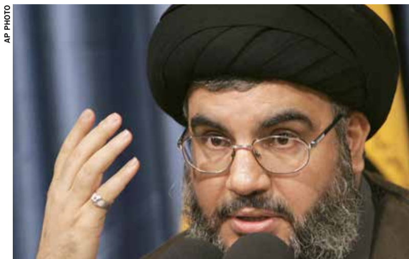
Hezbollah leader Hassan Nasrallah

"President Biden and I do not want to see conflict in the Middle East escalate into a broader regional war," Vice President Kamala Harris said in a statement that echoed Biden's description of a "measure of justice." She added, "Diplomacy remains the best path forward to protect civilians and achieve lasting sta-