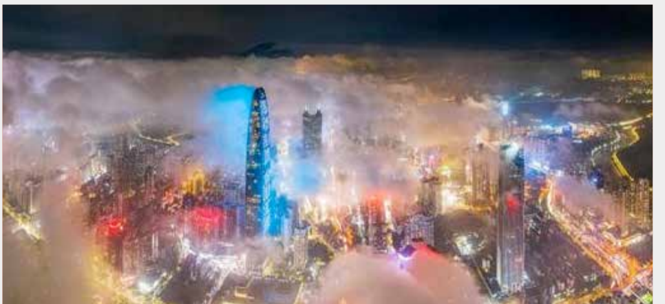
Night view of Luohu district in Shenzhen, Guangdong province

mission is to transform the local music scene “by blending global musical trends with the Greater Bay Area’s vibrant and youthful energy.” The company noted that this approach leverages the region’s musical heritage and entertainment industry, aiming to create unique “experiences that captivate audiences worldwide.”