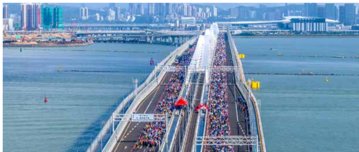
More than 20,000 residents participated in the fun walk at the Macau Bridge yesterday

volumes at Rotunda da Amizade, authorities are exploring adjustments to improve traffic management.