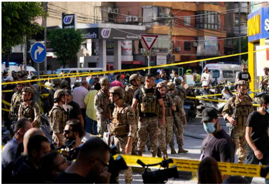
Lebanese soldiers cordon off the area at the site of an Israeli airstrike in Beirut's southern suburbs, last week

The goal was long-term security, with land borders even-