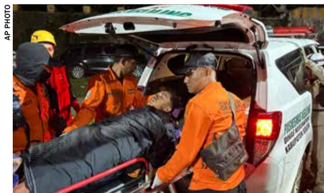
Rescuers transfer a survivor into an ambulance after the landslide, in Solok, West Sumatra, Indonesia, Saturday

Malik said rescuers recovered 12 bodies, revising an earlier death