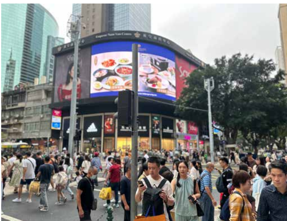
surpass the predicted 100,000.

The MGTO expressed optimism that if weather conditions are favorable during the National Day holiday, average daily visitor arrivals could