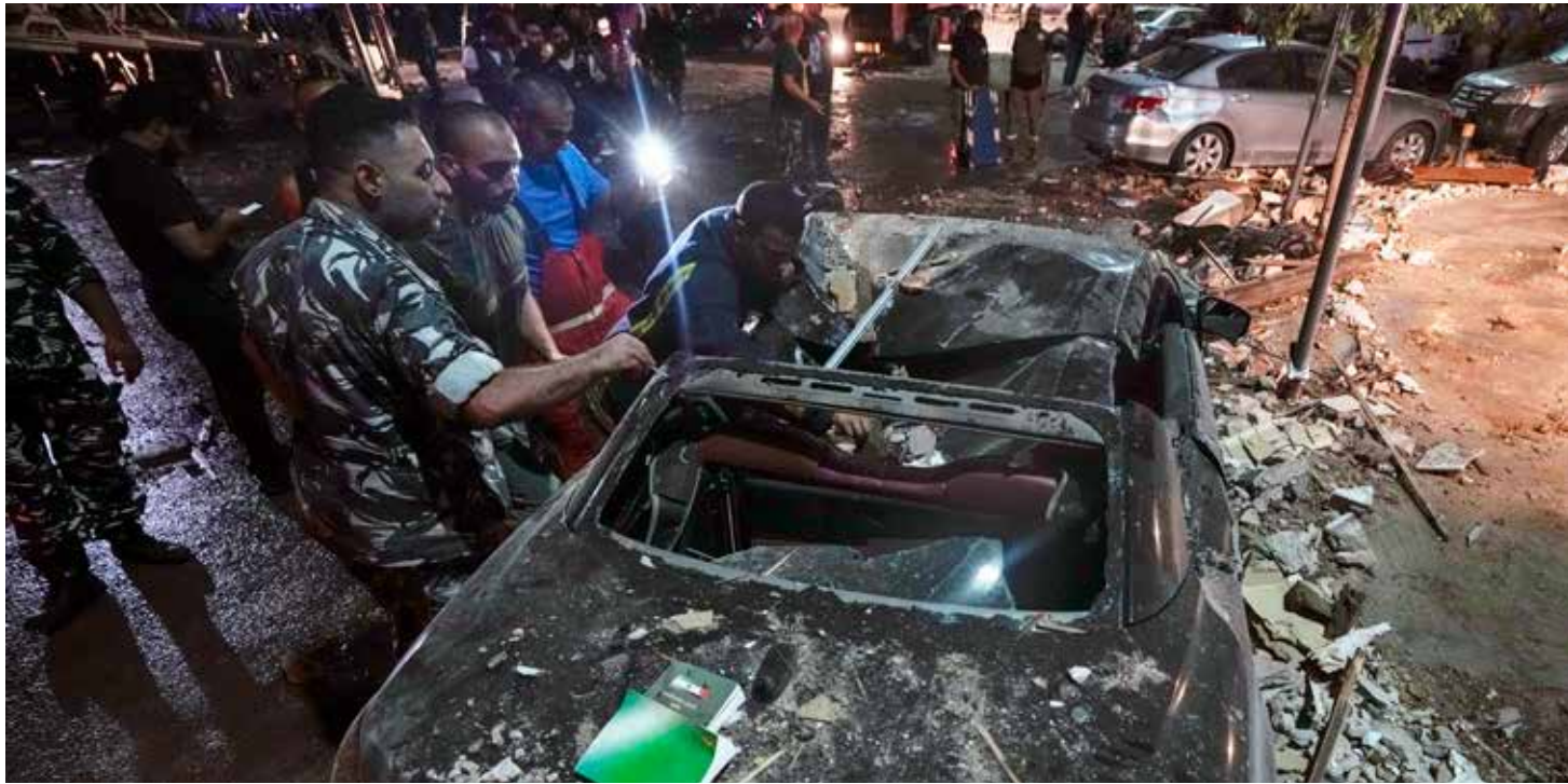
Policemen and civil defense workers inspect a damaged car near a building that was hit in an Israeli airstrike, in Beirut, yesterday