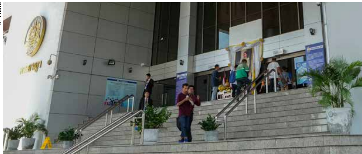
The Bangkok Criminal Court in Thailand's capital

A Thai court yesterday ordered the extradition of a 32-year-old Vietnamese activist detained in Bangkok, despite fears among rights groups he could be at risk if sent home.