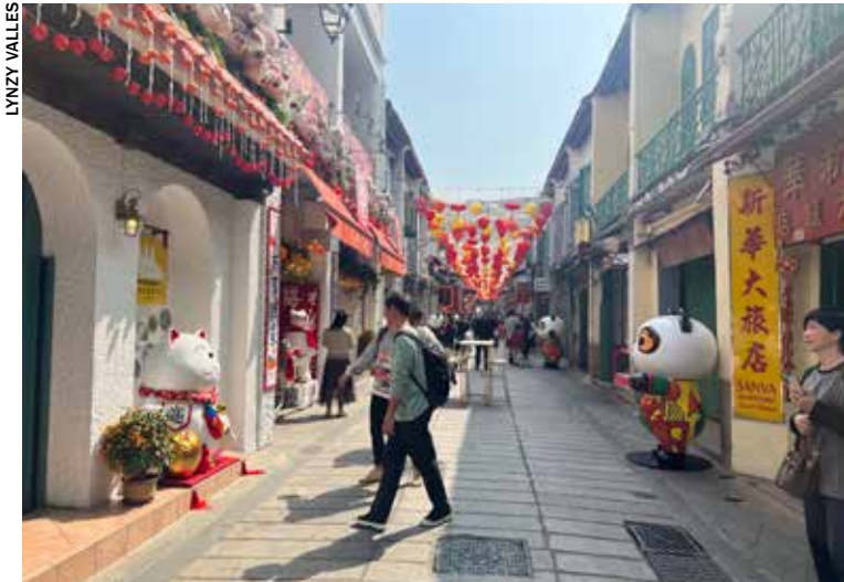
me in October.

The latest scope of traffic optimization measures for this area are expected to be announced after the holiday, some-