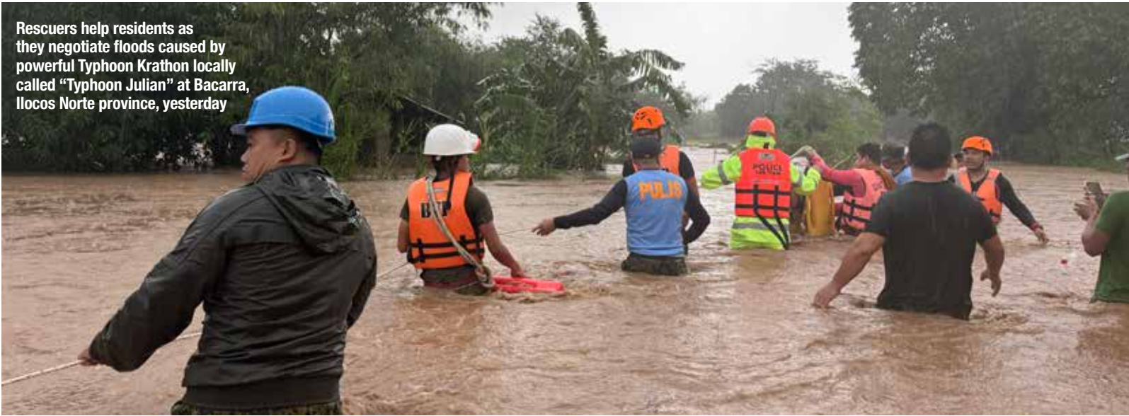
Rescuers help residents as they negotiate floods caused by powerful Typhoon Krathon locally called "Typhoon Julian" at Bacarra, Ilocos Norte province, yesterday

Babuyan islands and Cagayan province and said fierce winds could rip off roofs, topple trees, damage farmlands and whip up high waves.