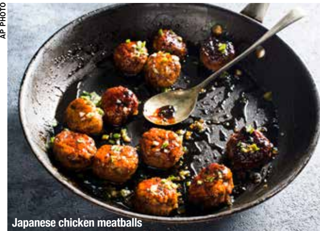
Japanese chicken meatballs

Once lightly browned on the bottom, flip each meatball and add a mixture of sake, soy sauce and mirin that has been simmered with smashed garlic and bruised ginger. Cook, occasionally turning the meatballs and basting them with the sauce, until the exteriors are glazed. To add a little spice to the tsukune, offer shichimi togarashi (Japanese seven spice blend) or yuzu kosho (Japanese chili and