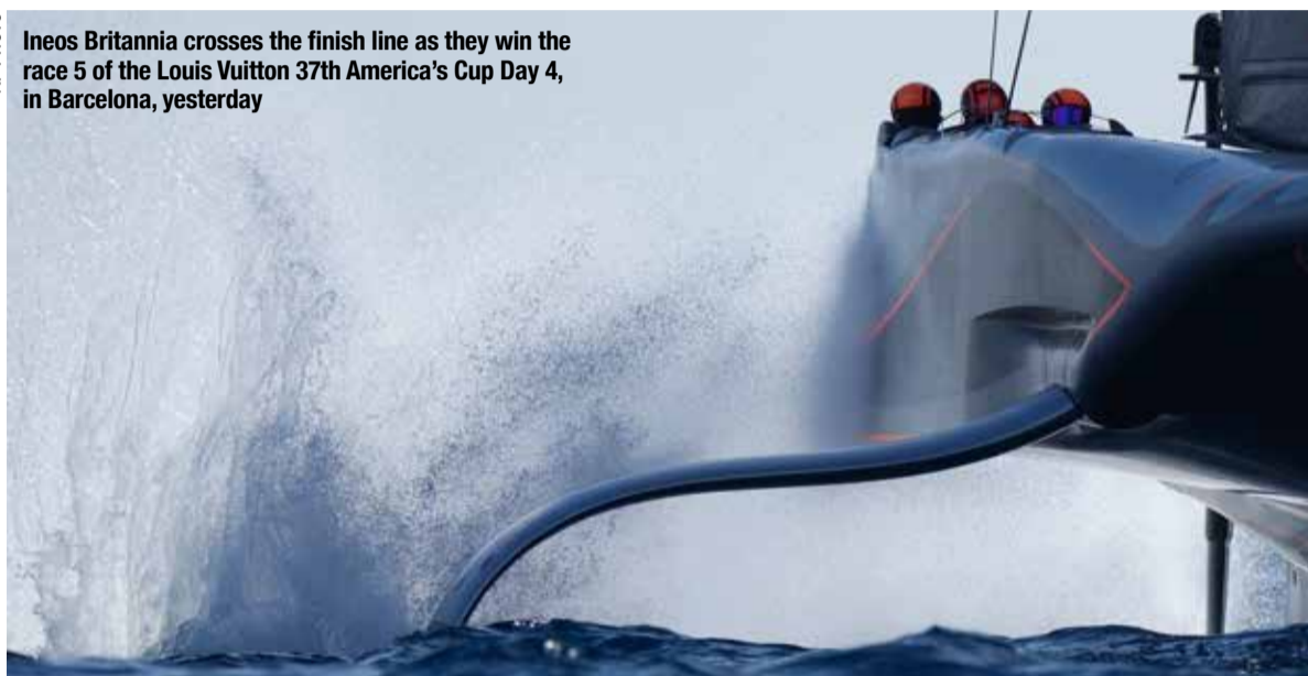
Ineos Britannia crosses the finish line as they win the race 5 of the Louis Vuitton 37th America's Cup Day 4, in Barcelona, yesterday