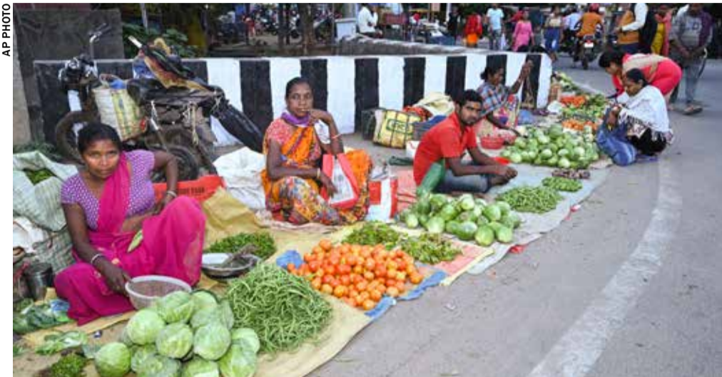
shows vendors selling produce at the Friday Market in Rourkela, India