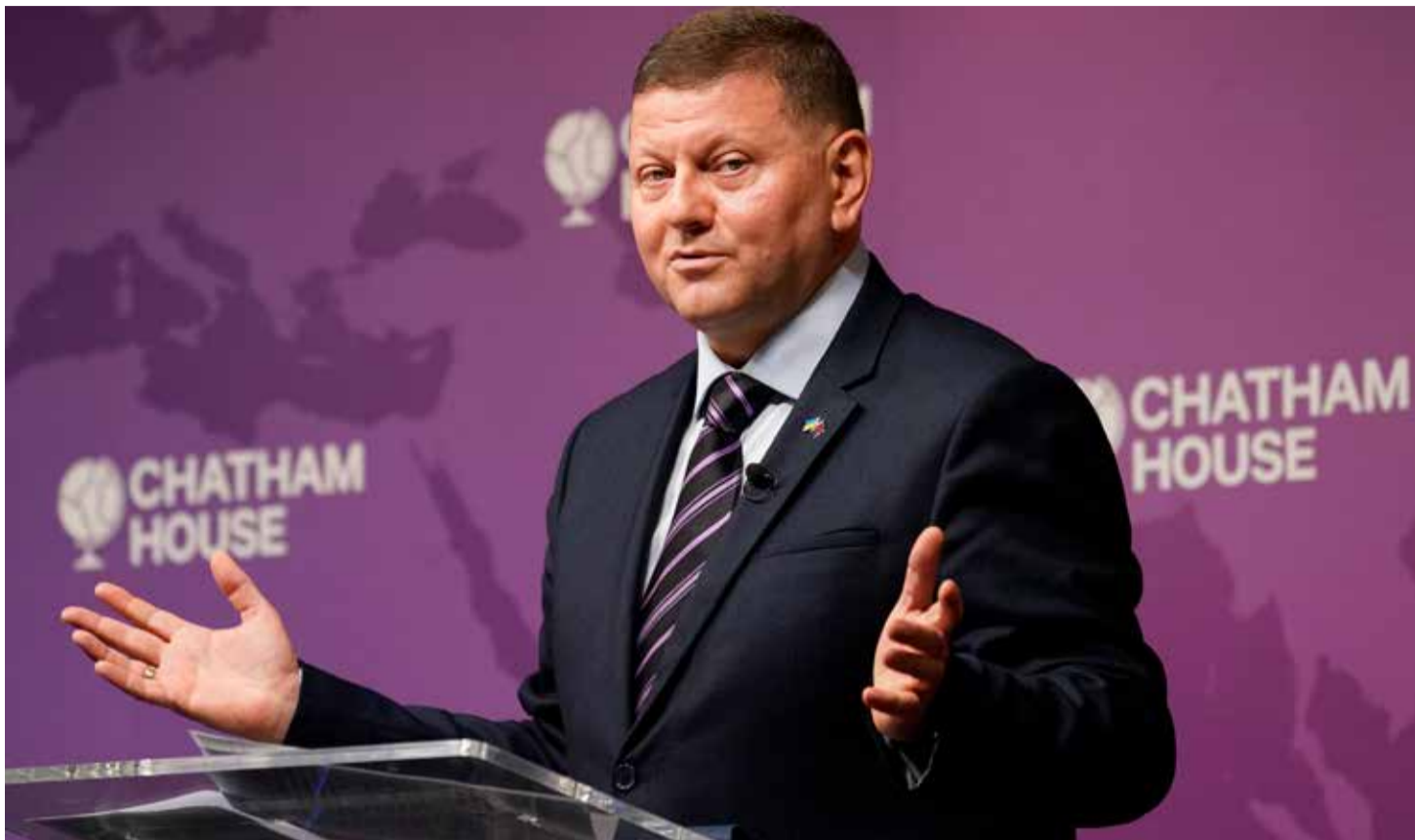
Ukraine Ambassador to UK, Valerii Zaluzhnyi, speaks at a Chatham House event in London, yesterday