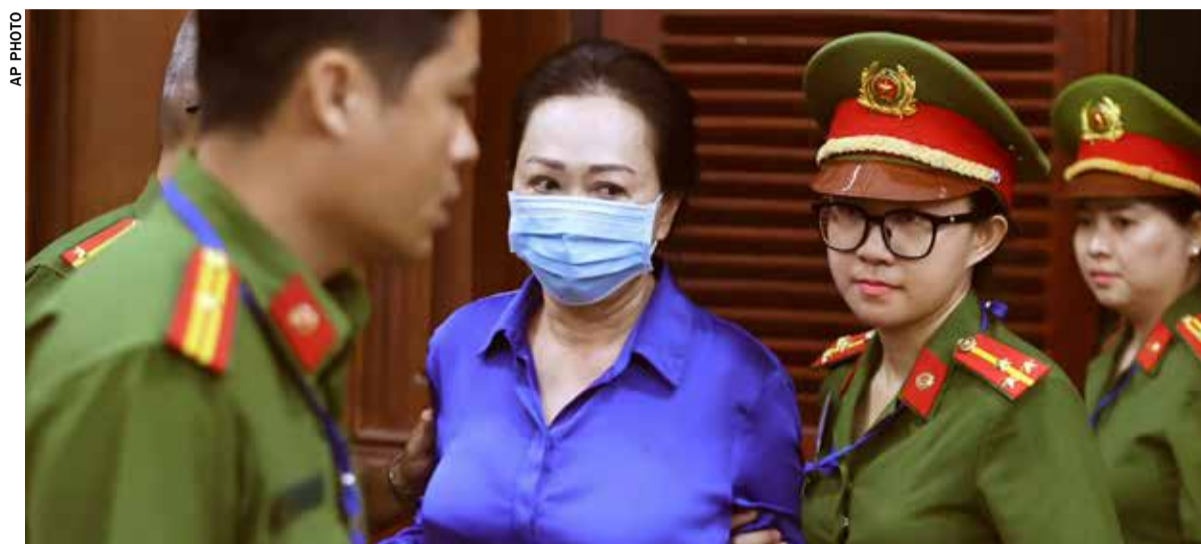
Real estate tycoon Truong My Lan (center) is escorted to a trial in Ho Chi Minh City, yesterday