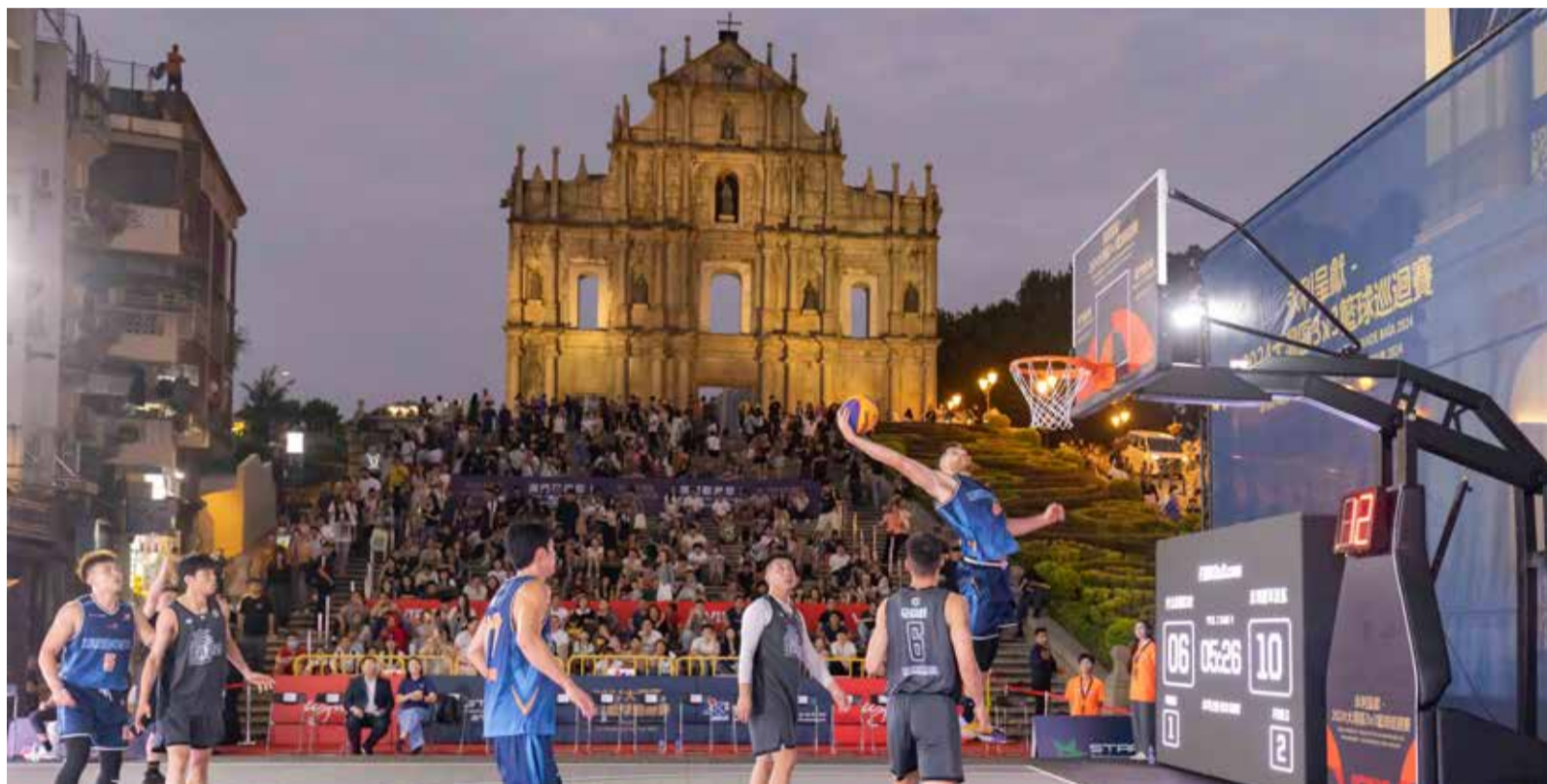
The “Wynn Presents – 3x3 Greater Bay Area Tour 2024” takes place at the Ruins of St. Paul’s, a UNESCO World Heritage Site

BIONARD WOLF UNITED clinched the men’s title and TongJia JianShe won the women’s title in a thrilling series of matches on October 13. On the heels of their victory, BIONARD WOLF UNI-