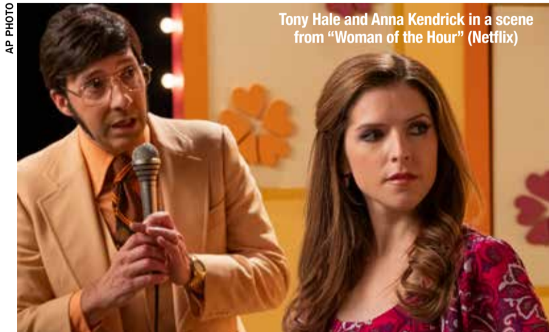
Tony Hale and Anna Kendrick in a scene from "Woman of the Hour" (Netflix)

The tension of those encounters, and how women are forced to handle, and suffer, the bruised egos of men, fuels "Woman of the Hour," a sometimes awkwardly plotted but consistently insightful thriller about the anxiety of the female experience and the grim game of constantly weighing the threat of potential danger in men.