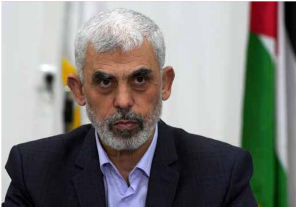
Yahya Sinwar, head of Hamas in Gaza