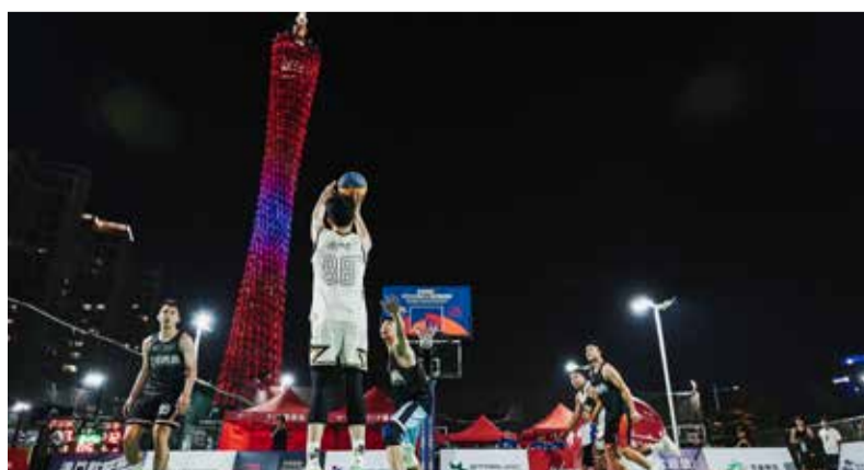
Guangzhou stop of the 3x3 GBA basketball tour