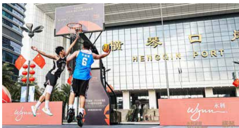
Hengqin stop of the 3x3 GBA basketball tour

Beyond promoting regional and local sports exchanges, the “Wynn Presents – 3x3 Greater Bay Area Tour 2024” was also designed to prepare Macao for the upcoming National Games, particularly with respect to establishing training opportunities for volunteers. Scheduled for November 9-21, 2025, Macao will co-host the Chinese National Games with the Greater Bay Area, featuring several events such as 3x3 basketball.