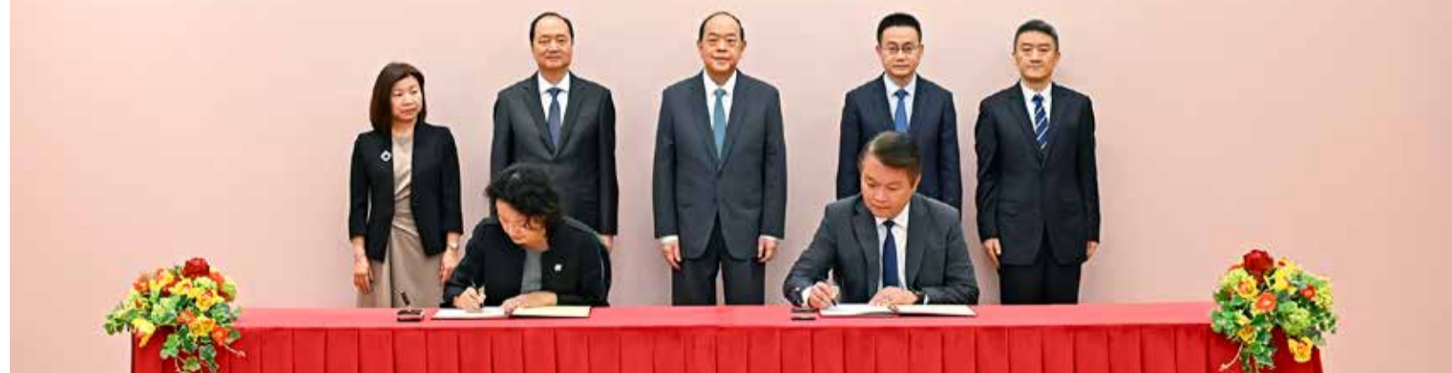
Chief Executive Ho Iat Seng witnesses the signing of the second agreement on amendment to the Mainland and Macau CEPA