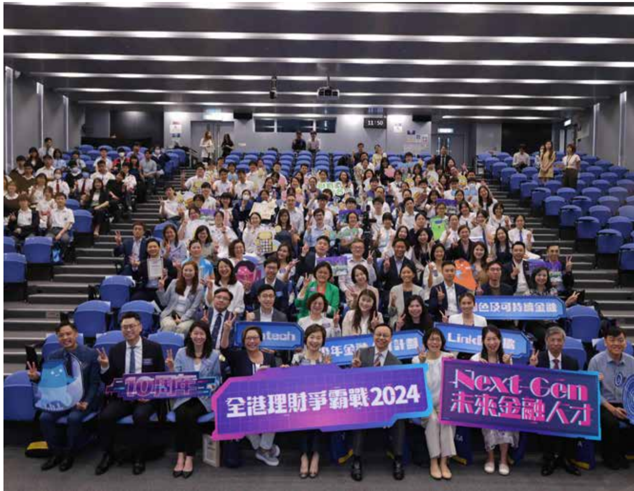
Hong Kong Financial Literacy Championship, supported by Visa for a decade, celebrates its 10-year milestone with 20 partner organisations in attendance and over 150 students and teachers from Hong Kong, Macau and other GBA cities

EMPOWERING YOUNG MINDS DMHC Siu Ming Catholic Secondary School from Hong Kong emerged as the overall champion, with their project titled