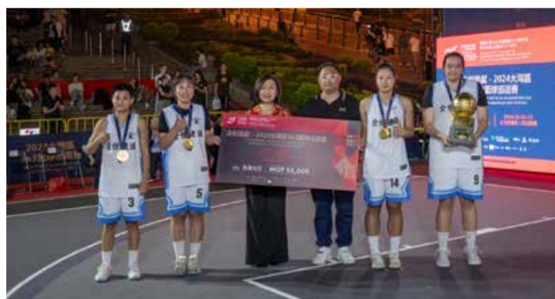
TongJia JianShe win the “Wynn Presents – 3x3 Greater Bay Area Tour 2024” Women’s Championship Title

TED have now secured a place in the FIBA 3x3 WORLD TOUR MACAU 2024, the top men’s 3x3 basketball circuit organized by FIBA, which is scheduled for October 19-20.