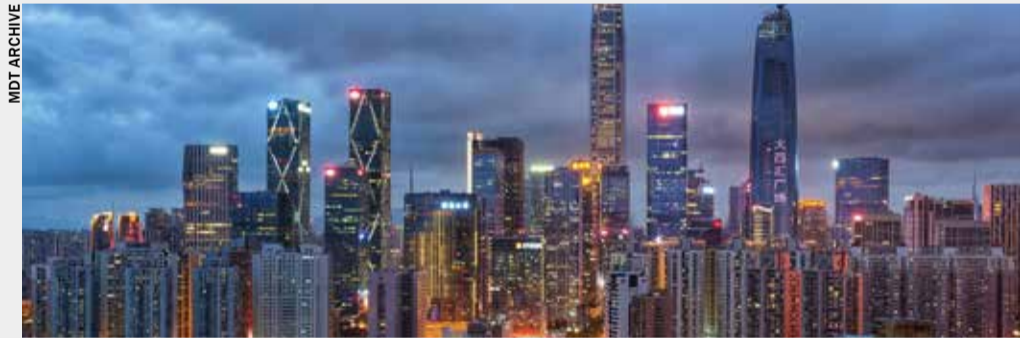
Shenzhen (pictured above) and Guangzhou introduced their versions of stimulus measures for local housing markets

During the holiday, buyers in Shenzhen signed initial purchase contracts for 1,841 new homes, up 664.1 percent from a year earlier, local data showed. Meanwhile, homebuyers signed contracts for 2,316 second-hand homes last week, a weekly transaction record in nearly three years, according to housing agency Leyoujia.