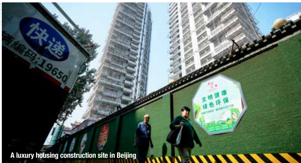
A luxury housing construction site in Beijing

unallocated government bond quotas and to raise debt ceilings to help prop up the property market.