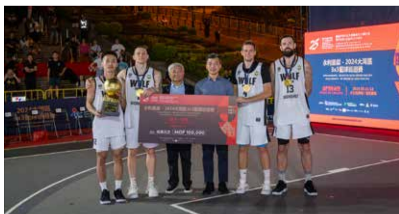
BIONARD WOLF UNITED clinch the “Wynn Presents – 3x3 Greater Bay Area Tour 2024” Men’s Championship Title