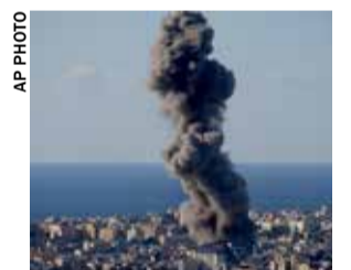
Israel A drone targeted Israeli Prime Minister Benjamin Netanyahu's home amid escalating conflicts with Hezbollah and Hamas. Israel responded with airstrikes on Hezbollah targets in Lebanon, while the U.S. urged Israel to reduce civilian casualties in the intensifying regional conflict.