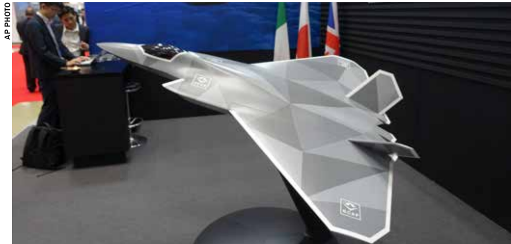
A view of a 1/10 model of a next-generation combat jet Japan to be jointly developed with the UK and Italy for deployment in 2035, on display at a booth of their joint Global Combat Air Program, or GCAP, at the Japan International Aerospace Exhibition, in Tokyo