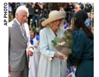
Australia King Charles III and Queen Camilla made their first public appearance in Sydney during their Australian visit. They were greeted by children at a local church, while the monarch's health has led to a reduced itinerary during this trip.