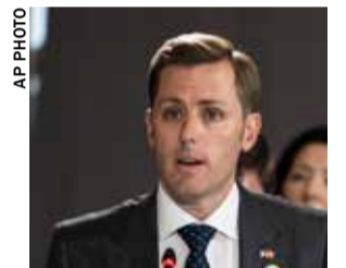
Switzerland The U.S. expressed disappointment after Switzerland decided not to fully adopt the latest EU sanctions against Russia. While Switzerland adopted most of the measures, it allowed subsidiaries to bypass sanctions, a move criticized by U.S. Ambassador Scott Miller.