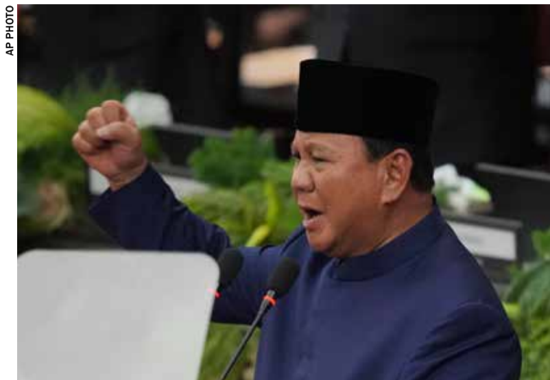
Indonesia's newly-inaugurated Indonesian President Prabowo Subianto delivers a speech during the presidential inauguration ceremony at the Parliament building in Jakarta, yesterday

Wearing a blue Betawi traditional cloth and a dark baseball cap, Subianto stood up in the sunroof of a white van and waved, occasionally shaking people's hands, as his motorcade struggled to pass through the thousands of supporters calling his name and chanting "Good luck Prabowo-Gibran," filling the road leading from the parliament