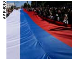
Serbia's President Aleksandar Vucic yesterday spoke with Russian President Putin, affirming his commitment to maintaining relations and refusing to impose sanctions on Russia despite Western pressure. Vucic celebrated Serbia's WWII liberation anniversary, acknowledging Russia's role in the event.

Japan has significantly eased its arms export restrictions to allow foreign sales of the future fighter jet and licensing back of weapons, such as surface-to-air PAC-3 missile interceptors produced in Japan to complement U.S. inventory, which has decreased because of its support for Ukraine.