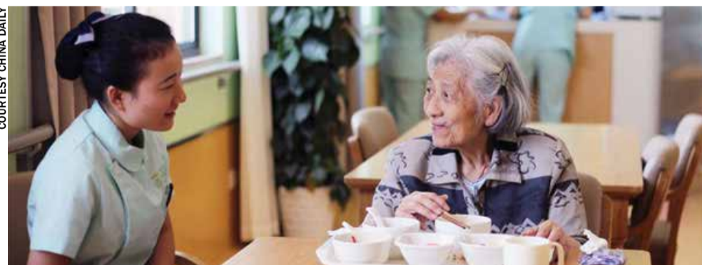
An undated photo shows an elderly woman dining at a nursing home in Hangzhou, East China's Zhejiang province

In 2022, a government crackdown on elder care fraud led to the arrest of 66,000 suspects and the recovery of 30.8 billion yuan ($4.3 billion) in stolen