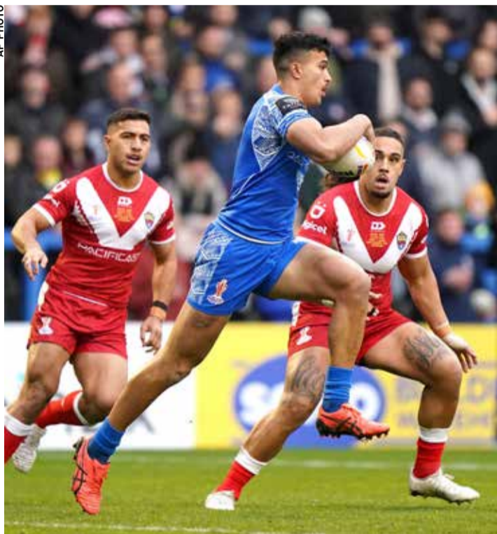
Samoan's Joseph Sua'ali'i in action during the Rugby League World Cup quarterfinal match between Tonga and Samoa

The 21-year-old Sua'ali'i signed a reported A$5.3 million ($3.5 million) contract with the Australian Rugby Union last year. But he didn't officially switch codes until last week, after helping the Sydney Roosters reach the National Ru-