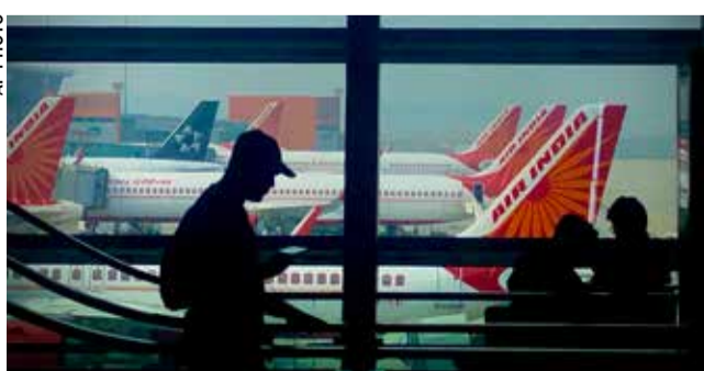
India news agency reported. Civil Aviation Minister

In less than two weeks, more than 120 flights operated by Indian carriers have received bomb threats, the Press Trust of