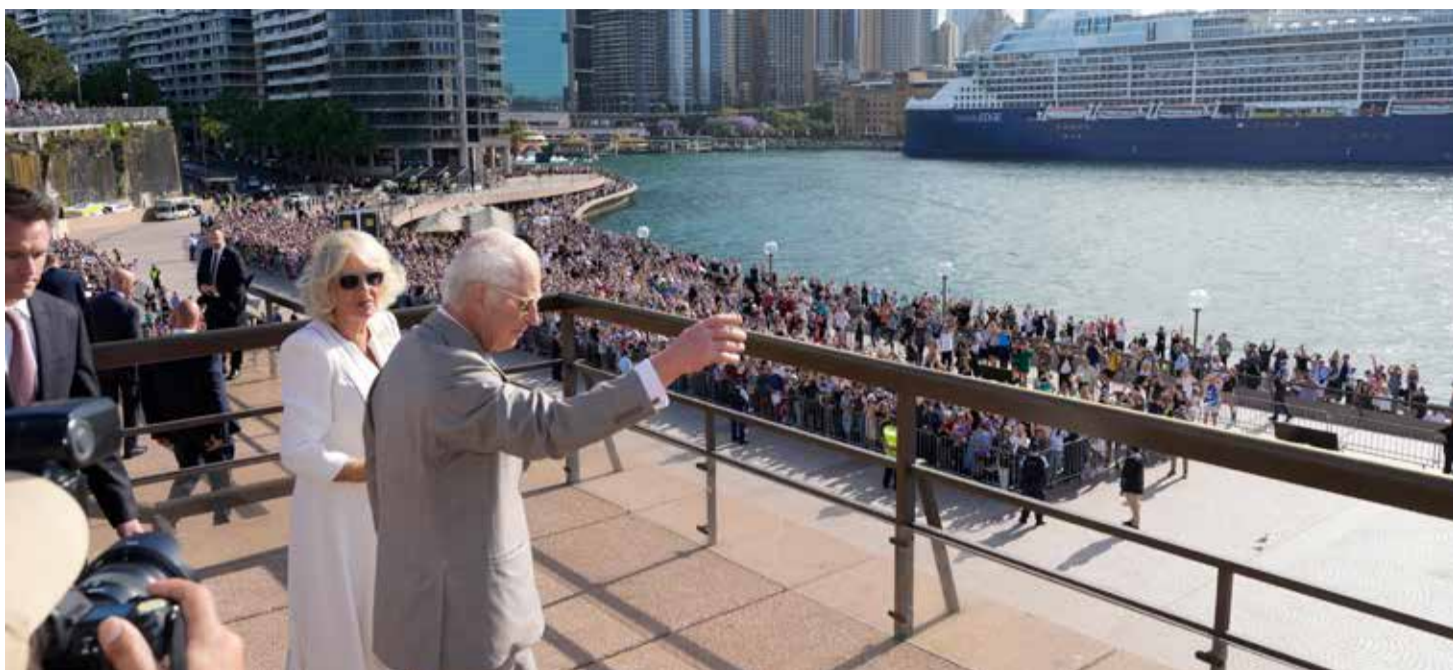
Britain's King Charles III waves to the crowd beside Queen Camilla during their visit to the Sydney Opera House in Sydney yesterday