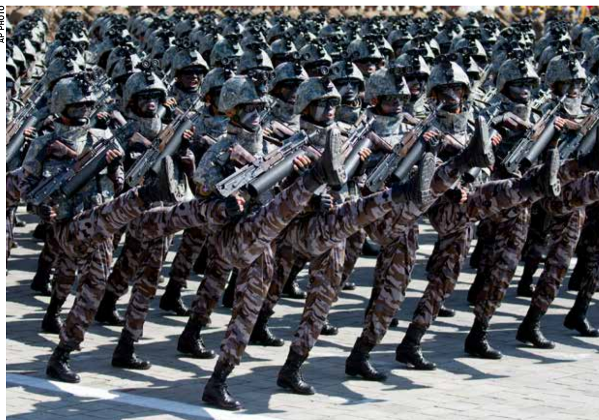
Soldiers march in a parade for the 70th anniversary of North Korea's founding day in Pyongyang, in 2018

Possible steps include diplomatic, economic and military options, and South Korea could consider sending both defensive and offensive weapons to Ukraine, a senior South Korean presidential official told repor-