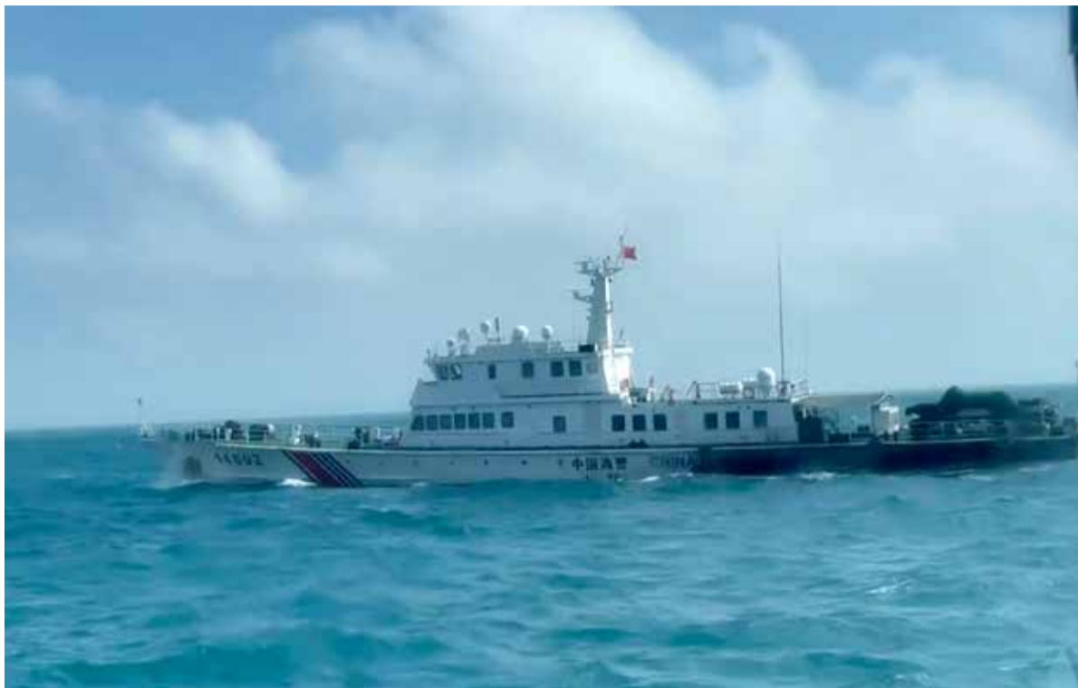
In this screen grab from video released by the Taiwan Coast Guard, a view of a China Coast Guard boat from a Taiwan Coast Guard boat as it passes near the coast of Matsu islands, Taiwan on Monday, Oct. 14