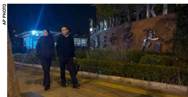
Plainclothes police officers pass by a primary school following a knife attack that occurred on an intersection road near a school in the northwestern Haidian district in Beijing

China tightly restricts private gun ownership, "making knives and homemade explosives among the most common weapons," according to an Associated Press investigation. MDT/AP