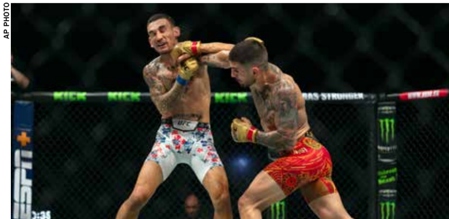
Champion Ilia Topuria (right) battles Max Holloway during a mixed martial arts featherweight title bout at UFC Fight Night in Abu Dhabi

Topuria opened the match with Holloway's traditional gesture of pointing