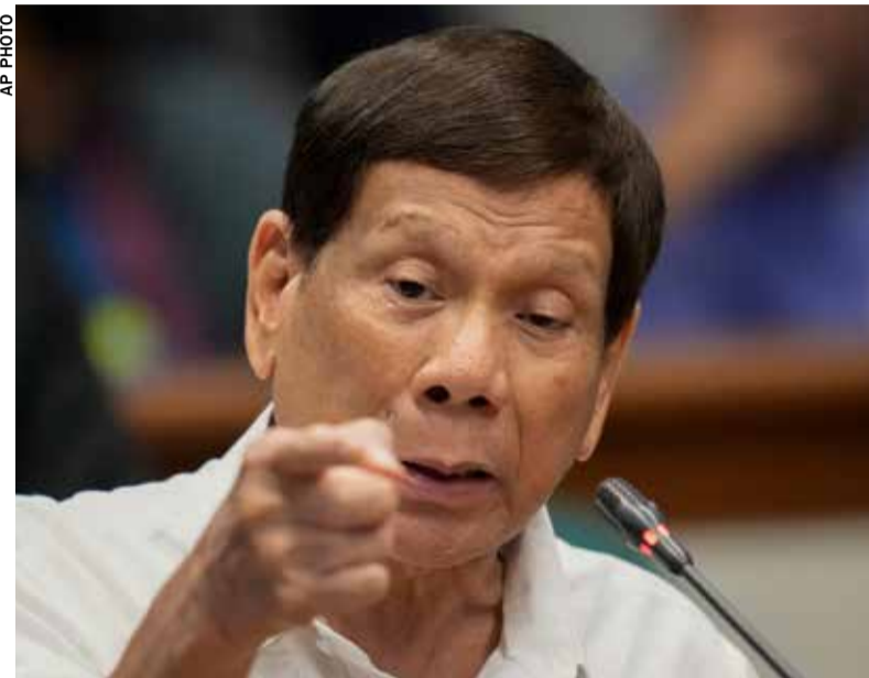
Rodrigo Duterte speaks during a senate inquiry on the so-called war on drugs during his administration at the Philippine Senate in Manila, yesterday

"I'll ask a gangster to kill somebody," Duterte said. "If you will not kill (that person), I will