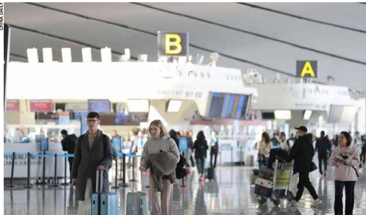
Beijing Daxing International Airport

For instance, United Airlines is set to expand its Los Angeles