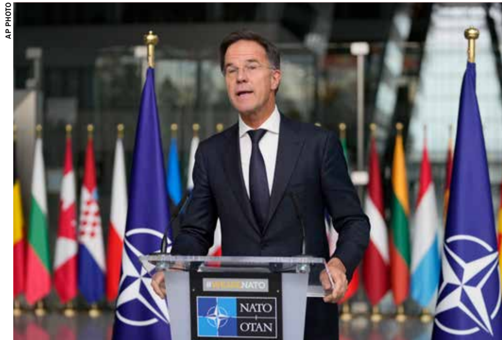
NATO Secretary General Mark Rutte delivers a statement at NATO headquarters in Brussels

On Sunday, Zourabichvili stood alongside opposition leaders and urged Georgians to join a rally on the main street of the capital, Tbilisi, on Monday night to protest what she called a "total falsification, a total stealing of your votes."