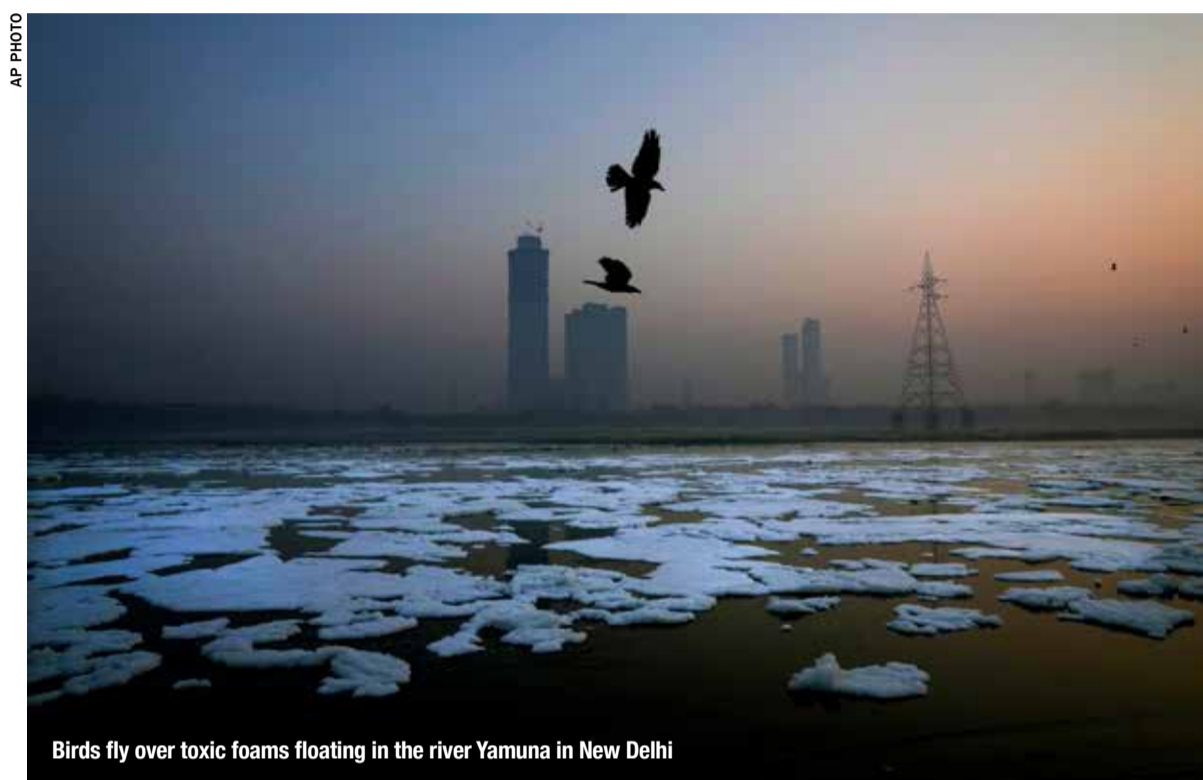
Birds fly over toxic foams floating in the river Yamuna in New Delhi

"I worship the river as a mother, and there is no ques-