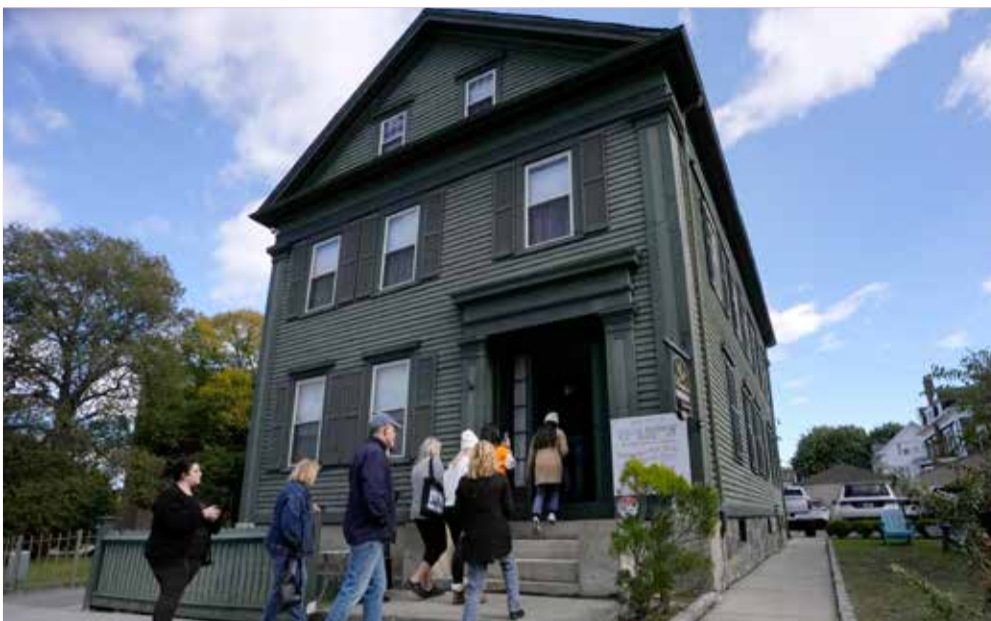
Visitors enter the Lizzie Borden House, site of an 1892 double axe murder, Wednesday, Oct. 16, 2024, in Fall River, Massachusetts