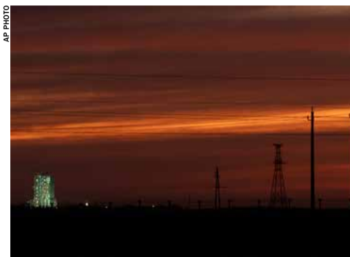
The launch pad for the Shenzhou-19 mission at the Jiuquan Satellite Launch Center

station after being excluded from the International Space Station, largely due to the United States' concerns over the program's complete control by the People's Liberation Army, the Chinese Communist Party's military arm.