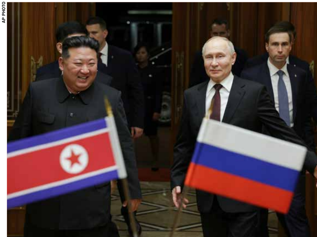
Putin and Kim smile during their meeting at the Pyongyang Sunan International Airport outside Pyongyang, last June