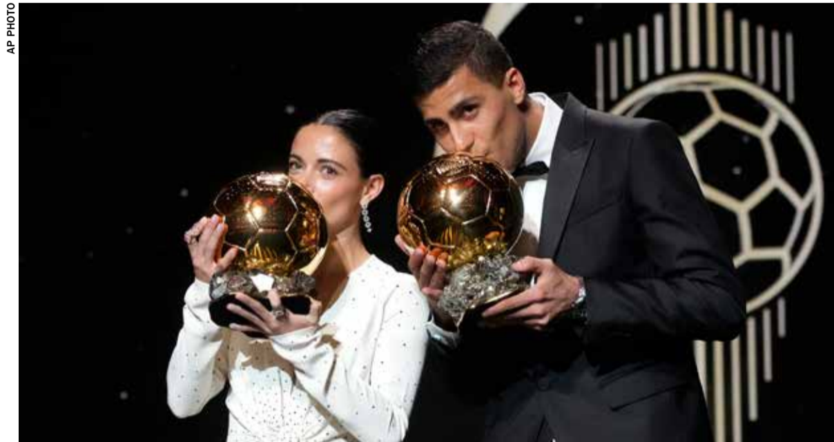
Barcelona's Spanish player Aitana Bonmatí (left) and Manchester City's Spanish player Rodri at the 68th Ballon d'Or (Golden Ball) award ceremony in Paris

Known as a hard-working and unselfish player despite his abilities, Rodri was quick to deflect praise onto others.