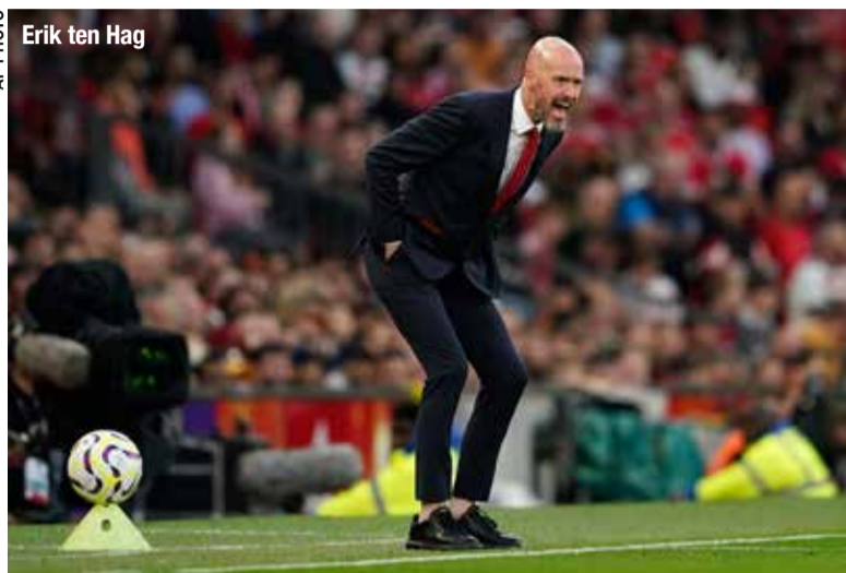
Erik ten Hag

"Attack, attack, attack" is the chant that has often been heard swirling around Old Trafford down the years but goals were