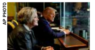
United States President-elect Donald Trump has pressured Senate GOP leader candidates to support recess appointments to bypass votes for Cabinet nominations. This move intensifies debate over executive authority as Trump urges Republicans to accelerate his Cabinet placements.