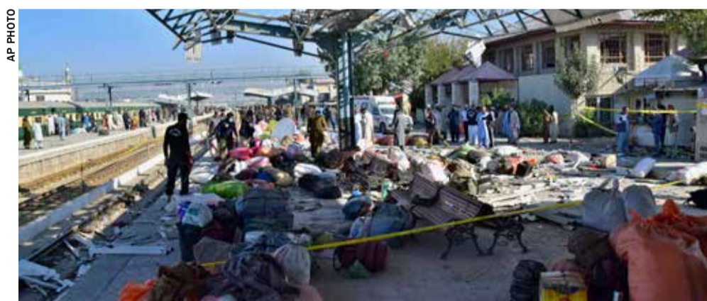
Security officials examine the site of a bomb explosion at railway station in Quetta

The provincial government also declared a three-day mourning period in solidarity with the families