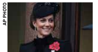
United Kingdom King Charles III led Remembrance Sunday commemorations honoring fallen soldiers, marking his return to official duties after recovering from cancer. The event saw thousands gather for the two-minute silence as the royal family and military leaders participated in remembrance rituals.