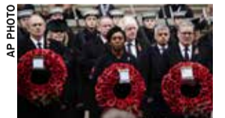
France U.K. Prime Minister Keir Starmer joined French President Emmanuel Macron in Paris to commemorate Armistice Day, celebrating Franco-British solidarity. This marks the first such event with a British leader in attendance since World War II.