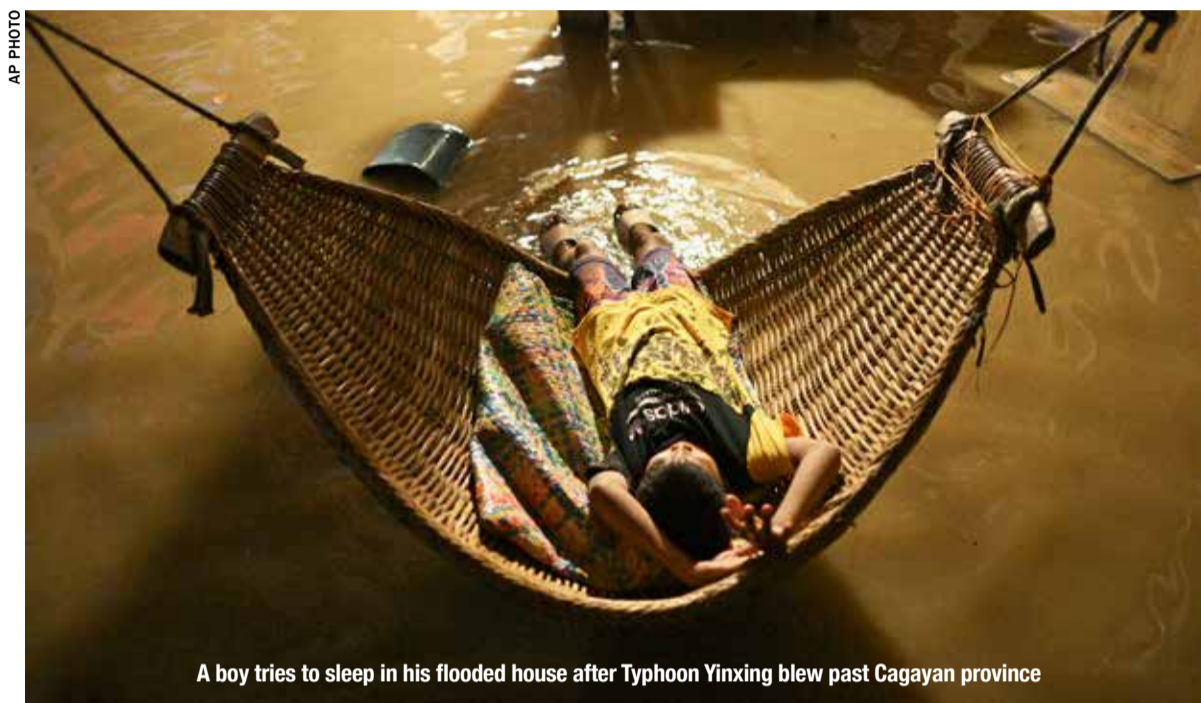
A boy tries to sleep in his flooded house after Typhoon Yinxing blew past Cagayan province

After making landfall in Aurora yesterday morning with sustained winds of up to 130 kilometers (81 miles) per hour and gusts of up to 180 kph (112 mph), the typhoon was expected to barrel northwestward across Luzon, weaken as it crosses a mountain range and then blow into the South China Sea.