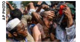
Bangladesh Supporters of Bangladesh's ousted leader Sheikh Hasina clashed with rivals during a rally attempt in Dhaka, as tensions remain high over her potential return. Rivals, including the Bangladesh Nationalist Party, have opposed Hasina's party events, adding to political unrest in the country.