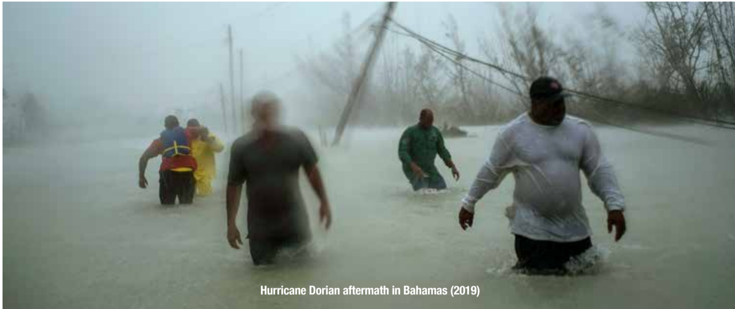
Hurricane Dorian aftermath in Bahamas (2019)