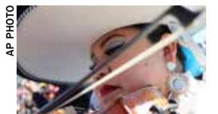
Mexico Over 1,000 mariachis gathered in Mexico City's main plaza, singing classics like "Cielito Lindo," in what may have set a new record. The gathering marked the close of a mariachi congress celebrating this iconic Mexican musical tradition.