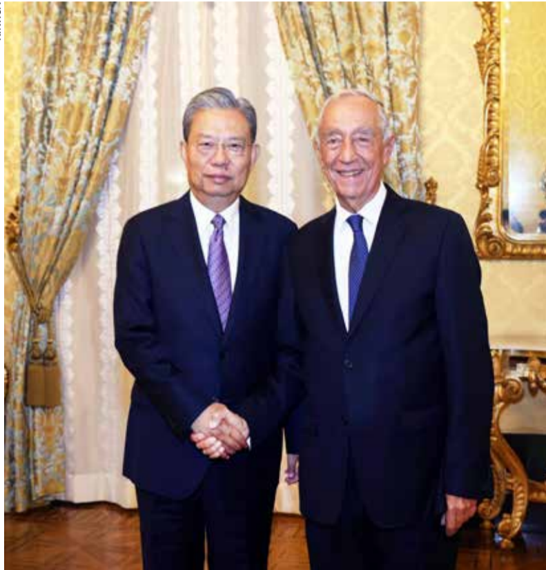
Zhao Leji, chairman of the National People's Congress Standing Committee and Portuguese President Marcelo Rebelo de Sousa in Lisbon, Portugal, Nov. 21

The official said that in recent years, under the strategic guidance of the two heads of state, the China-Portugal comprehensive strategic partnership has been deepening