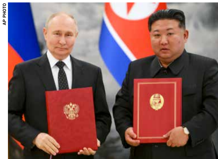
Russian President Vladimir Putin and North Korea's leader Kim Jong Un

the Korea Defense Network in South Korea, said that Russia has likely sent S-400 long-range surface-to-air missiles, launchers and ground-based radar systems. He said that North Korea is capable of building shorter-range surface-to-air missiles on its own.