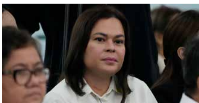
Philippine Vice President Sara Duterte

Executive Secretary Lucas Bersamin referred